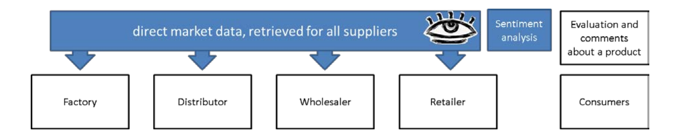
Figure 2. A simple supply chain showing a delay in information transmission along the supply chain and different types of information.