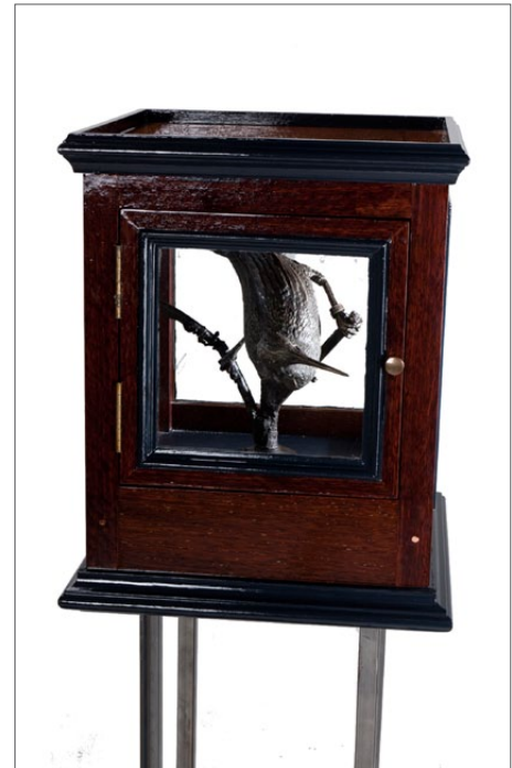
Figure 6. Bronze form and wooden box

With reference to our use of tools, Bolt maintains that moving away from a purely instrumental use of tools towards handability and concerned thinking is a prerequisite to promoting material thinking. Essentially, he is saying that with material thinking, the interaction with materials via the agency of skill moves the intent of the artist away from mere production using tools, into intimate and shared experimentation. This is what the tools and materials partnership can offer the evolution out of the initial conceptual framework—affording a new insight into how knowledge emerges from practice, and also a more open interpretation of the use of the tools themselves (Bolt, 2006).