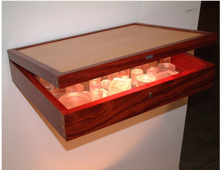
Figure 2. Working in wood

Wax has a wonderfully flexible and varied plastic nature. Cold, it is resistant, brittle, carvable. Warmed, it gives more of itself in the shaping, becoming elastic and malleable, even receiving the maker's fingerprints. Still warmer, it can be rolled and persuaded to do many things its cold condition would not allow. When heated further, wax will become a free agent in pouring, but also restrained when cast into something to contain it, or to create thin sheets for use when cooled. This variety of responses to the maker's attention and tools provides a space in which the artist connects fully with the materials physically, and serendipity can inform the process vitally.