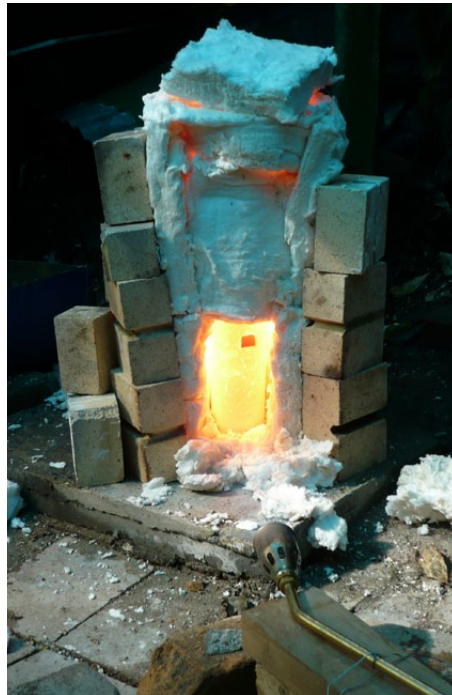
Figure 5. Bronze furnace

Handling of materials is seen as a responsive and responsible set of actions. Gray and Burnett (2007) encourage a respectful interaction with materials and tools that fosters a concern for their inherent qualities and capabilities. Bolt (2006, ibid. ) also refers to “careful and concerned dealings”, that suggest “an alternative ethic to mastery” —the maker’s role would not be in ascendancy over the materials, as manipulation, but would involve close working that recognises fully the latent potential of the materials voice. A respectful interaction with materials enables an emerging artefact to be realised, while maintaining the specific voice of the media (figure 5).