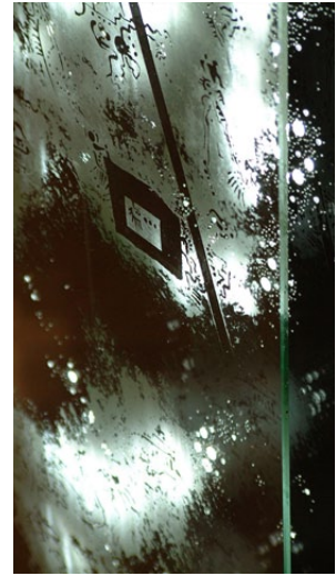
Figure 4. Etched glass

The identity of a material is implied in a resulting artefact, however, invisible dimensions are present. The implicit working association with materials is loaded with intent, an expectation of how the relationship might evolve, and this potential has an emotional charge. The physical intimacy touches deep, internal chords, as the artist shifts into “flow” (Csikszentmihalyi, 1991, p.4). The unseen elements of a varied connectedness hover near a sense of our humanity, our ability to create, and joy in the creating. Making in itself produces happiness, flow and pleasure experienced by the maker and this can be transmitted through the work to the viewer (Margetts, 2011, ibid. ). These experiences and their testimony in the work can hint at universal human sensitivities of contentment and fulfilment common to us all.