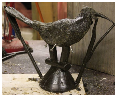
Figure 1. Working in wax

In my practice, working in wax towards bronze, the impetus for resolving media choice reflects on the conceptual rationale. The process from unworked and resistant wax, (figure 1) using heat and tools to form the nascent object, till finalised in noble bronze, begins in the mind and specific understandings. It is then shaped by conditions, foibles, and unforeseen occurrences that need to be responded to, and which often revise the original intent or form itself.