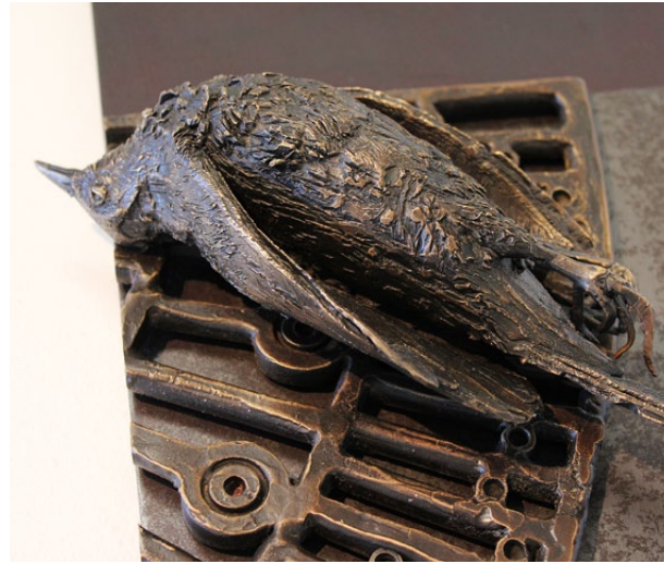
Figure 3. Bronze casting