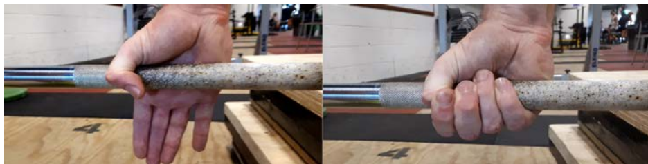
Figure 1. Hook-grip

Competitive weightlifters routinely utilize the hook-grip (HG) (Figure 1) when performing pulling actions (Tsuruda, 1989). Anecdotally, the HG prevents the barbell from rotating in the lifter's hand, thus enabling a secure grip (Tsuruda, 1989). Athletes and coaches report that a minimal amount of muscular effort is required to maintain a secure hold of the bar with a HG. By requiring less muscular tension in the finger flexors (Tsuruda, 1989), the arms remain passive, leading to a greater force transfer from the prime movers of the legs and back, facilitating greater force and power outputs (Tsuruda, 1989). This increased power output may benefit long-term athletic development (Channell & Barfield, 2008; Cormie et al., 2010; Hori et al., 2008). Therefore, the primary purpose of this study was to compare the kinetics and kinematics of the power clean with and without the HG. It was hypothesized that the HG would increase 1RM, and enable greater levels of force, velocity and power to be generated compared to a standard closed-grip (CG). It was also hypothesized that the HG would enable an optimized bar-path when compared to the CG condition.