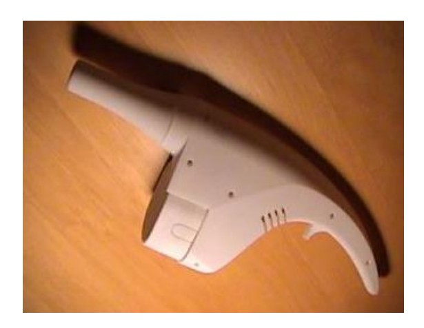
Figure 2 CAD modelling (left) leading to rapid prototype parts for proof of concept (right)

From a regional perspective, public money has been used to invest in expensive capital items. In some cases, the technology is well beyond the reach of our SME clients to afford. However, the