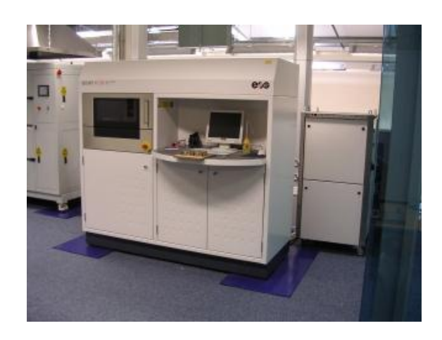
Figure 1 Rapid manufacturing facilities of the IPDC

The significant investments that have been made in "time compression technologies" e.g. computer-aided design (CAD), computer aided manufacture (CAM), and rapid prototyping, reflect a commitment to rapid product development practice (Figure 1). Through the IPDC the entrepreneurial SME can access the facilities to support their product development project at minimum risk to the company and zero investment on their part in the technology. For example, the development of CAD models of design concepts can quickly lead to prototype parts being made in the Centre's rapid manufacturing facility – these prototypes allow for an early evaluation of design concepts and enable the "proof of concept" stage to be delivered quickly and effectively (Figure 2).