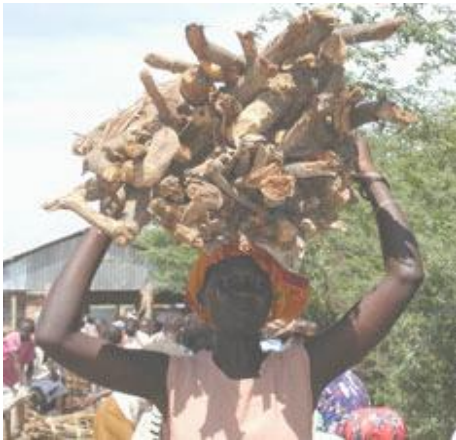
Figure 4. A picture taken by the UNHCR (2002) in Kakuma illustrates the pressure on the local resources by the refugees.

The fact is that the presence of refugees in this area brought about insurgency and a complex balance in the population's relationships; therefore the ill feeling came to a head among the refugees themselves; and between them and Turkana as well. Many respondents were in this camp for many years, and some actually grew up there.