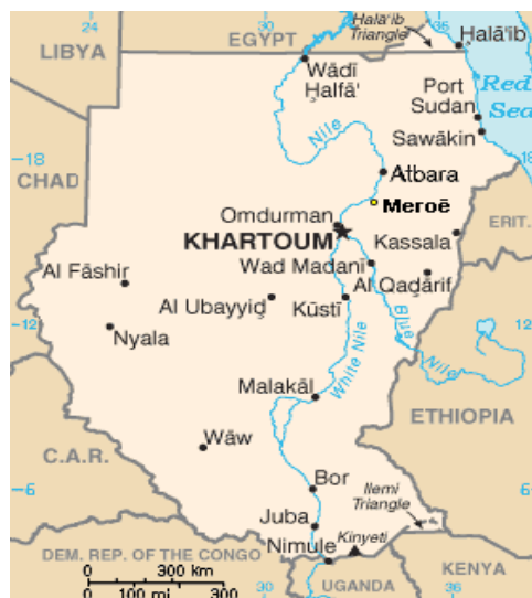
Figure 1. Map of Sudan

A collision of continental plates created the longest rift valley in the world, the Nile River, which runs from central Africa through Sudan to the Mediterranean Sea. The term Sudan means the land of black people and it is situated between the great Sahara in the north and Central Africa's Great Lakes region in the south, the Red Sea in the east and the Atlantic Ocean in the west.