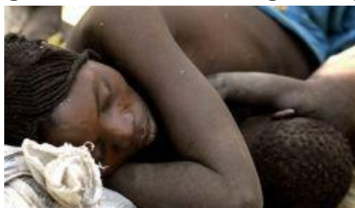
Figure 3. Photo Illustrating the Impact of Lack of Water and Food.

I cannot recall exactly what I was doing that time, but I heard sounds of people and big army trucks moving into town. I came inside our house and try to locate my wooden box where I kept my important things. It was like short notice for me. I had some money in my saving accounts with the Unity Bank, but I couldn't get it out it was already 3pm.