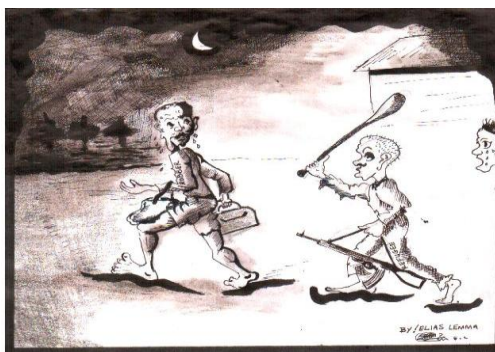
Figure 6. Illustration depicting safety fears in the refugee camp.

All respondents came to live in Kakuma, which is only 90 km from South Sudan. It was established in 1990, and sprawls over the desert of northern Kenya with a population over eighty six thousand refugees from nine different countries and dozens of different ethnic groups. Refugees are living in zones, groups, and sections based on ethnic and tribal lines.