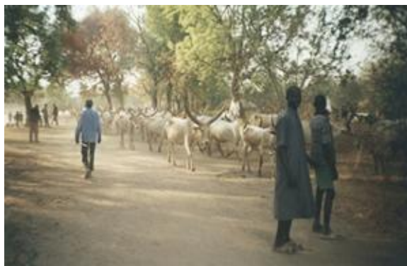
Figure 2. Photo illustrating the importance of land in the region

Ayoub (2006), in Land and Conflict in Sudan states that the most important resource in Sudan is the land, whether exploited for agriculture, cattle-herding or for its underground resources such as oil or water. Inevitably, land ownership has been the key to wealth and power struggles in Sudan. The political and religious conflicts combined have created long periods of instability in the country, resulting in food shortages and indiscriminately oppressing the Sudanese peoples for many decades; shortening life expectancy to 42.6 years and 43.5 years for men and for women respectively, according to the World Health Organisation (WHO) (WHO, 2000). "Since 1947 and for 38 years of its 52 years of independence, Sudan has