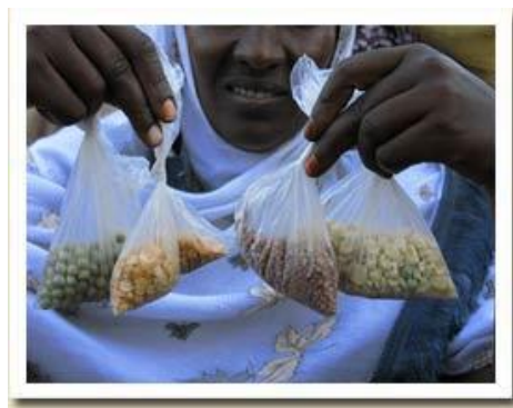
Figure 5. Photo illustrating the amount of food distributed fortnightly in Kakuma.

I still remember and feel bad when someone asked me about Kakuma. I had malaria for 4 days in the week leading to distribution. My 13 years old son came in the morning to tell me that I should go to get the food, but I could not because I was very sick. I asked my sister if she could help me get my ration, but she was not allowed to get it for me because the UNHCR officer told her that it has to be me not her. So I missed out in that distribution and again in the next distribution I was still feeling sick but I went to the UNHCR compound and told the officer that I cannot take my ration tomorrow because I am sick and I told him that my sister will come and take it for me. He said ok, ok, ok but when tomorrow came I sent my sister he changed his words saying he has never said like that... so I had no food again for 2 weeks.