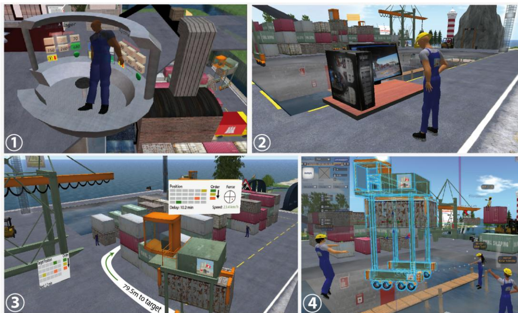
Figure 2: Multiple perspectives on the same scenario within the logistics component: 1) supply manager decides on order quantities to be ordered to the warehouse; 2) the controller on the container terminal receives the information and decides on shipment orders; 3) operations managers analyse the performance of the movements on the terminal; 4) engineers plan on improving equipment to increase performance (Burmester, Burmester, & Reiners, 2008; Reiners, 2010; Wriedt, Reiners, & Ebeling, 2008).