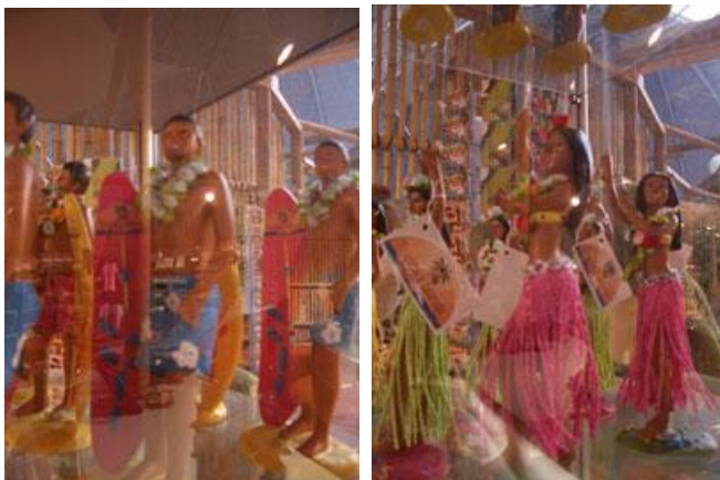
Dolls at souvenir shop, 2007