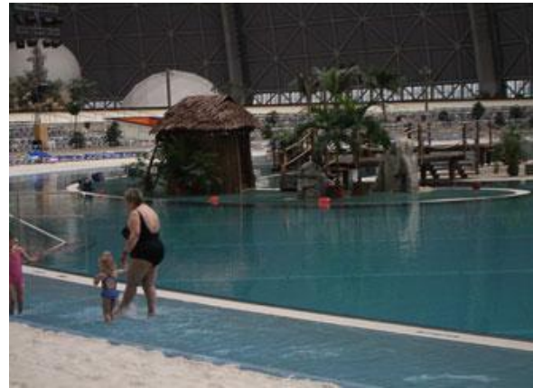
January 2006.

There may be potential in the virtuality of Tropical Islands Resort . While its aesthetics are unlikely to support a Rancièrian politics, there are persistent fissures and gaps in which imagination may develop. There have been, and probably still are, moments of translation which were not unilaterally determined by those whom we expect to tell us stories, and translate for us. According to Rancièr, "politics is an activity of reconfiguration of that which is given in the sensible" ("Dissenting Words" 115). Disturbance of the given can arise by the introduction of a supplement, or a lack, which may widen the "gap in the sensible" and raise questions about "who is qualified to see or say what is given" (124). Whether the mode of virtuality on site at the resort, or on the website, develops into simulation, or leaves open a space of possibility for both tillers of the soil and travelling journeymen, will depend on the presence of moments of rupture and engagement.