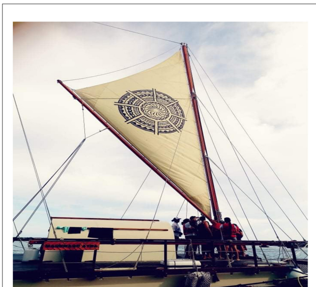
FIGURE 4 Photograph of the traditional seagoing canoe taken by an indigenous youth participant in Rarotonga, Cook Islands.