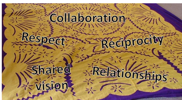
FIGURE 2 The five Cook Islands values in Maua-Hodges tivaevae model (Hunter et al., 2015).