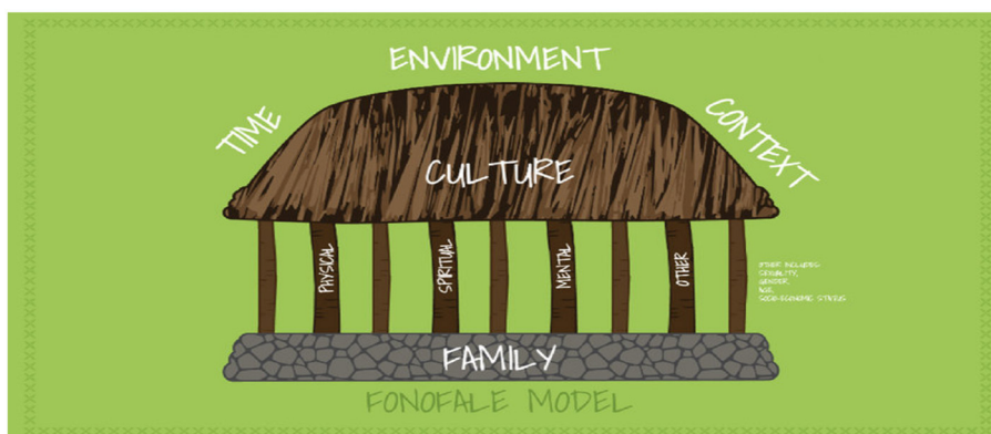
FIGURE 1 The Fonofale model of health (Pulotu-Endeman, 2001).