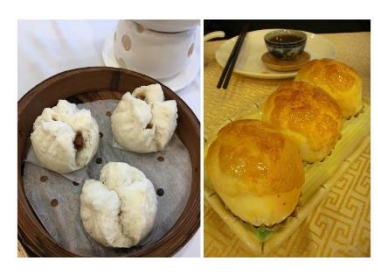
Figure 23(a). Steamed wholemeal cha siu baau (left) and baked cha siu baau (right).