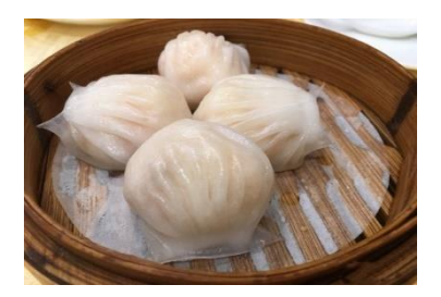
Figure 2(h). Har gow.