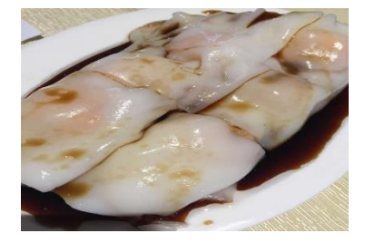
Figure 9(e). Cheung fan.