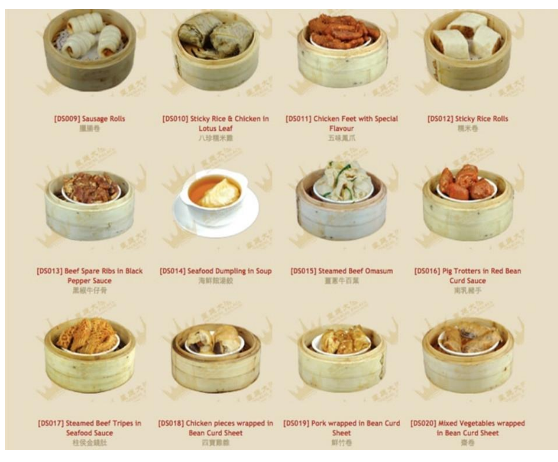
Figure 26(e). Menu of Imperial Palace.