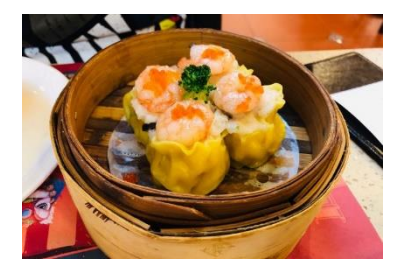
Figure 5(c). Siu mai decorated with broccoli.