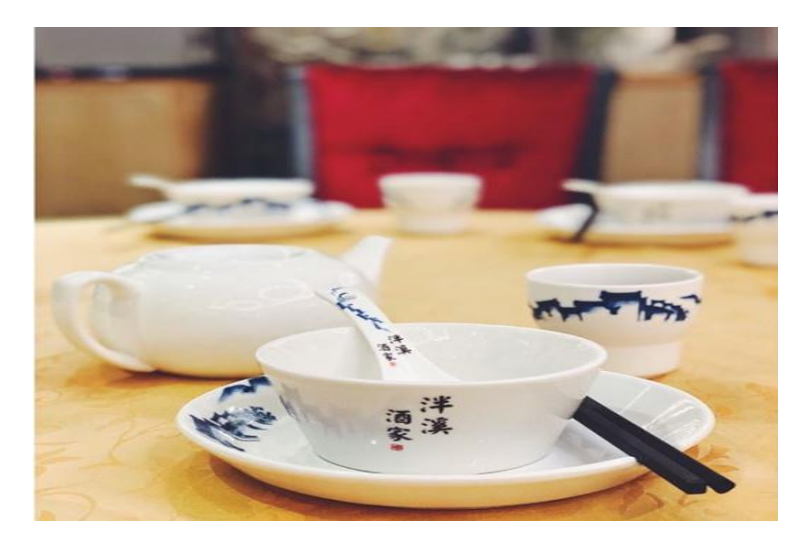
Figure 29(b). Cutlery of Panxi Restaurant.