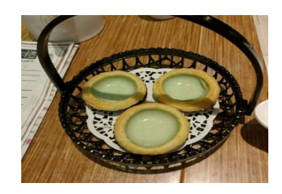
Figure 20(i). Matcha daahn taat.