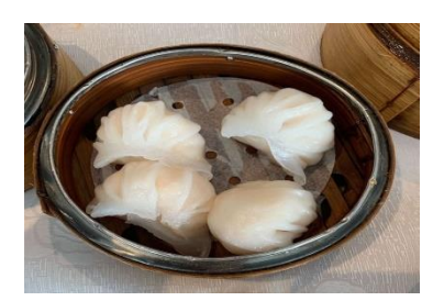
Figure 3(g). Har gow.