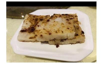
Figure 15(j). Loh baahk gou .