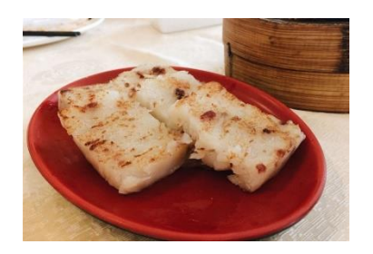
Figure 15(a). Loh baahk gou.