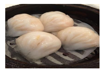
Figure 3(i). Har gow.