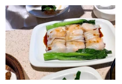
Figure 8(e). Cheung fan.