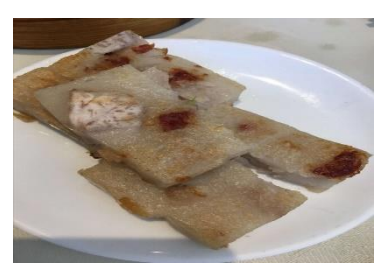
Figure 15(c). Loh baahk gou.