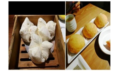
Figure 23(f). Steamed cha siu baau (left) and baked cha siu baau (right).