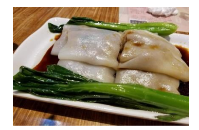
Figure 8(i). Cheung fan .