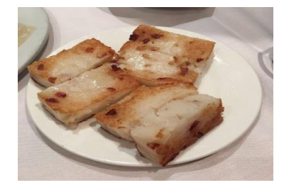
Figure 15(d). Loh baahk gou.