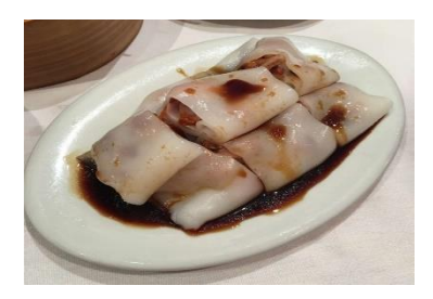
Figure 9(d). Cheung fan.