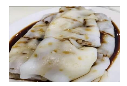
Figure 9(c). Cheung fan.