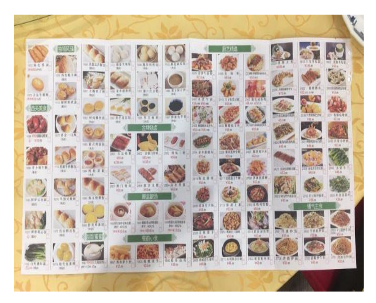
Figure 25(b). Menu of Panxi Restaurant. Source: Panxi Restaurant (Dian Ping-Guangzhou).