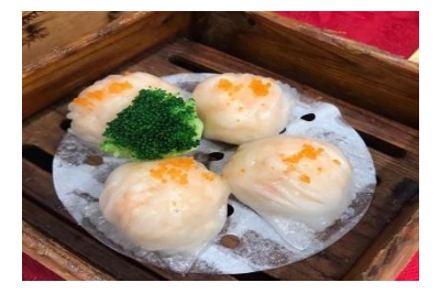
Figure 2(k). Har gow decorated with fish roe.