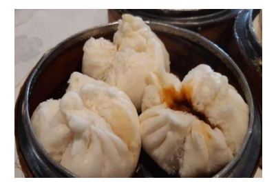
Figure 24(f). Cha siu baau.