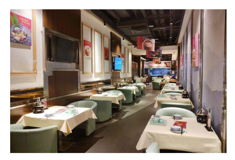
Figure 30(a). Interior Chun Zai.