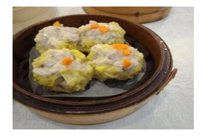
Figure 6(h). Siu mai.