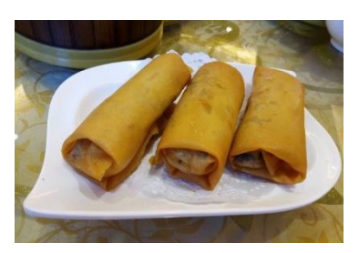
Figure 11(b). Cheun gyun.