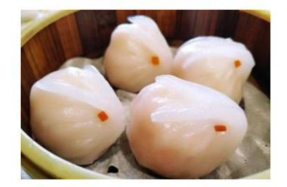
Figure 2(b). Rabbit-shaped har gow .