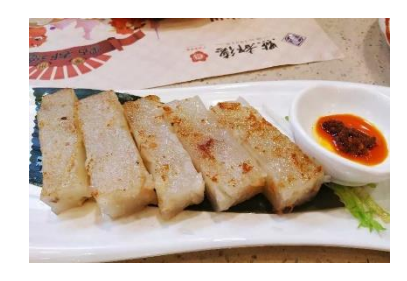
Figure 14(c). Loh baahk gou .