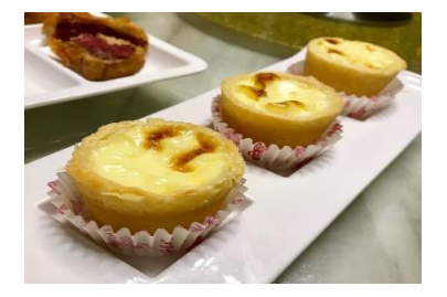
Figure 20(d). Daahn taat .