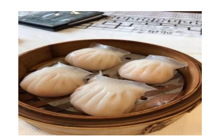
Figure 2(1). Har gow .