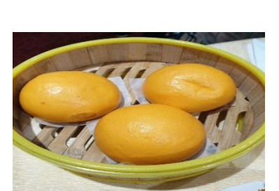
Figure 18(f). Liu sha baau .