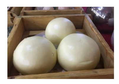
Figure 17(k). Liu sha baau .

Data not available on Dian Ping. Chun Zai.