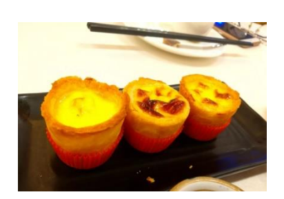
Figure 20(h). Daahn taat .