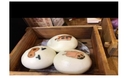
Figure 17(f). Liu sha baau with cartoon images on surface.