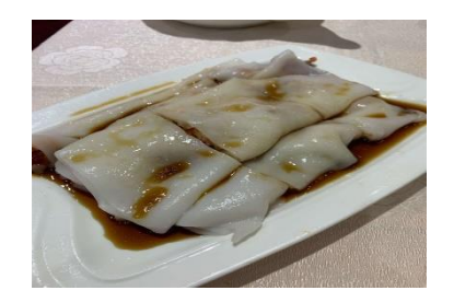
Figure 9(h). Cheung fan.