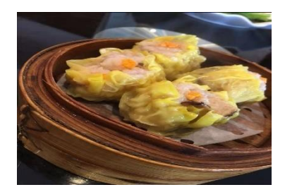
Figure 6(c). Siu mai.