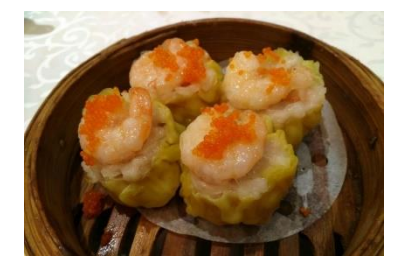
Figure 5(d). Siu mai .