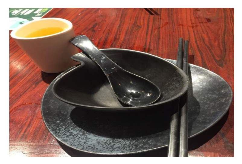
Figure 30(b). Cutlery of Chun Zai.