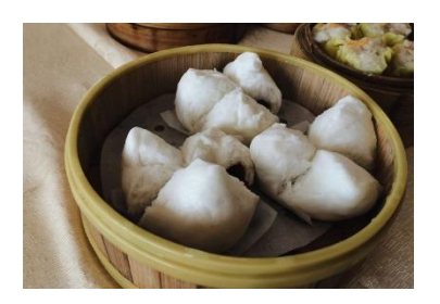
Figure 24(a). Cha siu baau .