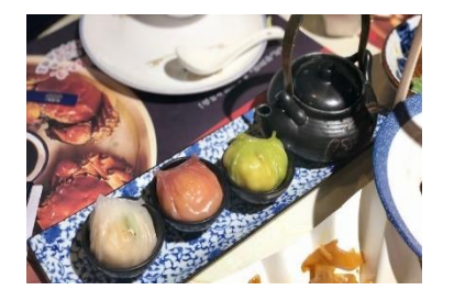
Figure 2(j). Colourful har gow soaked in stock.