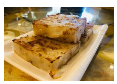
Figure 14(b). Loh baahk gou .