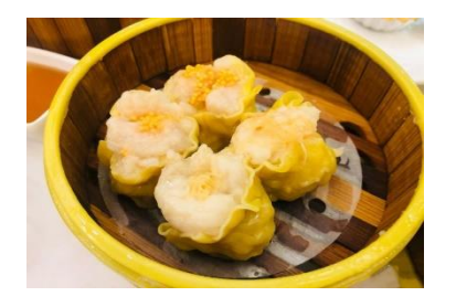
Figure 5(a). Siu mai.