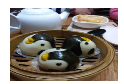
Figure 17(i). Penguin-shaped liu sha baau.