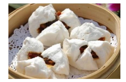
Figure 23(g). Cha siu baau .