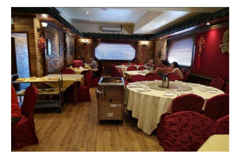
Figure 28. Interior of Hees Garden Seafood Restaurant. Source: Hees Garden Seafood Restaurant Seafood Restaurant (Zomato-Auckland, New Zealand).