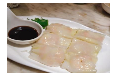
Figure 8(d). Cheung fan.