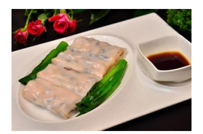
Figure 8(g). Cheung fan.