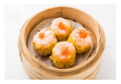
Figure 4. Traditional siu mai .

After har gow, siu mai is another classic dim sum item (Qu, 2016). The history of siu mai dates back to the Yuan Dynasty (1271-1368), originating in the North of China (Ni, 2012). Different from Northern siu mai , which has a white appearance and flower shape, traditional Cantonese siu mai (Figure 4) has a yellow colour and a cylindrical shape. The wrapper of Cantonese siu mai is made from egg dough which gives it a yellow appearance. The wrapper of Cantonese siu mai is a critical testament to the skills of the cook. If the wrapper is too thin, it will break and ruin the appearance of the dish, whereas if the wrapper is too thick, it will be tough and detract from the texture (Qu, 2016).