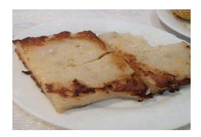
Figure 15(i). Loh baahk gou . Source: HKD Chinese Seafood Restaurant (Zomato-Auckland, New Zealand).