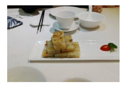
Figure 14(a). Loh baahk gou.