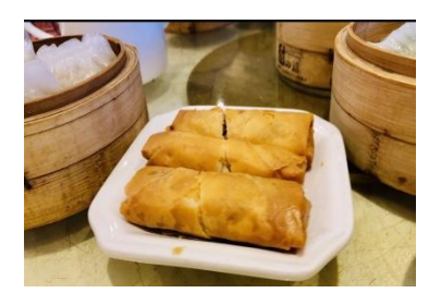
Figure 12(g). Cheun gyun.