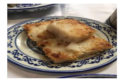
Figure 15(f). Loh baahk gou .