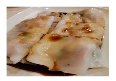
Figure 9(a). Cheung fan.