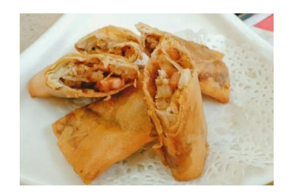
Figure 11(c). Cheun gyun.