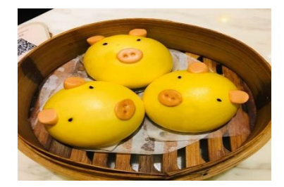
Figure 17(d). Piglet-shaped liu sha baau .