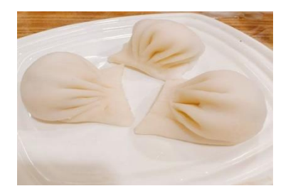
Figure 2(g). Cold har gow wrapped in glutenous rice dough.