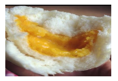
Figure 18(c). Liu sha baau.

Data not available Zomato. Canton Flavor.