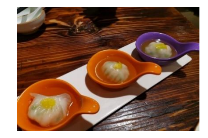
Figure 2(f). Colourful har gow soaked in stock.