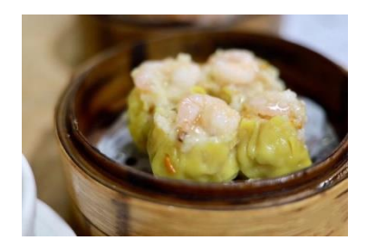
Figure 5(g). Cordyceps Militaris siu mai.