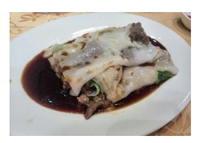
Figure 8(b). Cheung fan.