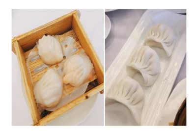
Figure 2(a). Har gow (left) and cold har gow (right).