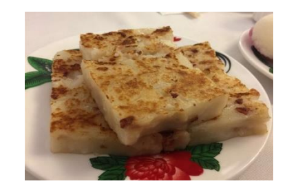
Figure 15(1). Loh baahk gou. Source: Lucky Star Chinese Restaurant (Zomato-Auckland, New Zealand).