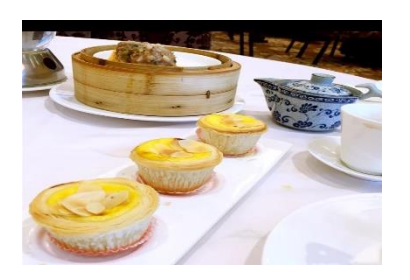
Figure 20(a). Daahn taat topped with roasted sliced almonds.