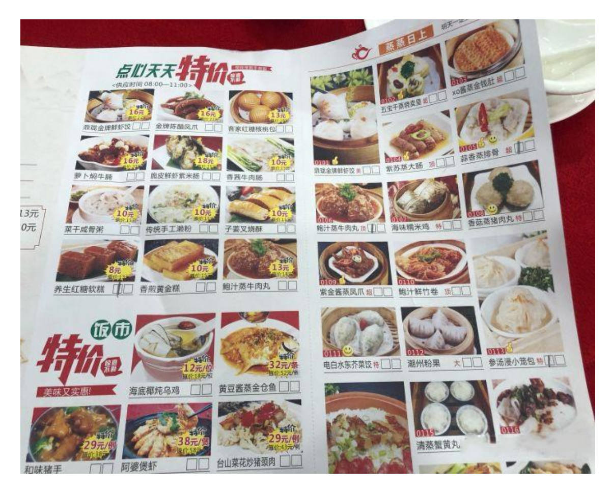
Figure 25(k). Menu of Ding Long Dian Xin Zai.