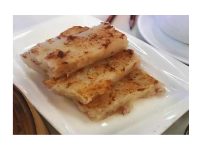
Figure 14(h). Pan-fried loh baahk gou .