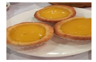
Figure 21(d). Daahn taat.