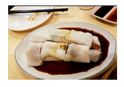
Figure 9(j). Cheung fan.