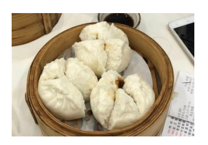
Figure 23(h). Cha siu baau .