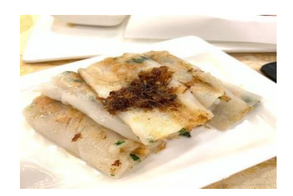
Figure 8(h). Pan-fried cheung fan.