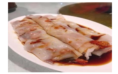
Figure 9(f). Cheung fan.