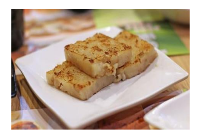
Figure 13. Traditional loh baahk gou .

Loh baahk gou is one of the favourite dishes "among locals of all ages" (Qu, 2016, p. 35). Although loh baahk gou is usually labelled as turnip cake in English, traditional loh baahk gou , as seen in Figure 13, is actually made with fresh grated Chinese radish, fried and diced Chinese sausage or cured meat, shrimp, and shiitake mushroom, and then mixed with rice flour, and steamed into cakes (Qu, 2016). After cooking, loh baahk gou is cut into rectangular pieces and then pan-fried until a brown crispy crust has formed so that it tastes soft inside and crispy outside. In the Chaozhou region of Guangzhou, loh baahk gou is a popular New Year dish which can be found everywhere across the region during the Chinese New Year. Cooked loh Baahk gou can be either eaten directly or with soy sauce (Mo, 2009).