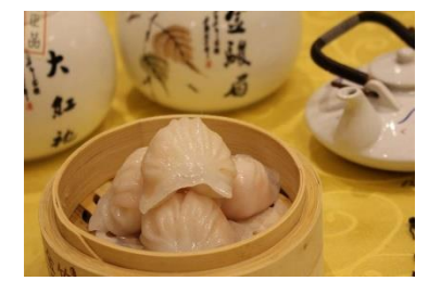
Figure 3(j). Har gow.