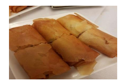
Figure 12(h). Cheun gyun.