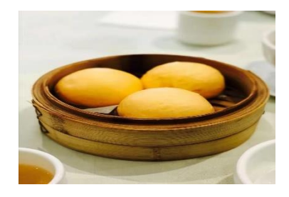
Figure 18(b). Liu sha baau .