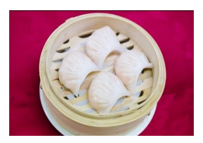
Figure 3(c). Har gow .