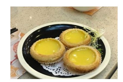
Figure 20(c). Daahn taat .