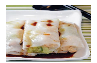
Figure 7. Traditional cheung fan with soy dressing.

"Cheung fan means 'intestine' and fan refers to 'rice noodle'. The name cheung fan came from the shape of the roll since the rice sheet is wrapped into a roll like the intestine of a pig" (Wah, 2011, p. 159). The rice roll of cheung fan is made from rice flour; sometimes chestnut flour, wheat starch, corn starch or potato starch can also be added (Mo, 2009). The perfect cooked cheung fan should be "thin, chewy, smooth and had [has] a special flavour" (Wah, 2011, p. 161). Cheung fan can be filled or unfilled. The most classic fillings for cheung fan are shrimp, pork, and beef (Wah, 2011). Traditional cheung fan (Figure 7) is served with soy sauce which can be either a dipping sauce or a dressing (Mo, 2009).