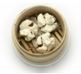
Figure 22. Traditional cha siu baau .

Cha siu baau is one of the most representative buns in dim sum . The filling of cha siu baau is made from small pieces of barbecued pork with a specific ratio of lean meat and fat, and is flavoured with oyster sauce and seasonings. The fluffy bun is made from leavened dough (Qu, 2016). The most significant difference between cha siu baau and other buns is that cha siu baau should be cracked open on top once cooked. A good cha siu baau should be snow white and evenly cracked into three segments to expose the filling (as shown in Figure 22).