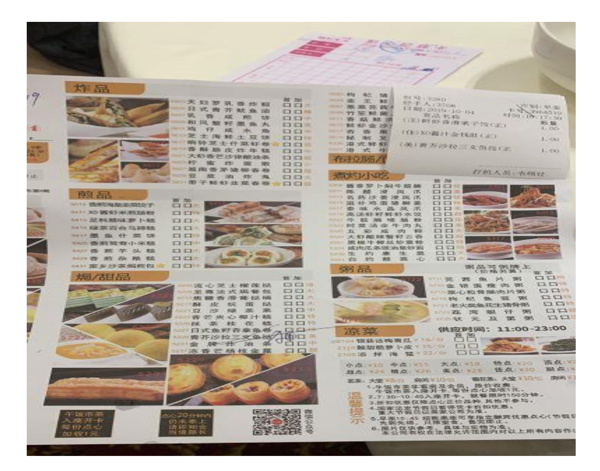
Figure 25(h). Menu of Yin Deng Shi Fu.