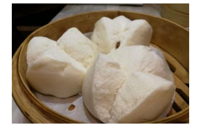
Figure 23(d). Cha siu baau.