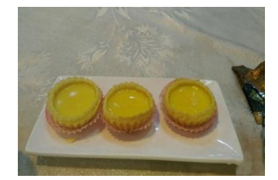
Figure 20(g). Daahn taat .