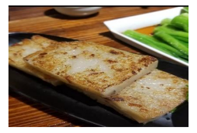
Figure 14(f). Loh baahk gou .