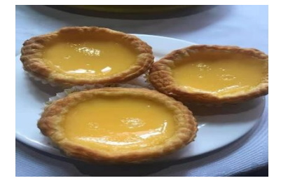
Figure 21(f). Daahn taat.