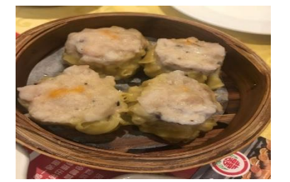
Figure 6(i). Siu mai .