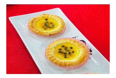
Figure 20(k). Passionfruit daahn taat .