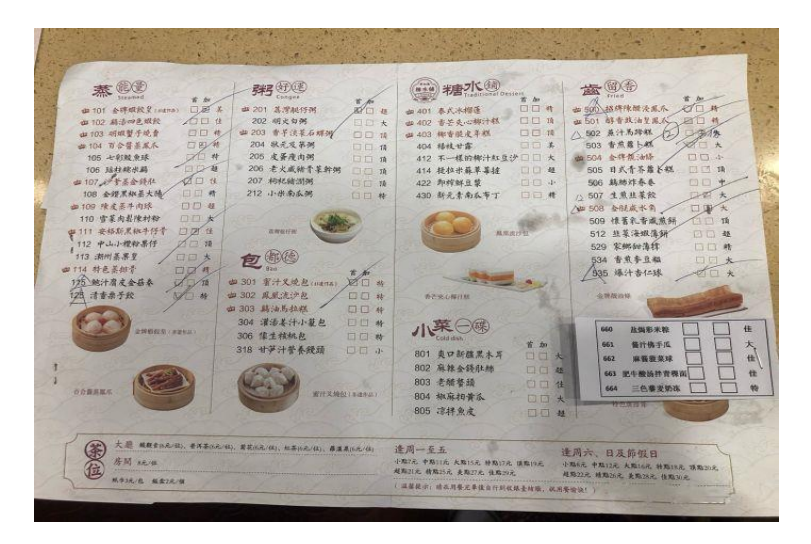
Figure 32. Dim Sum menu is also an ordering sheet.