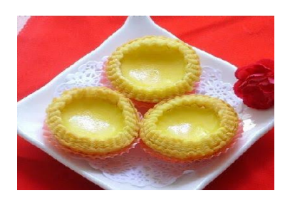
Figure 19. Traditional daahn taat .

As Guangzhou is a port city, its cuisine has been significantly influenced by other countries during cultural exchanges (Klein, 2007). Daahn taat is "a representative of Western influence" (Qu, 2016, p. 35). The invention of daahn taat is said to have been originally inspired in colonial history by the British egg tart and the Portuguese egg tart (C. Chan, 2011; Mo, 2009). Daahn taat's first recorded appearance was in the banquet "Manchu-Han Imperial Feast", one of the most luxury feasts in Chinese recorded history, for Emperor Kangxi, the fourth Emperor of the Qing dynasty. In the banquet, daahn taat was featured as one of the "Thirty-two Delicacies" (C. Chan, 2011, p. 78). Traditional daahn taat (Figure 19) is baked in a round pastry mould filled with egg custard, which is a mixture of egg, milk and sugar (Qu, 2016).