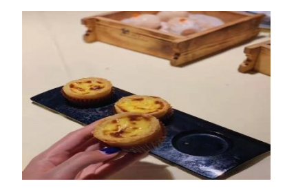
Figure 20(1). Daahn taat.