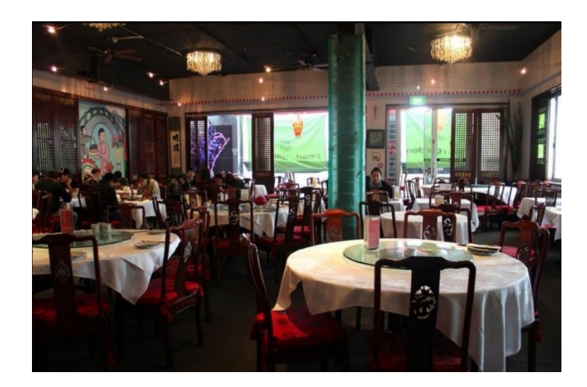
Figure 27. Interior of Pearl Garden.