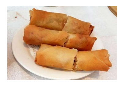
Figure 12(e). Cheun gyun.