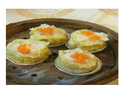
Figure 5(h). Siu mai .