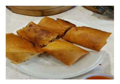
Figure 12(f). Cheun gyun.