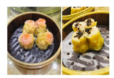
Figure 5(b). Siu mai (left) and siu mai topped with black truffle (right).