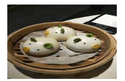
Figure 17(j). Piglet-shaped liu sha baau.