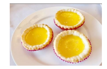
Figure 21(l). Daahn taat.