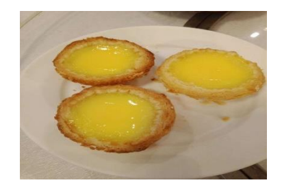
Figure 21(i). Daahn taat.