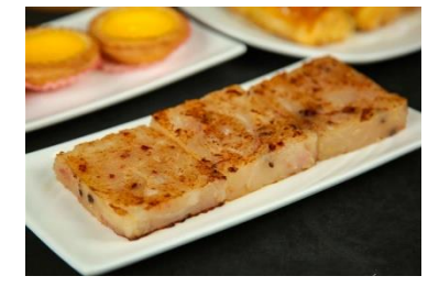
Figure 14(g). Loh baahk gou.