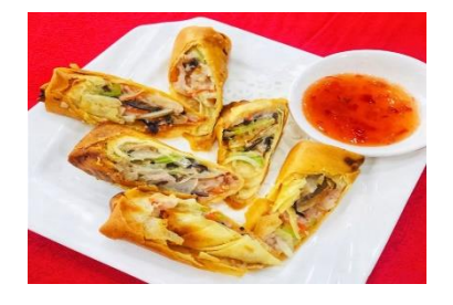
Figure 11(k). Cheese cheun gyun served with sweet sauce.