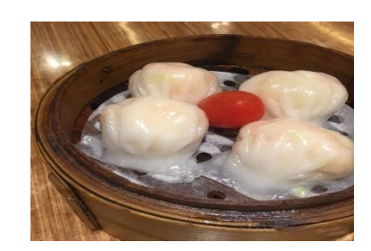
Figure 2(i). Har gow.