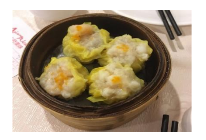
Figure 6(a). Siu mai .