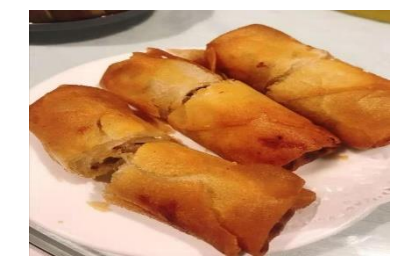
Figure 12(d). Cheun gyun .