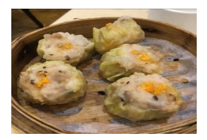
Figure 6(j). Siu mai.