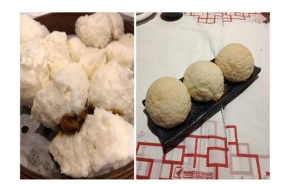
Figure 23(l). Steamed cha siu baau (left) and baked cha siu baau (right).