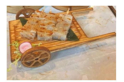
Figure 14(j). Loh baahk gou s kewers.