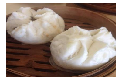
Figure 24(h). Cha siu baau.