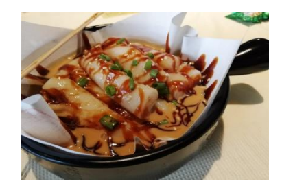
Figure 8(k). Cheung fan dressed with barbecue sauce and tomato sauce.