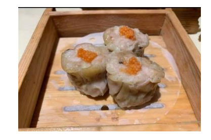
Figure 5(1). Siu mai.