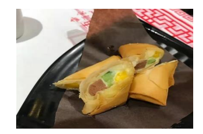
Figure 11(1). Lemongrass foie gras cheun gyun.