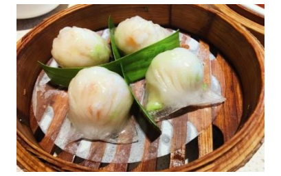
Figure 2(e). Har gow .