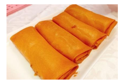
Figure 11(d). Cheun gyun.