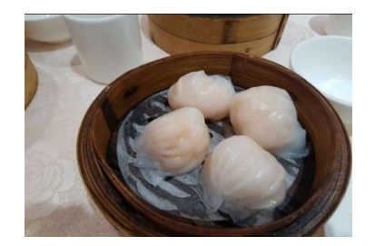
Figure 3(h). Har gow.