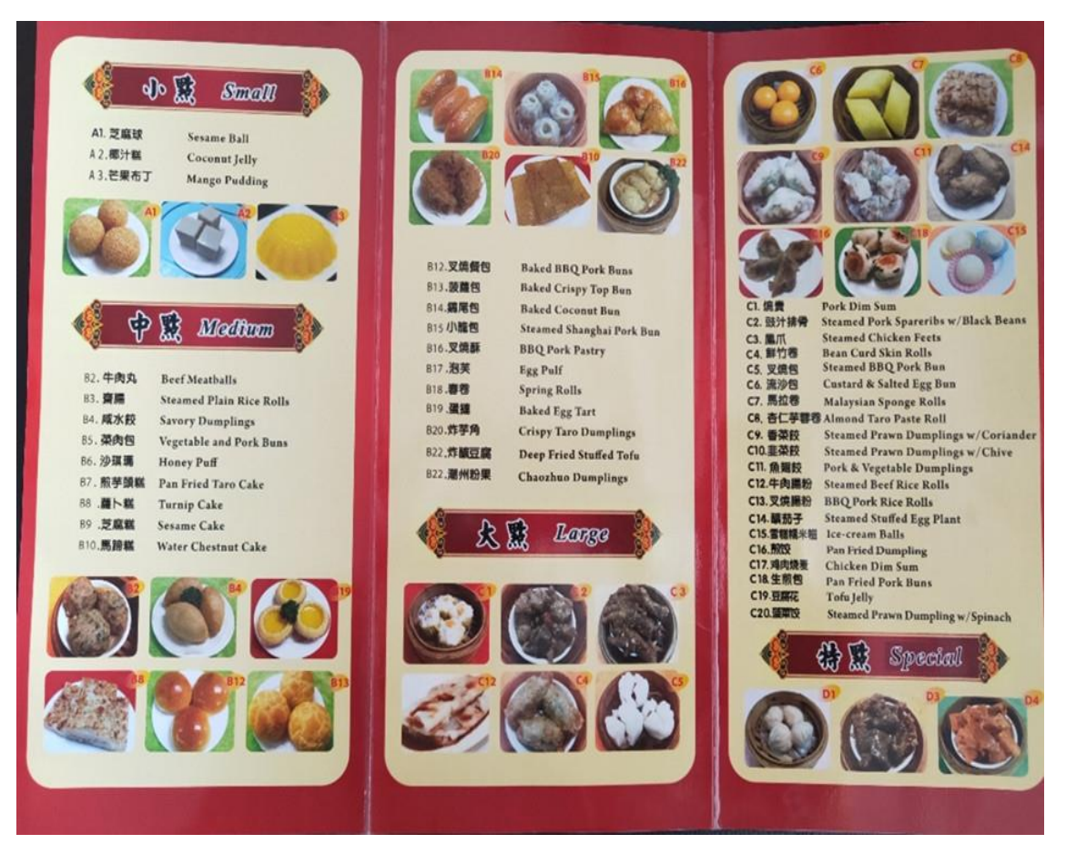
Figure 26(c). Menu of Lucky Fortune Restaurant.