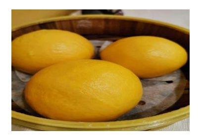
Figure 18(a). Liu sha baau .

Data not available Zomato. Canton Flavor.