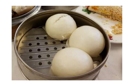
Figure 18(h). Liu sha baau.