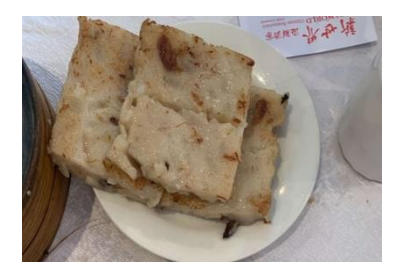
Figure 15(g). Loh baahk gou.