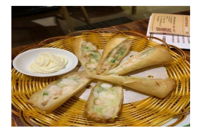
Figure 11(f). Cheun gyun with aioli sauce.