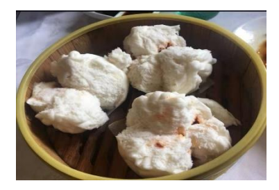
Figure 24(e). Cha siu baau .