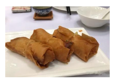
Figure 11(a). Cheun gyun.