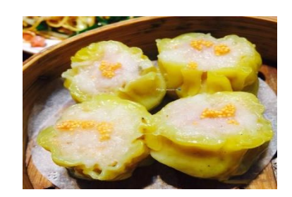
Figure 5(i). Siu mai. Source: Shang Lou Cha Dian (Dian Ping-Guangzhou).