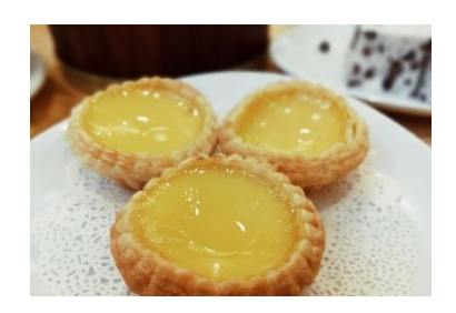
Figure 20(b). Daahn taat .