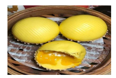
Figure 17(c). Liu sha baau coloured with pumpkin.