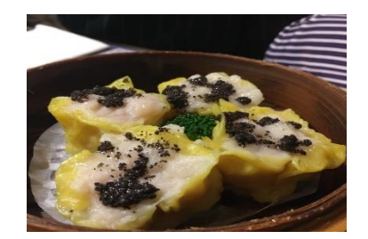
Figure 5(j). Black truffle s iu mai