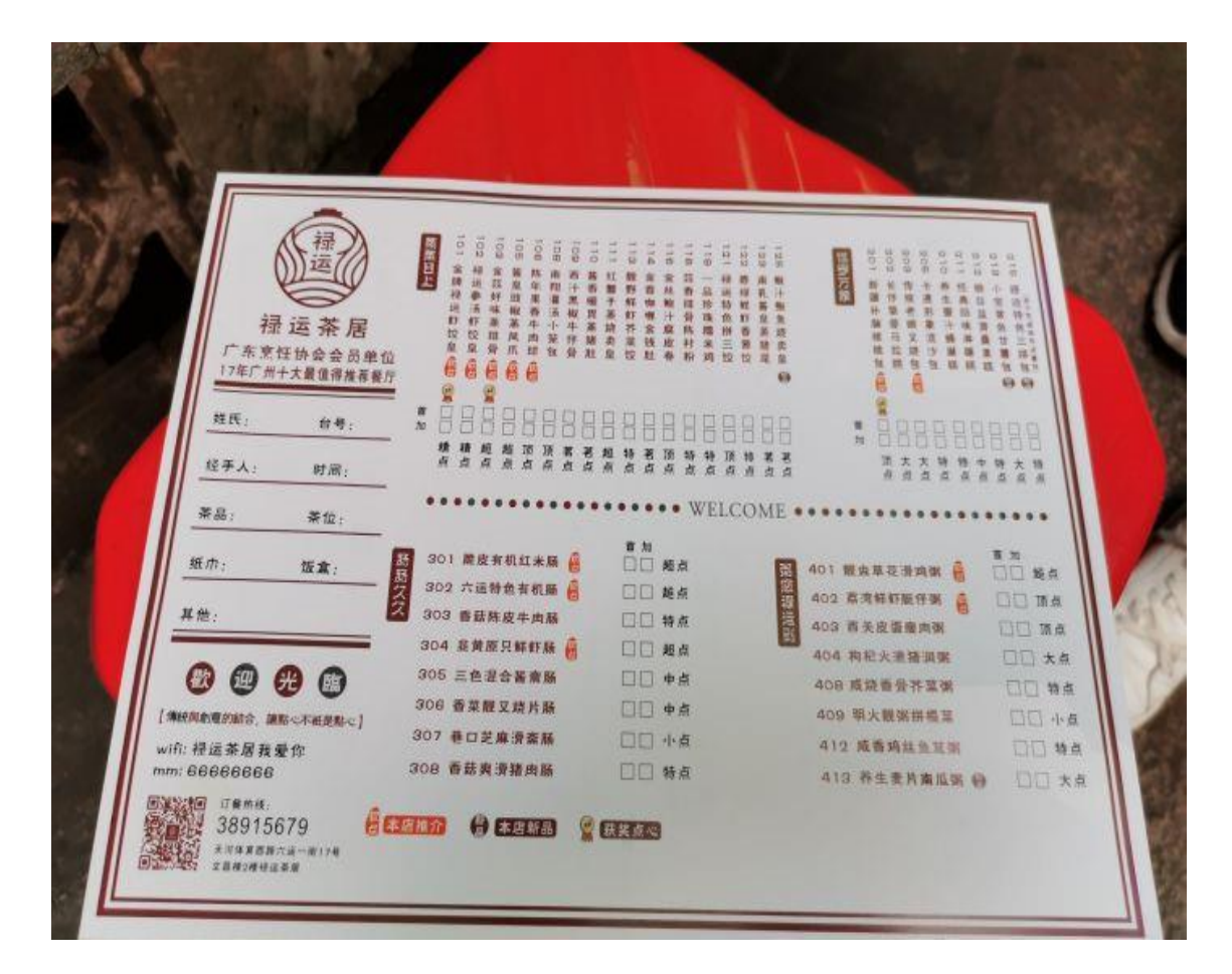
Figure 25(g). Menu of Lu Yun Cha Ju.