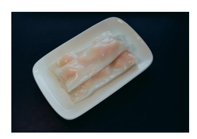
Figure 9(b). Cheung fan.