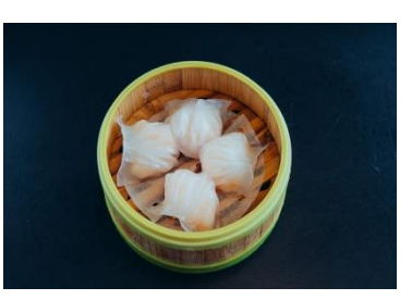
Figure 3(b). Har gow .