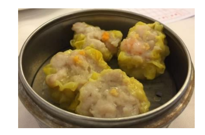
Figure 6(k). Siu mai .