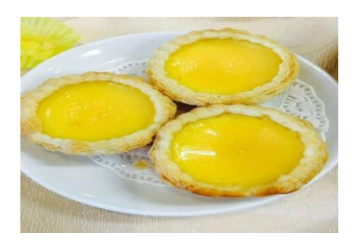
Figure 21(a). Daahn taat.