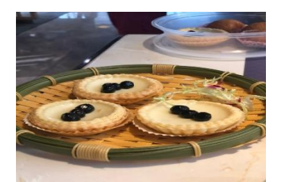
Figure 20(j). Daahn taat topped with tapioca pearls.