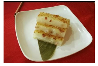
Figure 14(k). Loh baahk gou .