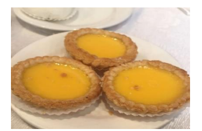
Figure 21(g). Daahn taat.