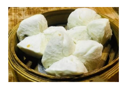
Figure 23(i). Wholemeal cha siu baau .