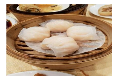
Figure 3(k). Har gow.