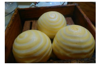
Figure 17(e). Colourful liu sha baau .