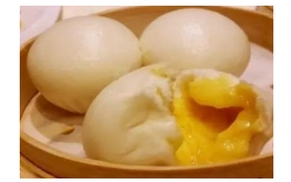
Figure 17(g). Liu sha baau.