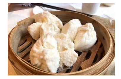
Figure 23(b). Cha siu baau .