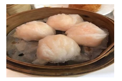
Figure 3(d). Har gow.