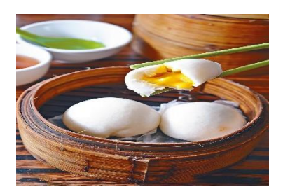
Figure 16. Traditional liu sha baau .

Steamed buns are one of the most famous wheat-based products in Chinese cuisine. Steamed buns can be either filled or unfilled. The fillings for filled buns consist of meat, vegetables, or sweet ingredients. Traditional Chinese steamed buns are usually round in shape and a white colour with a soft skin (Keeratipibu & Luangsaku, 2012). Liu sha baau or steamed egg custard bun is a unique Cantonese food which is commonly found in yum cha . Different from other sweet buns, the most distinctive feature of liu sha baau is its "semi-liquid filling made from egg yolk, pork oil and condensed milk" (Qu, 2016, p. 35). Good liu sha baau (Figure 16) should have the golden sand flowing out when tearing the bun. The taste of liu sha baau is between salty and sweet (Qu, 2016). The dough of liu sha baau is traditionally white but is often coloured with carrot juice in contemporary society to create an orange appearance.