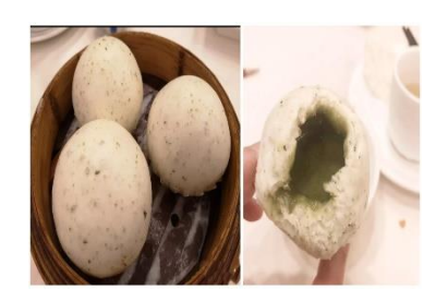
Figure 17(h). Matcha liu sha baau .