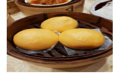
Figure 18(g). Liu sha baau .