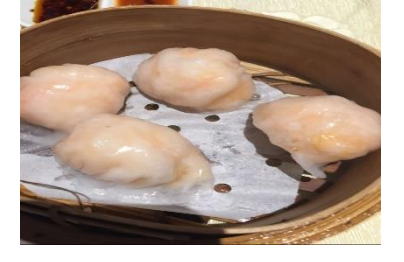
Figure 3(e). Har gow .