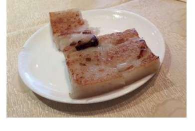
Figure 15(e). Loh baahk gou.