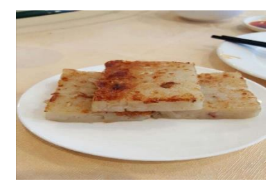
Figure 15(k). Loh baahk gou.