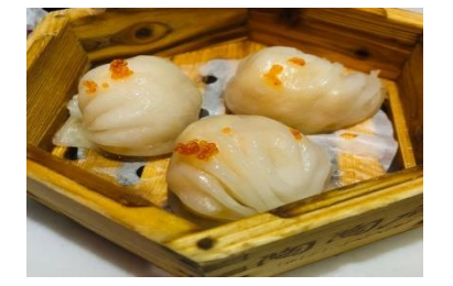
Figure 2(d). Har gow topped with fish roe.