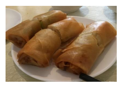
Data available.Figure 12(c). Cheun gyun.Source: Dragon Boat (Zomato-<br/>Auckland, New Zealand).Source: Enjoy Inn Chinese Restaurant<br/>(Zomato-Auckland, New Zealand).