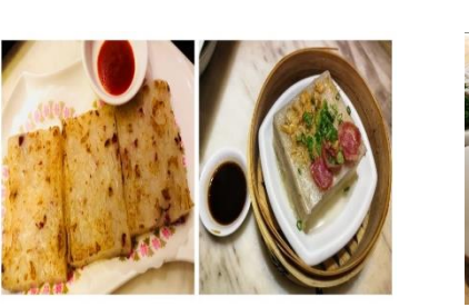
Figure 14(d). Normal loh baahk gou (left) and loh baahk gou served as a whole (right)