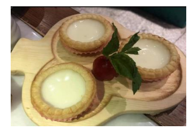
Figure 20(f). Daahn taat .