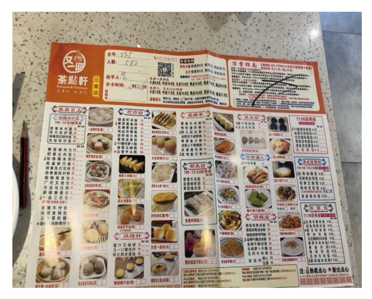
Figure 25(f). Menu of You Yi Jian Cha Dian Xuan.