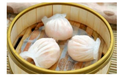
Figure 1. Traditional har gow .

Har gow is one of the most iconic Dim Dum dishes in yum cha , which is considered to be one of "big four" ( har gow, siu mai, cha siu baau, and daahn taat ) of dim sum (Mo, 2009). Har gow was invented in the 1920s in a teahouse in Wu Feng village, a suburb of Guangzhou. To adjust to the local conditions, the owner of the teahouse purchased shrimps directly from fishermen' boats. The owner mixed the shrimps with pork fat and bamboo shoots and then wrapped them into dumpling dough, creating the steamed shrimp dumplings, which are called har gow today (Qu, 2016). Traditional har gow , as revealed in Figure 1, has a one-bite size, a half-moon shape and at least twelve pleats on the skin (Mak, Lumbers, & Eves, 2012). The wrapper of har gow is made from wheat starch so that it becomes translucent when cooked (Qu, 2016). Traditionally, har gow is served as four pieces in a hot bamboo steamer (Mo, 2009).