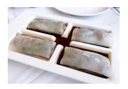
Figure 8(a). Cheung fan.