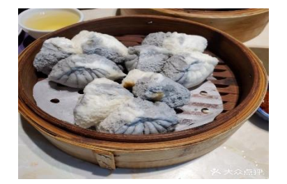
Figure 23(j). Cha siu baau coloured with brown sugar