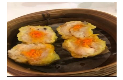
Figure 6(d). Siu mai .