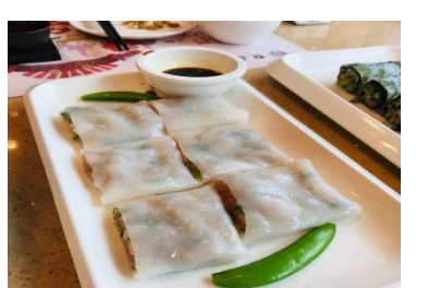
Figure 8(c). Cheung fan.