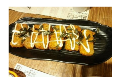
Figure 14(i). Crumbed wasabi loh baahk gou.