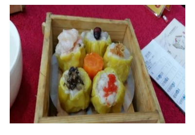
Figure 5(k). Five types of siu mai .