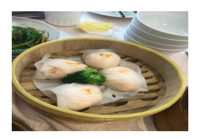
Figure 3(a). Har gow .