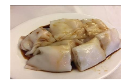
Figure 9(k). Cheung fan.