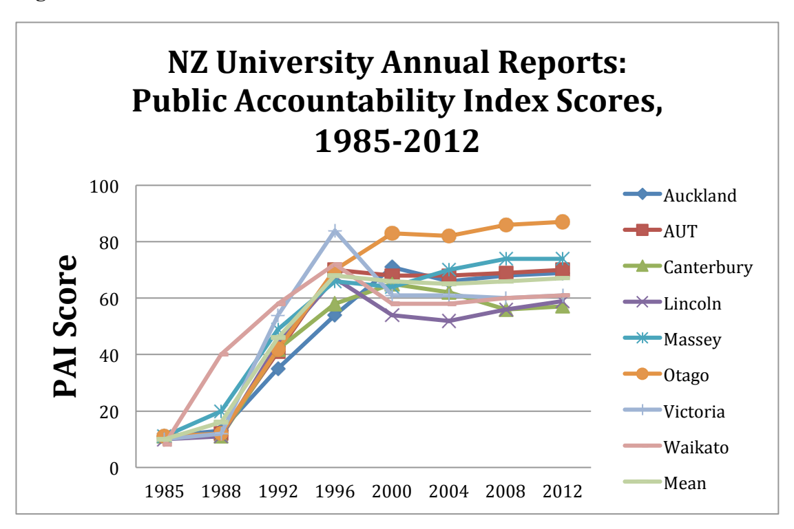
Figure 6.1 trends for overall PAI from 1985 to 2012

instead of just financial statements. More components are added into annual reports, such as the vice chancellor's report, and the service report on performance, research and community. More information is available for the public that allows prediction on the future movement of the university. The availability of both a statement of intent and annual reports allows the public to track whether universities have done what they promised, or intended, to do. The third level (top level) coincides with reports with PAI over 80. This level reflects a high level of disclosure from the public perspective. Victoria University was given 84 in1996 as overall PAI, and Otago maintains a high quality of annual reports after 2000.