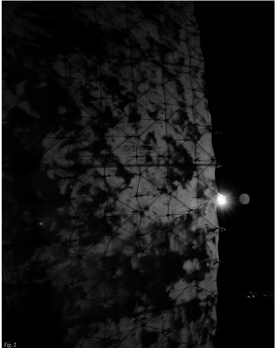
Fig. 2: CitySail.

interactions with the environment, so that everything we produce or construct increases ecological and cultural richness. Could sustainability be re-imagined in terms of the delight of touch rather than the guilt of contamination?