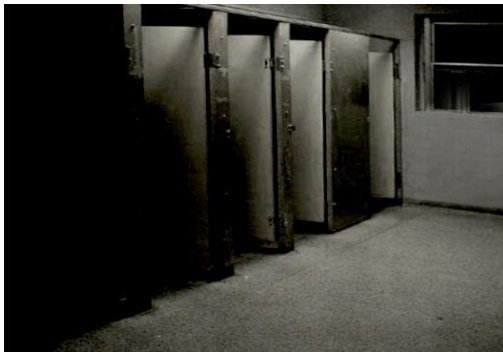
Figure 4: Reach-under bogs in Tauranga circa 1968.

If Governor General Lord Cobham was not prepared to support men's desire to engage in same sex activity, then the design a popular form of public toilet updated in this year was. With the change to decimal coinage in 1967, penny operated locks were removed from the doors of many large civic lavatories. In structures like Hamilton's Garden Place bogs , adjacent cubicles situated in long rows had, up until this time been known as ' reach unders '. 44