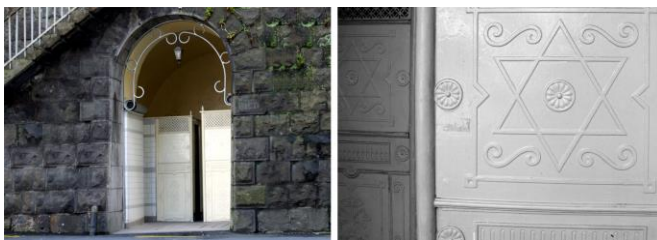
Figure 3: Cast iron screens at the entrance to The Star of David. Durham Street West. Auckland 1880.

Another of New Zealand's first underground ' grottos ' still operates in Durham Street West in Auckland. Faced with a bluestone wall and built in 1880, it sits underneath the oldest piece of road construction in the central city. This bog called in code The Star of David or The Jewish Grotto was named in reference to large cast iron screens that feature a Star of David motif at its entrance. These screens protected men using the toilets from public view and were designed at the time to ' satisfy standards of social and visual decency. ' (Yoffes & Mace, 2005, p. 52).