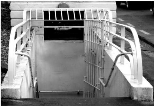
Figure 2: Underground toilets Wellesley St. Auckland circa 1910.

Underground bogs, because of their heightened levels of privacy and positioning of urinals in full view of cubicle doors, meant that discrete contact could easily be made between men using them for initiating sexual encounters. The doors on these stalls were lockable and in general there was ample space inside individual cubicles for men to have sex. However, the buildings were still public and if sex was to occur outside of a cubicle, systems of surveillance had to be instituted. Accordingly, at this time a behaviour called ' pegging ' 13 came to describe a 'lookout' or man who watched the stairway entrance leading down to a bog. A pegger was able to warn others engaging in sex at the urinals of the imminent approach of a stranger.