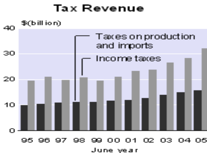
Figure2. Revenue from taxation 10

Although there are still some work need to be done for the tax system, the Tax review 2001 concluded that New Zealand's current tax mix is broadly right. By having two main tax bases, overall revenue flows are relatively stable, even where one or other tax base fluctuates. 11