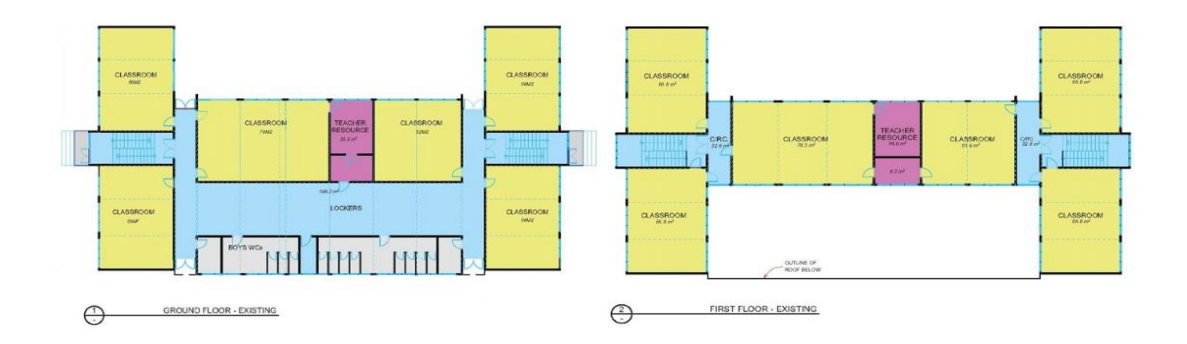
Fig 2a & 2b. Photograph of a floor plan for Nelson Block Learning environment.<sup>2</sup>

In 1980, two new common design plans were introduced: the Whānau plan³ used at Macleans College, and the Leeston plan used at Ellesmere College. Simultaneously, however, student numbers plateaued and secondary school construction dwindled, resulting in common design plans being dropped in 1982 in favour of schools being individually designed. By 1980, there were 265 secondary schools and 35 district high schools, with technical high schools having been completely phased out. In 1989, the school leaving age was raised to the present age of 16. In 1989, the Tomorrow's Schools reform enabled individual school communities through their elected Boards of Trustees to make decisions about managing the learning programmes and school environment. These moves require parent communities to remain abreast of educational theories underpinning new policy decisions associated with educational changes, with obvious implications for the implementation of the Ministry of Education property strategy (Swarbrick, 2012).