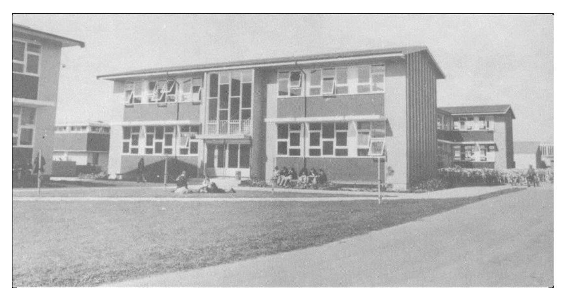
Fig 1. Photograph of a Nelson Block Learning environment.

In 1960, the Nelson plan (named for the city in which it was designed) created two-storey H-shaped timber buildings containing 12 classrooms, (Swarbrick, 2012). The design lasted a decade, with the Nelson classroom block going on to become the most numerous typology of classroom block found in New Zealand secondary schools. In 1971, the Nelson plan was replaced with the S68 plan (after the 1968 prototype at Porirua College), which featured single-storey classroom blocks of concrete block construction, with low pitched roofs, and internal open courtyards.