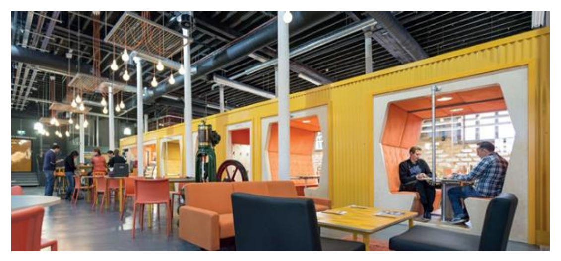
Fig 5: Often architects borrow ideas from commercial projects. This is a modern commercial space that reflects a blend of warehouse/café style.6

The images shown in Figures 5 - 8 are examples of four new learning environments. They have similar spatial stratifications but support very different kinds of programmes. There is an ambiguity about all of these spaces, and even though they are designed as school spaces, their very different programmatic engagements could suggest office space, retail space, airport space, or hospital space. They occupy a very similar kind of spatial sequencing that is, each is an open, flexible, changeable type of space.