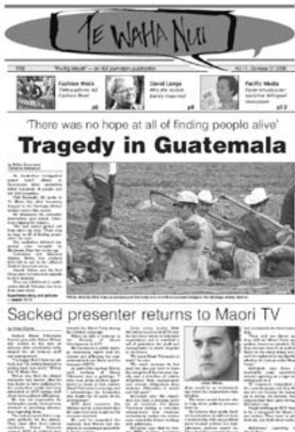
Figure 3: Te Waha Nui , issue No 11, October 21, 2005.

This means some inappropriate outlets have to be used and there has also been a reduction in the number of published stories overall. Another adverse factor is a growing need for the students to devote much of their out-of-class time to paid employment, allowing less time and a reduced motivation to write news stories for publication. (p. 3)