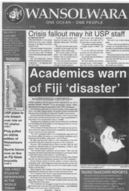
Figure 2: The Speight coup edition of Wansolwara , issue 5(2), June 2000.

(Headlines from the Wansolwara edition of September 2001 covering that year's general election).