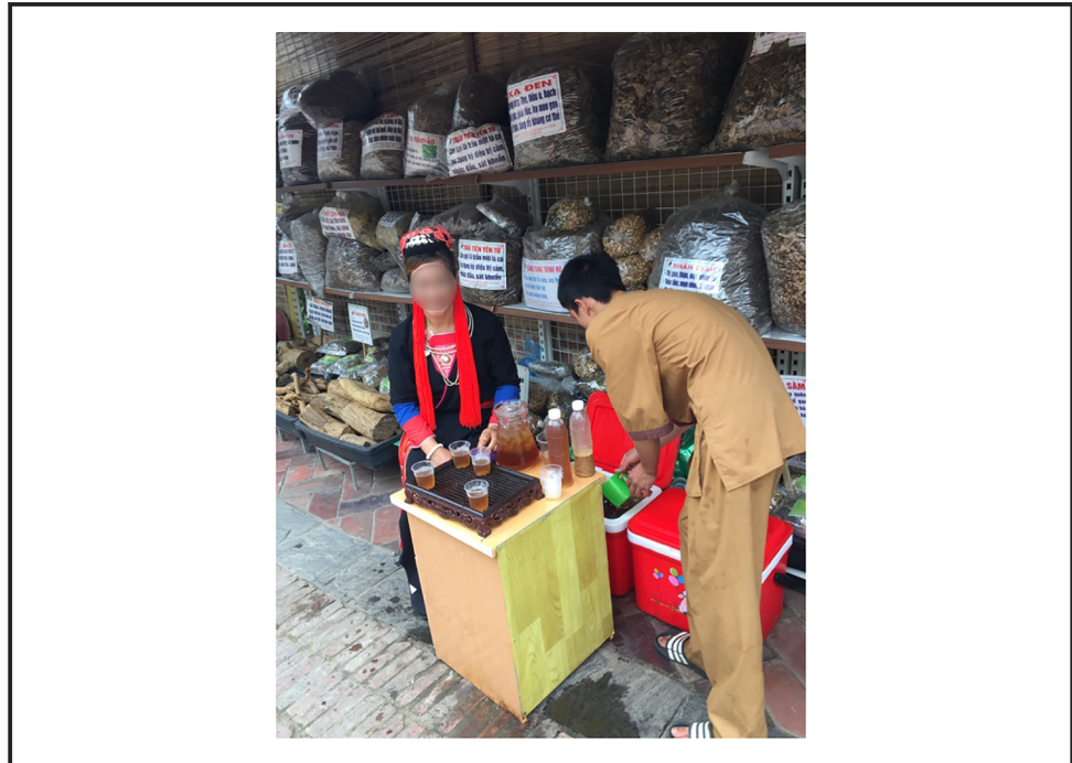
Plate 4 An ethnic minority promoting herbal drink in the village

importance of a local community leader with not only foresight and financial capability but also commitment to the community, heritage and cultural past of the place to create sustainable stories, employment and legacies for the local community. A place may not possess any tangible heritage, but the legacy of intangible heritage can be materialised with the partnership of creative place-makers. As the Chairman said: “[...] the company is not just about making money, [...] or economic development. The foundation of the business is the culture of the place[...].”