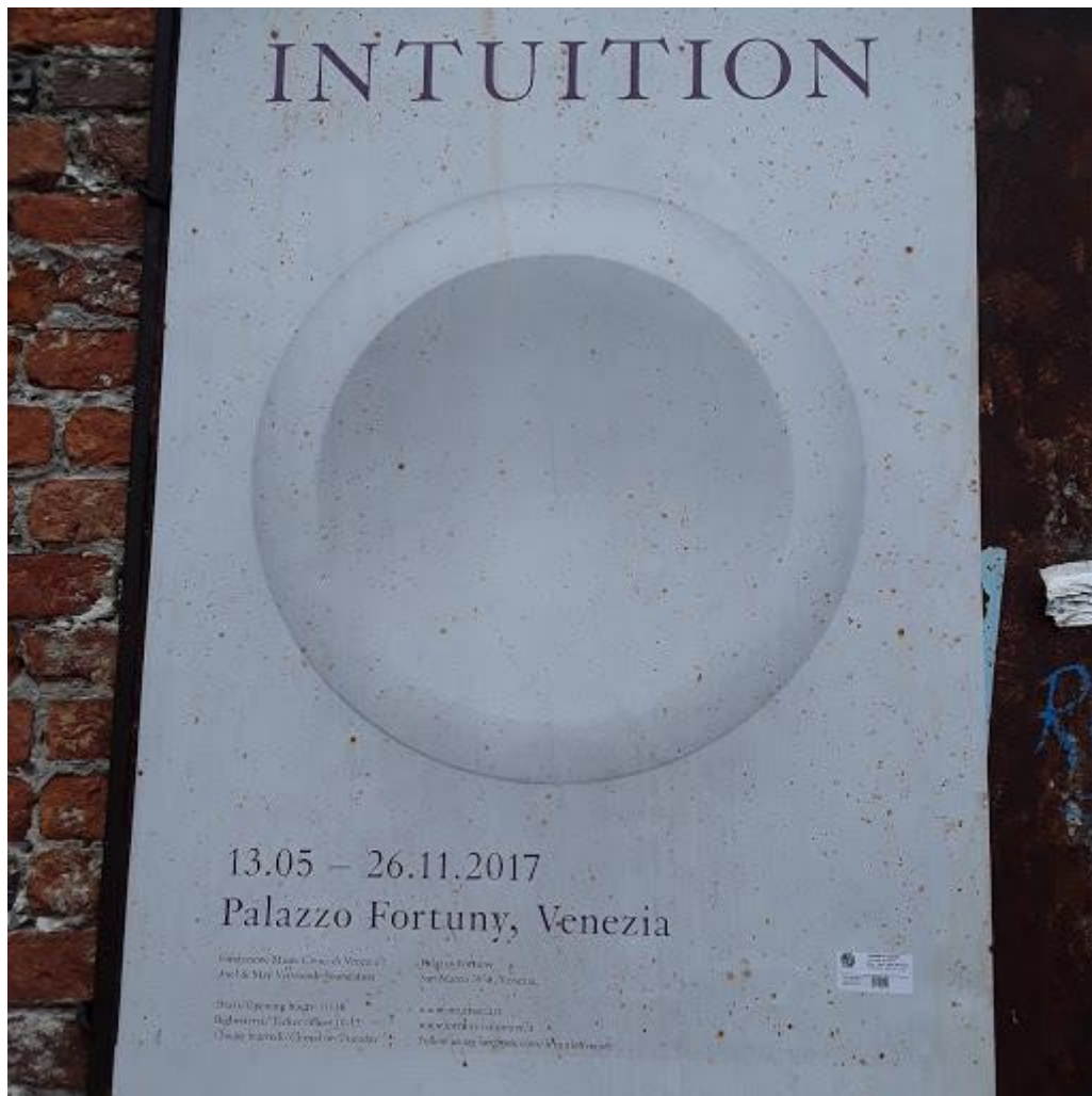
Figure 7: INTUITION

I thought this final image would never present itself. I contemplated purposefully seeking out an image, however that was not in keeping with the synchronous process of this heuristic journey. I waited and hoped, I thought perhaps I would not have a final image, just an empty frame. Then my stepfather sent me this from my parents' trip to Italy. It is an image of a poster for an exhibition exploring how intuition has shaped art across geographies, cultures and generations. My stepfather is an artist. He sent it on October 3 rd , approximately a month before the due date for this research. I was touched by the significance of him of all people sending this to me. This meant a lot to me. When he sent it I was finally able to ask him what he thought about intuition. Surprisingly he said "I value intuition highly. I think it's like another bodily sense, or perhaps a combination of the others. I haven't answered you fully, I know". This answer made me revisit my question about how much I projected my own devaluing of intuition onto others. Did I imagine my stepfather's derision of this part of myself? I thought about the incredible imagination my unconscious used to create myself as a 'bad witch' and how compassionate I now feel to this part of myself.