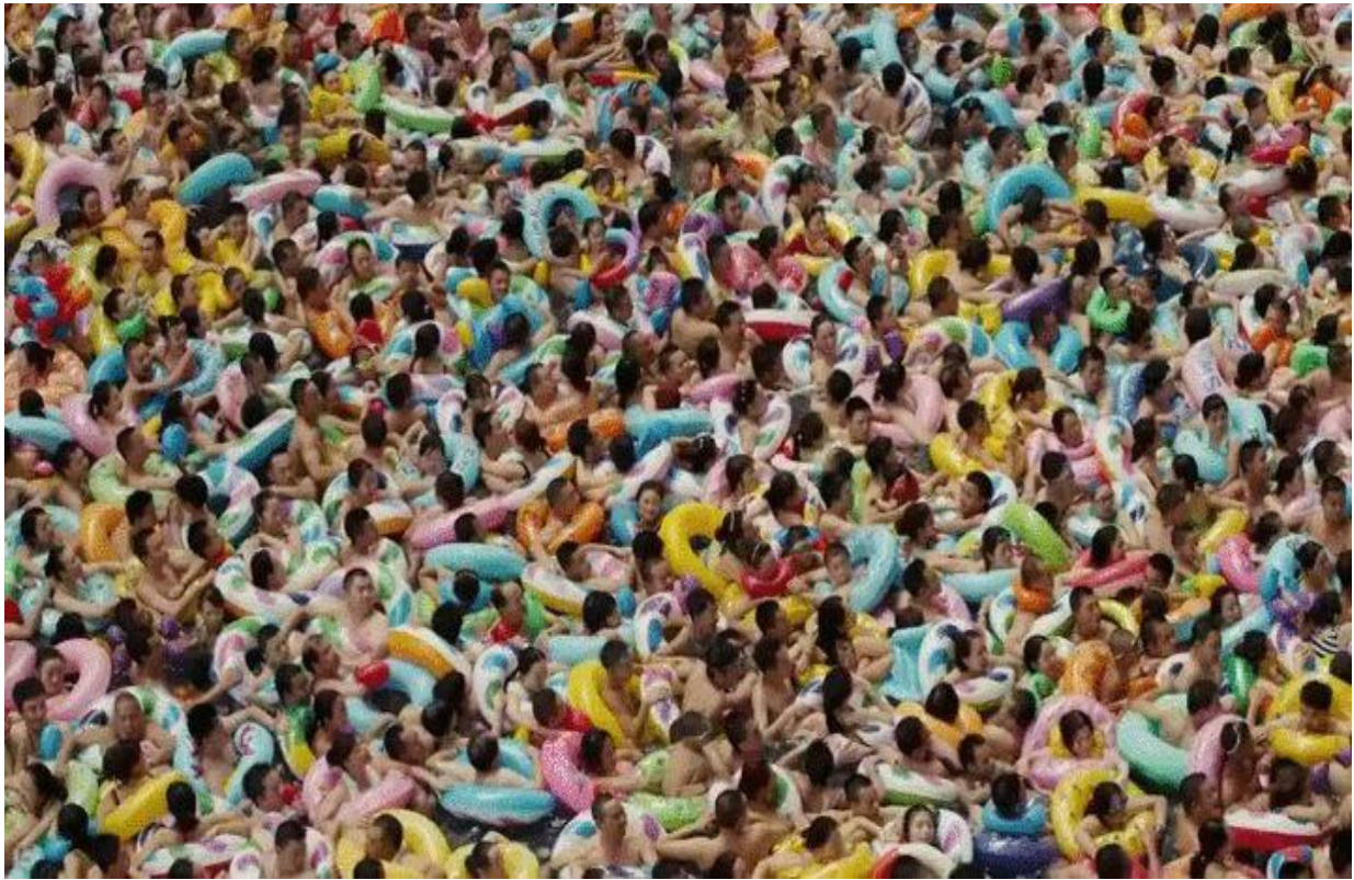
Figure 6: THE WAVE POOL

What emerged was the interconnectedness of people. As described, this image appeared at a point in the research process where I was beginning to wonder about intuition connecting us to other people.