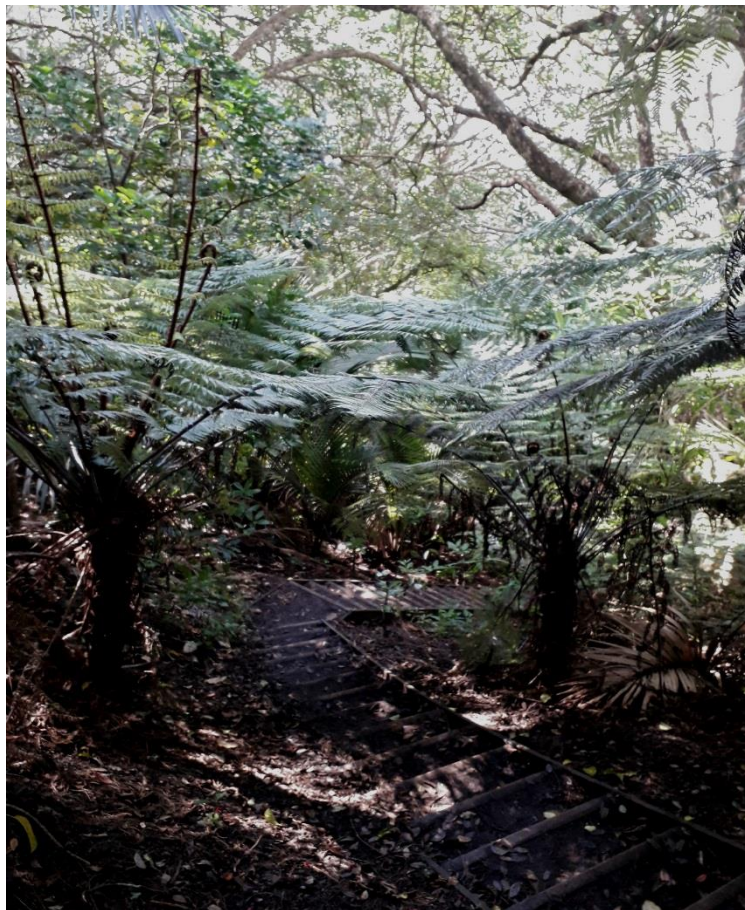
Figure 2: Bush Walk

What follows is a visual representation of this journey so far. The images presented themselves to me spontaneously. I found and made meaning in these images, they helped illuminate, uncover and reshape and came to represent my journey through this surprising, unpredictable, difficult, inspiring and ultimately transforming process.