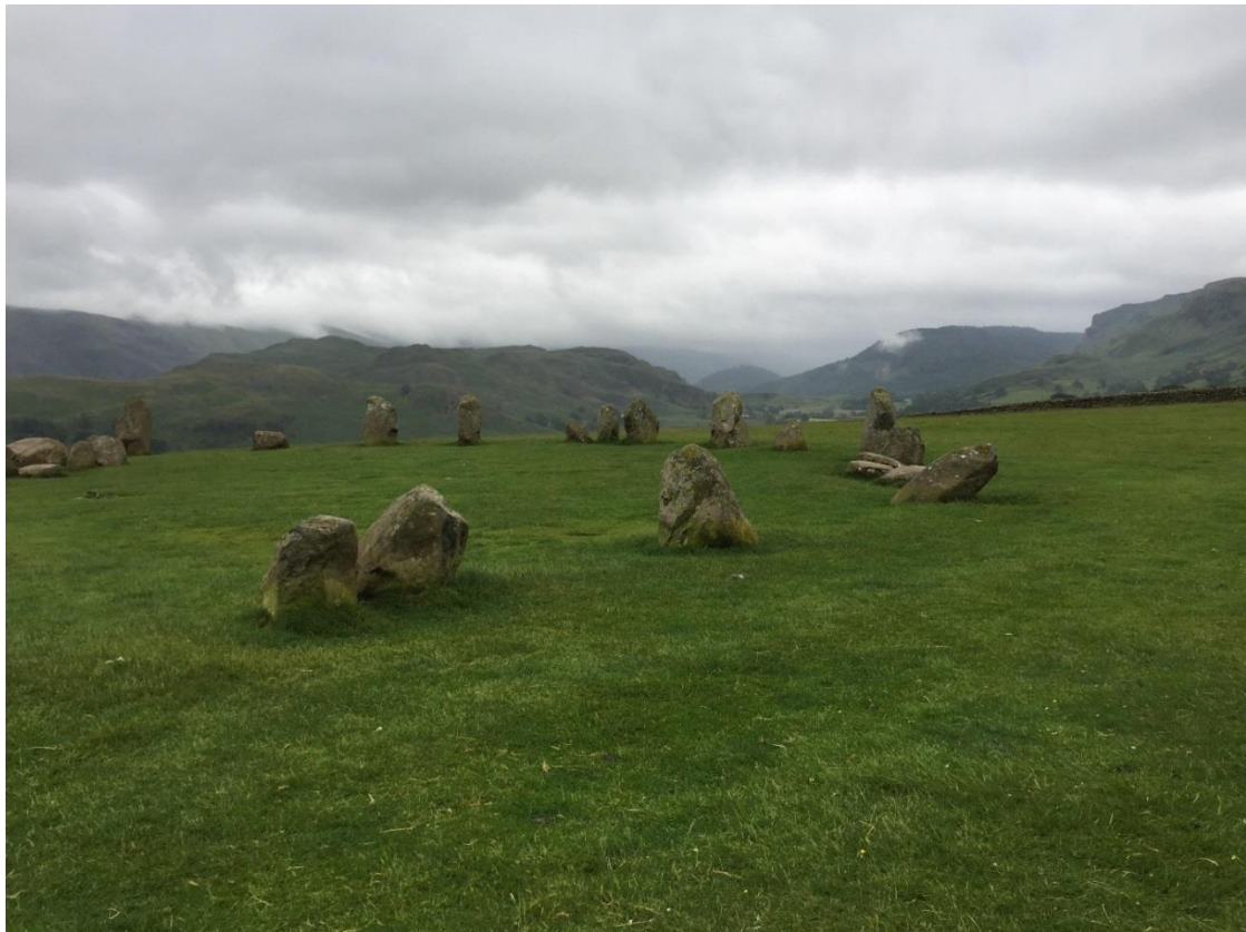
Figure 3: THE WITCHY WORLD

exciting and frightening. It is difficult to take the first step, I suspect pain and difficulty lie ahead. I have resistance.