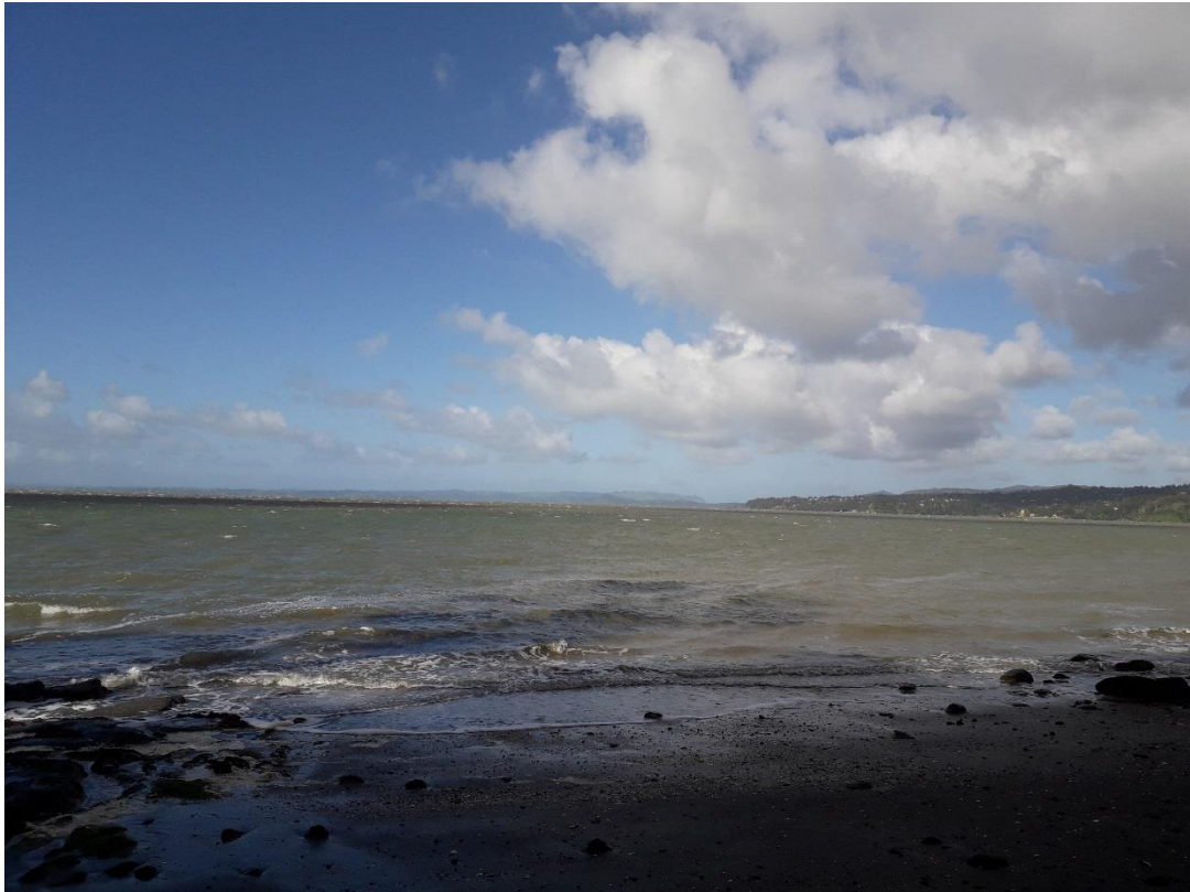
Figure 4: the horizon

This image struck me on a bike ride near my home, as described previously. The witchy world and my intellectual self were split. I struggled to be compassionate to both parts of myself and to find a way to bring them together.