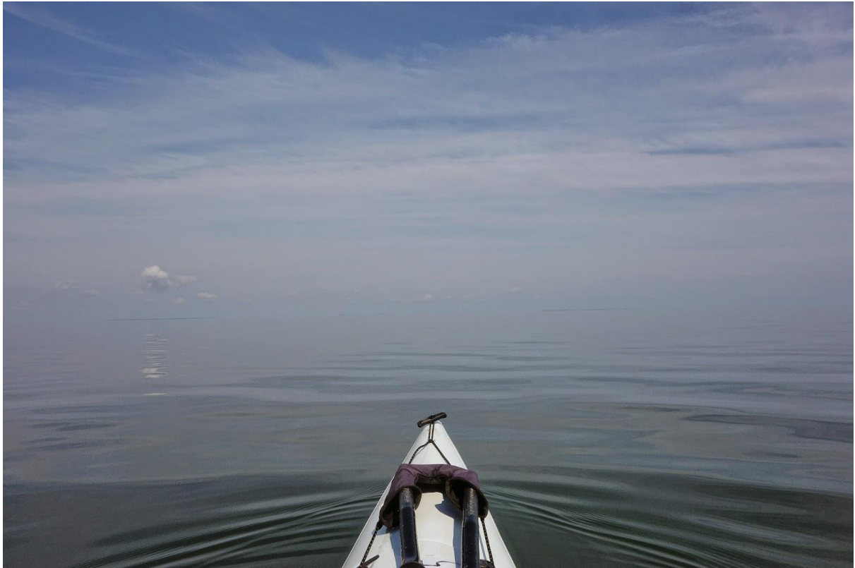
Figure 5: THE SPLIT IS BLURRING