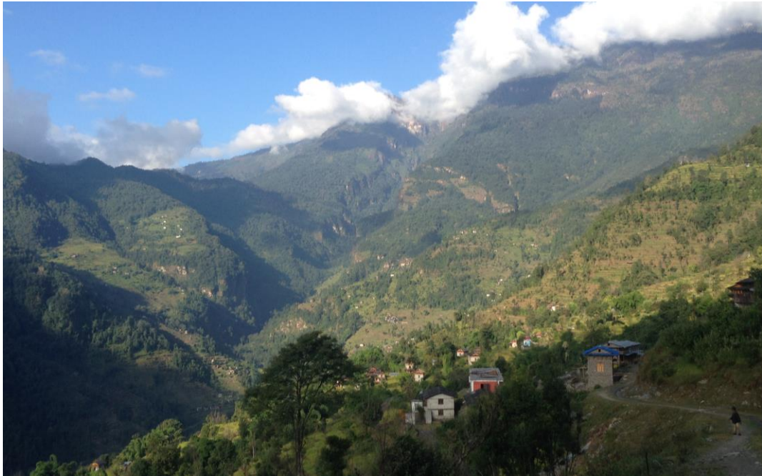
Figure 3: A picture of Lapilang VDC

The second information meeting was held at the community building in ward #3. Twelve people came to this meeting. Despite my initial plan to invite only potential participants to the meeting, community leaders came, including the chairperson of the Nepal Thami Society and local teachers. Unlike the first information meeting in ward #7, the discussion was heavily focused on the developmental issues of Thami communities. While my meeting agenda had somehow deviated from its initial intention, I was able to share my research with the group and discreetly navigate the discussion to focus on the current EMEP project in their community. The attendees observed that project had been making a good impact in the community as the numbers of early marriage had reduced; plus school dropouts had reduced significantly. Many young people have now been able to complete secondary level education (from year 10) as compared to five years ago before the project began. However, Thami youth were unable to continue onto higher education due to financial problems. Some of the participants enquired whether there would be a new project to be conducted in their communities following my research. I clarified that the aim of my research was not to promote a new project. The chairperson of the Nepal