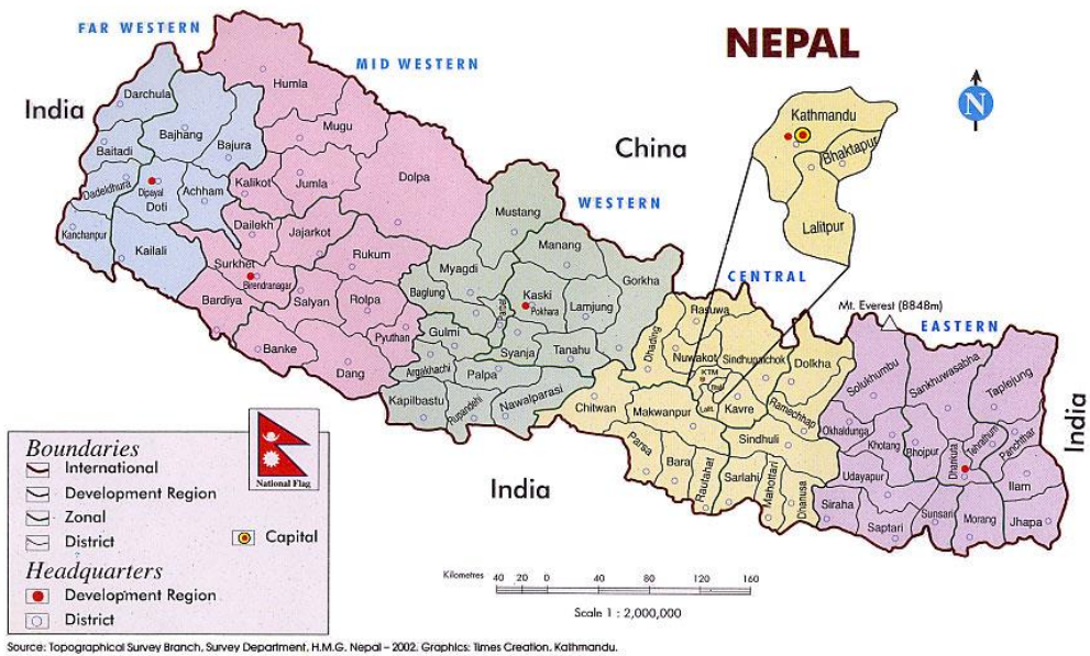
Figure 1: Map of Nepal