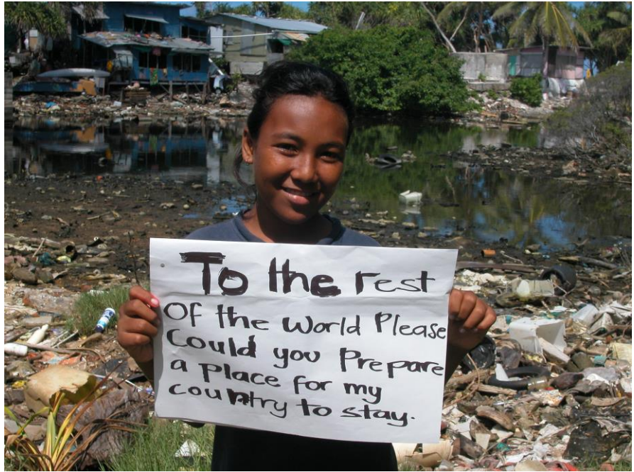
Figure 6: A girl with a "To the rest of the world" survival message from Tuvalu

slow responses from other agencies in the region.