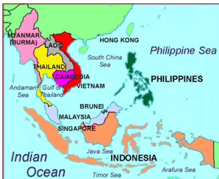
Figure 1 – Southeast Asian Map

Southeast Asia represents an area of sustained economic growth and exhibits potential for creating joint ventures as shown in its progress over the last two decades. The region is recognized as a fast economic growing area in the world as demonstrated by its recovery from the Asian financial crisis during the period of 1997 and 1998 (Rowley & Warner, 2010). Southeast Asia refers to the independent countries south of China, east of India and north of Australia. This includes Brunei, Cambodia, East Timor, Laos, Myanmar, Malaysia, Indonesia, Philippines, Singapore, Thailand and Vietnam (see Figure 1). With a total inflow foreign investment of US $36 billion in 2009, the emerging industrial economies in Southeast Asia have become significant destinations for foreign direct investment (UNCTAD, 2010).