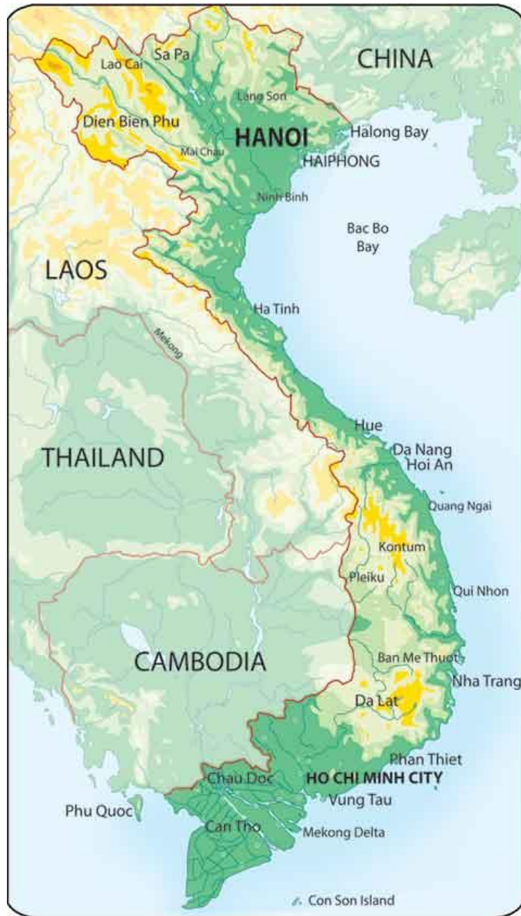
Figure 3 – Map of Vietnam

In joint ventures, foreign companies tend to invest physical infrastructure, technical knowledge and physical investments while Vietnamese partners provide legal knowledge, business contacts and equity in term of land (Anh & Meyer, 1999). Despite the government institutes attractive laws for foreign direct investment, foreign firms have still found obstacles for doing business in Vietnam. Between 1997 and 1999, the total amount of foreign direct investment decreased 24 percent per year and continued to decline by 39 percent in 2002 (The World Bank, 2002). The effect of regional