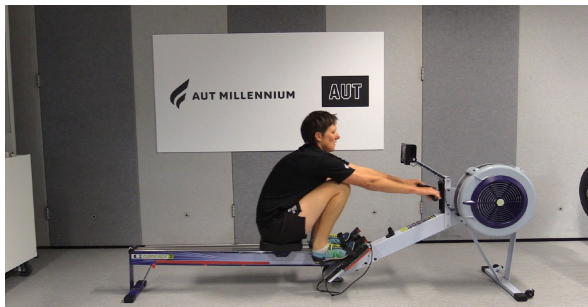
Figure 1: Fixed ergometer.