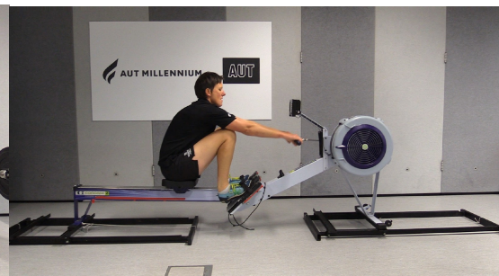
Figure 2: Sliding ergometer.