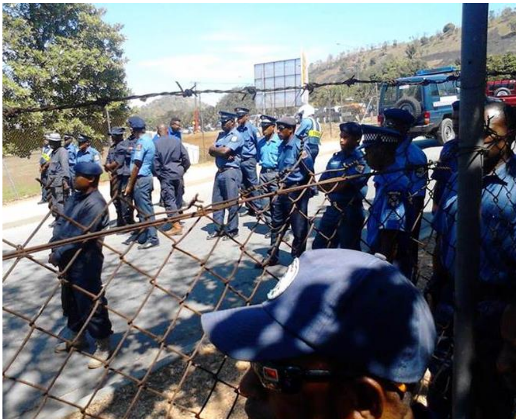
Figure 1. Papua New Guinea police blockading the entrance to the University of Papua New Guinea, where the award-winning Uni Tavor was published and where Asia Pacific Report has a network of correspondents.