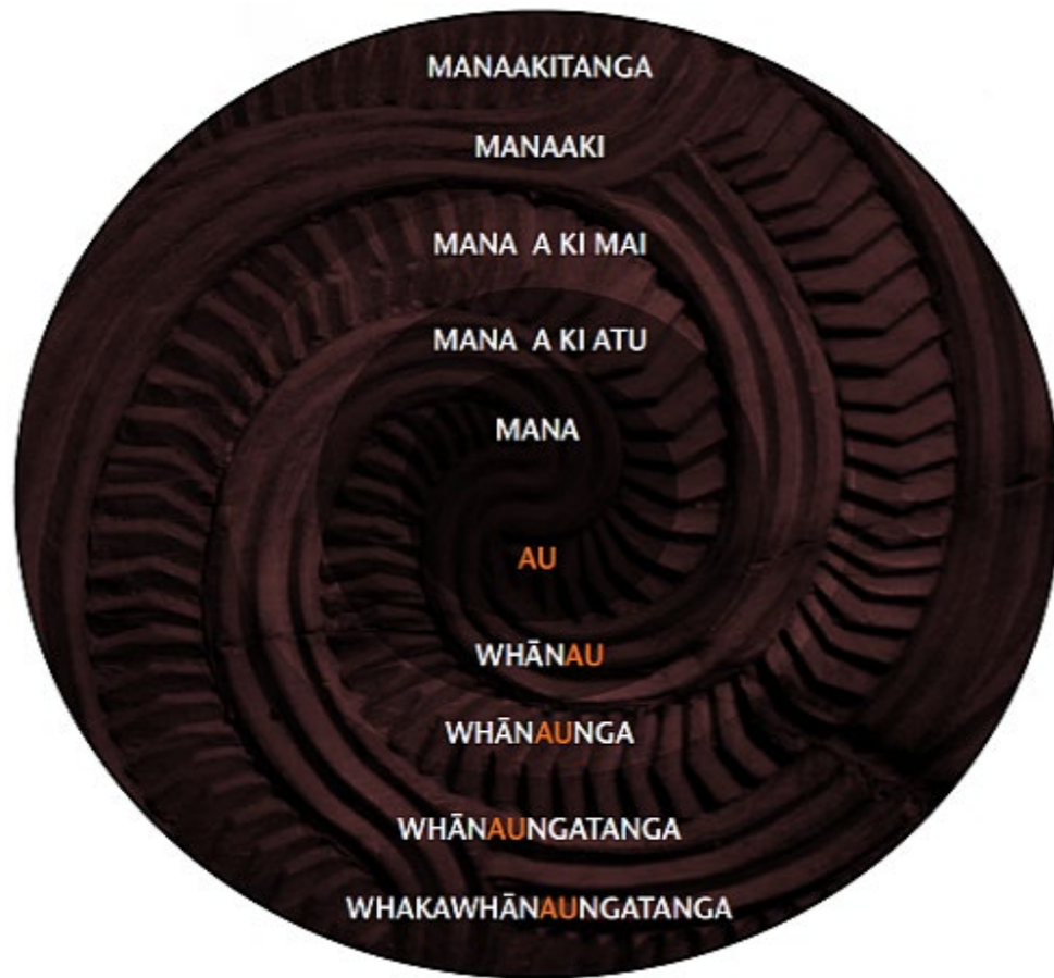
Figure 5 Au to Whakawhānaungatanga framework diagram (TKI & Ministry of Education, n.d.)