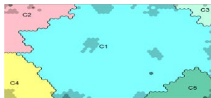
Figure 1. Overall cluster map for developers' linguistic usage

As noted above we extracted measures for linguistic classes representing social attitudes, cognitive attitudes, achievement attitudes and individualistic (negative) attitudes according to the LIWC corpus for the 117,101 messages in release 1.0.1 of Jazz. Given that the individual developer was our unit of analysis the relevant linguistic measures were aggregated into a vector to represent each of the 474 contributors. Not unexpectedly, message distribution was uneven: a few developers submitted as little as one message, while the maximum number of messages contributed by a single contributor was 5,403. We then allowed the SOM unsupervised learning algorithm to cluster practitioners based on their linguistic usage. The output from the Viscovery SOMine package is presented in the map in Figure 1, which shows that the 474 developers were automatically grouped into five clusters (C1 to C5) by the SOM algorithm. We examine each of these clusters and associated data in answering our two research questions in the subsections that follow.