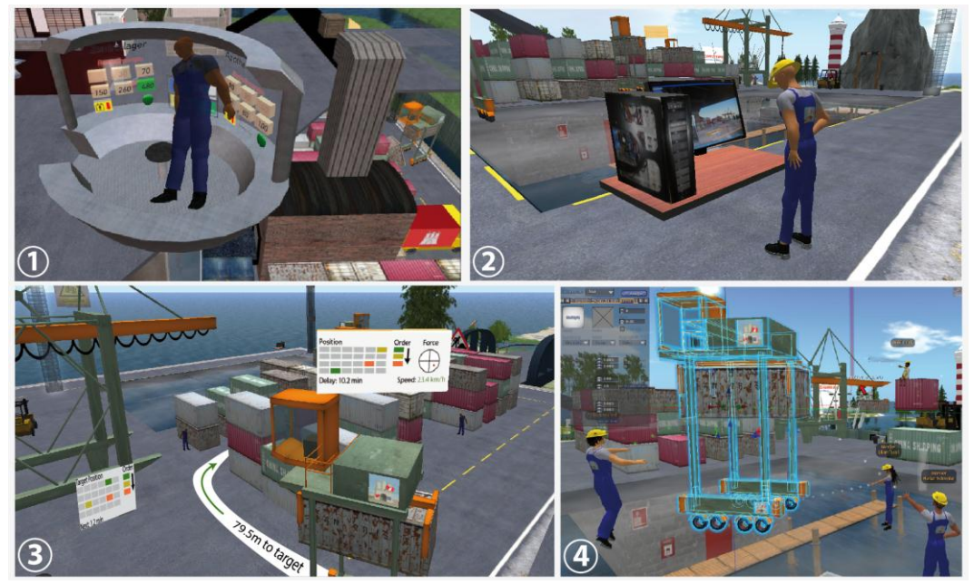
Figure 2: Multiple perspectives on the same scenario within the logistics component: 1) supply manager decides on order quantities to be ordered to the warehouse; 2) the controller on the container terminal receives the information and decides on shipment orders; 3) operations managers analyse the performance of the movements on the terminal; 4) engineers plan on improving equipment to increase performance (Burmester, Burmester, & Reiners, 2008; Reiners, 2010; Wriedt, Reiners, & Ebeling, 2008).

3. Reviewing a scenario from different perspectives is important to support analysis and reflection; yet, even multiple cameras filming the training would restrict the observation to a defined set of perspectives, not accounting for the overhead in case of vehicle training or problems aligning video feeds and data streams. In a virtual setting, recorded sessions can be reviewed from any perspective, allowing time dilation or contraction or the visualisation of important events from different locations. Driving straddle carriers on a container terminal requires many skills, fundamental to which are the capabilities to pass through narrow lanes in container stacks, managing centrifugal forces while turning corners, precision in container placement. Similar to flight simulators or racing simulations, the learner can navigate through a recorded session, move the camera to any perspective, and add live visualisation of data into the stream (e.g., an accurate report on the distance between containers or physics forces acting on the vehicle).