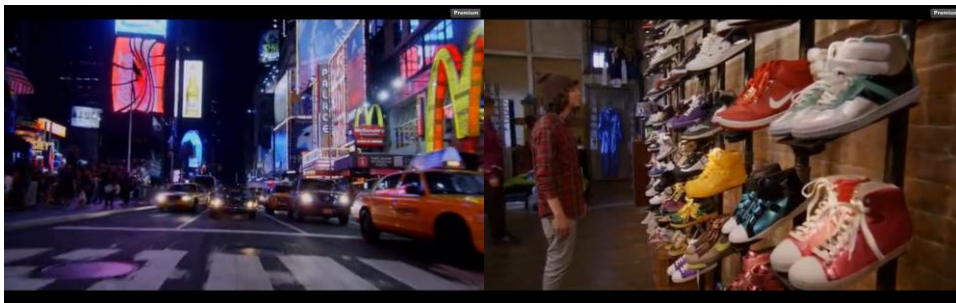
Length on clip: 8:52 – 9:25

Explanation: The clip will start on Moose's university orientation tour, will on the tour he bumps into Luke and gets drawn into an dance battle