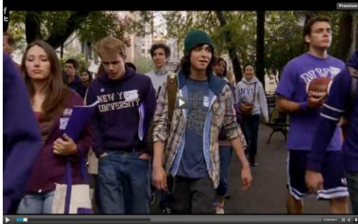
Intro Scene: Length of clip 2:40 – 6:00

Plot Summary From IMDB: Moose attends NYU, to become an engineering student, he intends to quit dancing, after an accidental collision with Luke, he finds himself drawn into an impromptu dance battle. After seeing his winning dance moves Luke befriends Moose and introduces him to other misfit dancers and the vault (a community building where the dancers live and train).