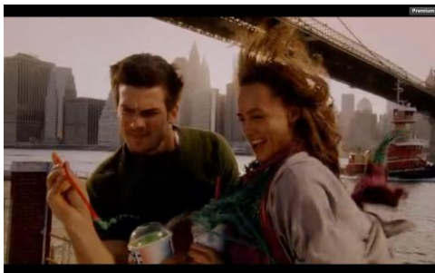
Length of Clip: 42:18 - 43:39

Explanation: Luke rescues Moose after the dance battle ends badly, and takes him to his house