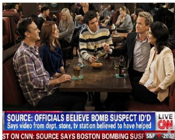
An example of a news alert on How I Met Your Mother

As depicted in Figure 2 , live and breaking news is streaming at the bottom of the screen during an episode of How I Met Your Mother . Going back to the initial scenario, Barbara is reading the news alerts and is not focusing on the entertainment content of the programme because she is driven and focused solely on reading the news. In this case Barbara is utilising conscious avoidance, one of the two distinct types of cognitive processing the other being unconscious. The distinction between the two is important as they both affect the effectiveness of product placement in different ways. In order to understand the impact each