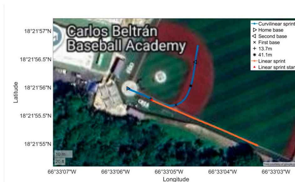
Figure 1. Samples collected during the straight-line and curvilinear sprints.

bias, signals from at least four satellites are required. The GPS device used sampled positional and velocity data at 10 Hz using an eighth-generation Swiss high-precision chipset (VX Sport, Wellington, New Zealand). The unit supports multiple satellite constellations, including GPS, GLONASS, QZSS, SBAS, Galileo, and BeiDou, allowing for improved satellite visibility and positioning robustness during outdoor athletic performance monitoring. The device operates as a multi-GNSS receiver but does not utilize real-time kinematic (RTK), precise point positioning (PPP), or differential GNSS correction methods. The unit includes a nine-axis inertial measurement unit (IMU) composed of three-axis accelerometers, gyroscopes, and magnetometers, each sampled at 100 Hz, allowing detailed monitoring of body motion. The GPS device was affixed posteriorly between the scapulae in a vest to maintain antenna orientation and minimize movement. Approximately 30 min prior to data collection, calibration coordinates were recorded for home, first and second base locations along with the start and end of the 27.4 m sprint (see Figure 1). The unit was then powered off to save the calibration data in a separate file, and subsequently powered on again to enable satellite signal recognition and stabilization approximately 15 min before each testing session [17].