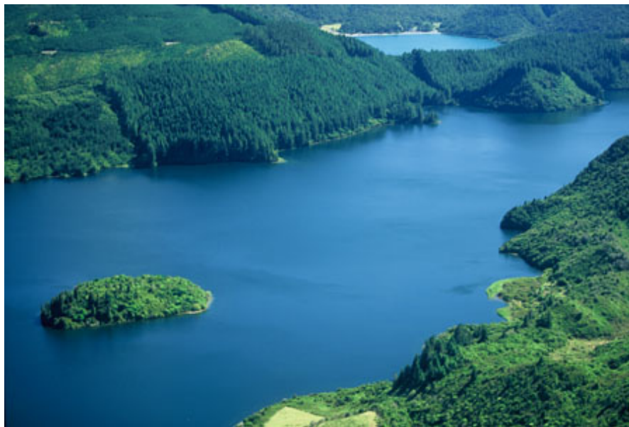
Figure 5: Lake Rotokākahi, Motutawa Island foreground

Motutawa Island has not been occupied since the late eighteenth century. It has become a main burial ground for tribal members.