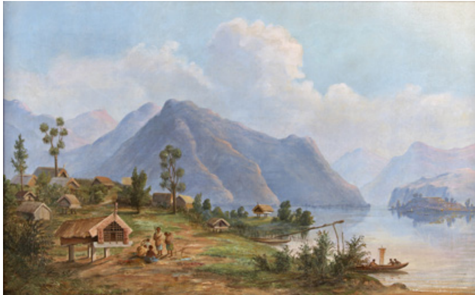
Figure 4: Kaiteriria Pa on the shores of Lake Rotokākahi

(Artist Charles Blomfeld 1822 source http://www.artis-jgg.co.nz/iframe3 )