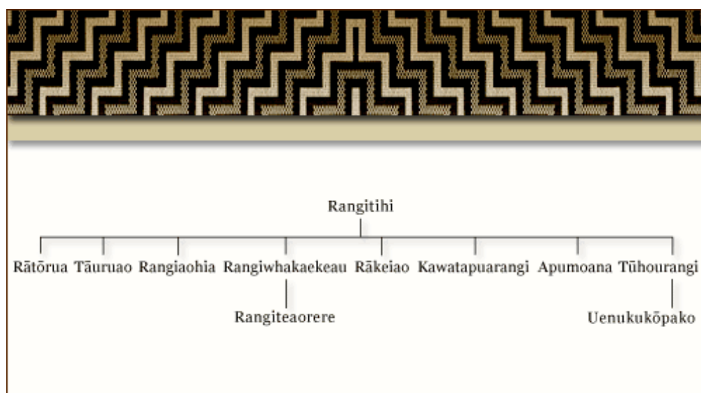
Figure 3: Whakapapa/genealogy of Rangitihi