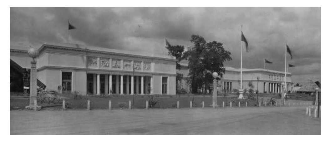
Figure 1: The New Zealand Pavilion at the 1924 British Empire Exhibition, flanked by Mataatua wharenui (left) and the fale from Mulinu'u (right).