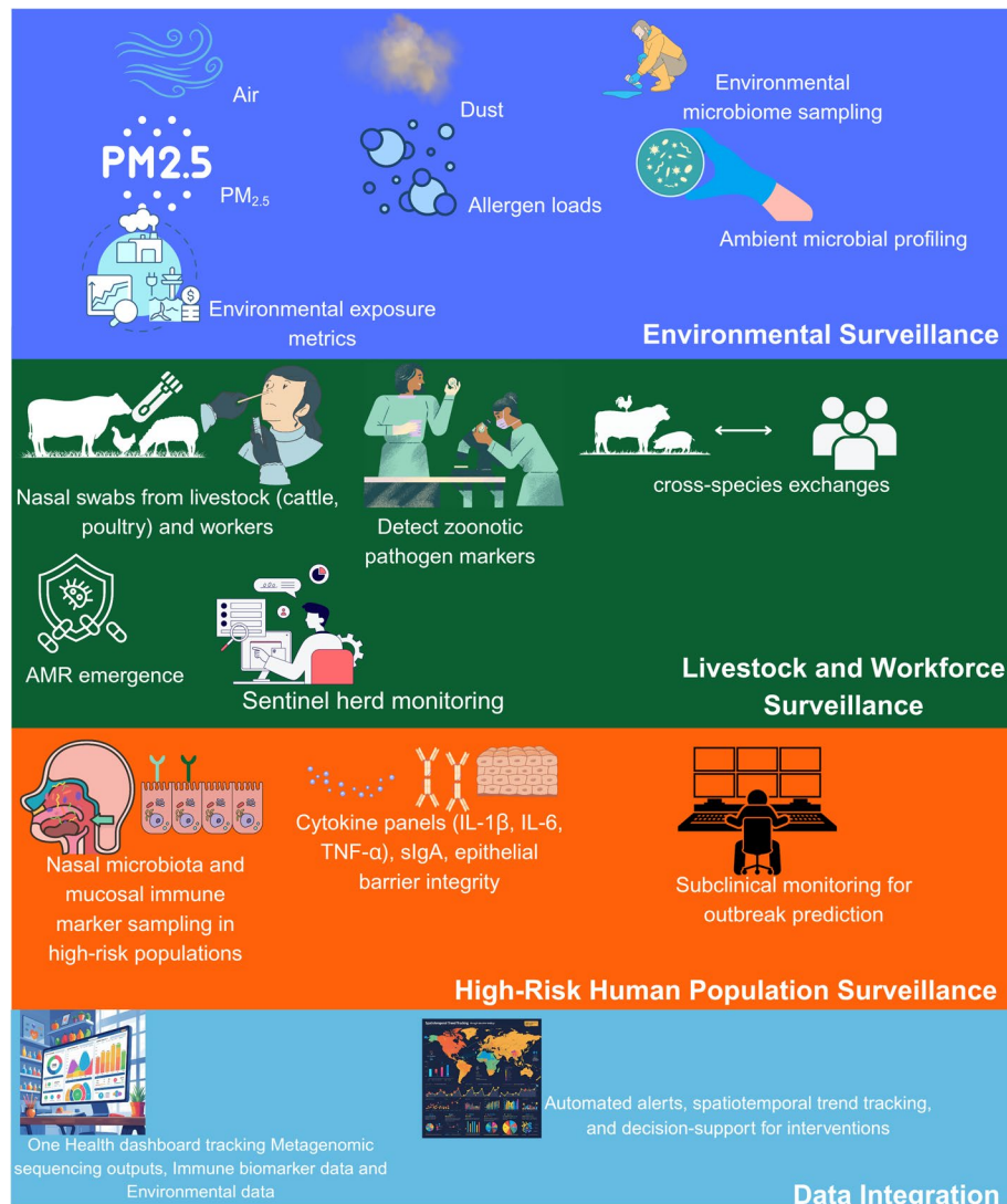
Fig. 2 Proposed prototype for nasal microbiome-based One Health surveillance