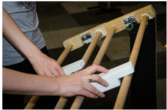
Figure 3. Space Octopus Mono.

Of particular interest is the game “Word Wars”, conceived in 2013. The game springs from a minimalist design perspective, namely, the investigation of game mechanics that arise if each player only has one button. It has a simple ruleset, is casual yet tense, and encourages a tight social experience around a waist-height cabinet. It is built in Processing for the purpose of receiving multiple button presses through Arduino, where a standard keyboard will limit simultaneous key presses to six. Gameplay in Word Wars is based around completing an English word more than three letters long. Each player pushes their button to try and grab the letter in the middle of the shared screen. In its own way, this game challenges the pervading view that the “button” is impeding game media development and rejects the call to “discard the button in favour of natural interfaces”. It clearly demonstrates that the simple button can in fact facilitate more social game play and be used in innovative and exciting game designs. This suggests that perhaps the humble button is not a major issue, but instead the lack of creativity in designing play in a fun and engaging manner.