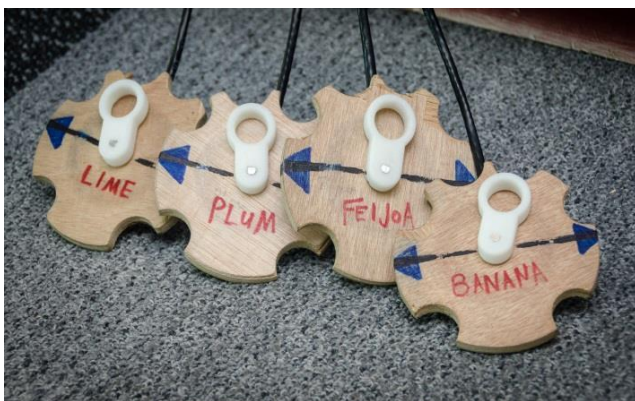
Figure 2. Fruit Racers.

Figure 2 and Figure 3 highlight two of the interfaces developed for the games. Figure 2 shows the rotary encoders used in the game “Fruit Racers” whereas Figure 3 shows the ultrasonic sensors and sliding rails used in “Space Octopus Mono”.