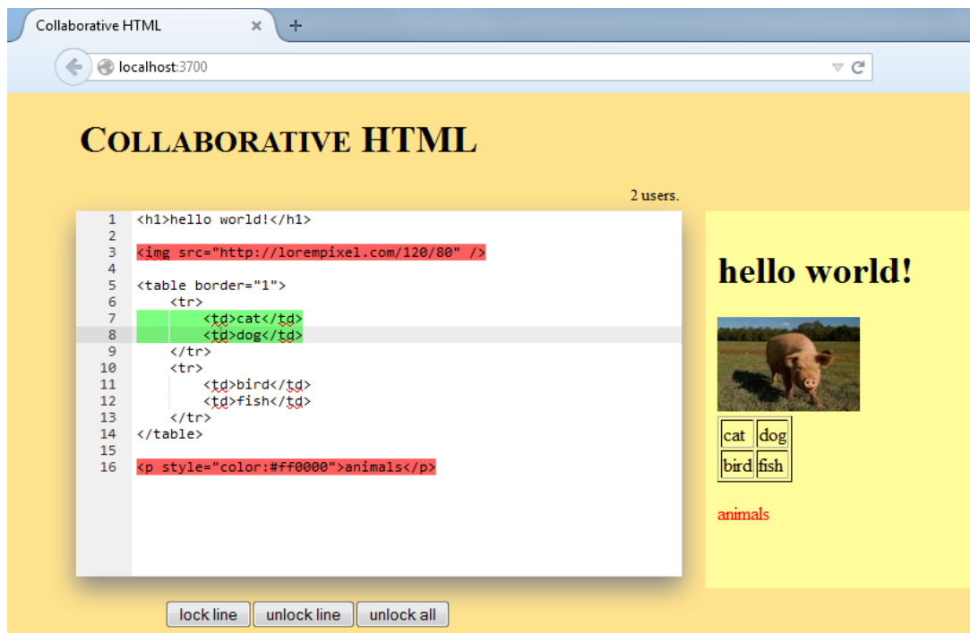
Figure 1: Screenshot of our collaborative HTML editing prototype.

Utilising the technologies described in Section 3.2., we developed a collaborative HTML editing application aimed at novice programmers. The application runs on a client-server architecture, with each client able to connect through a web browser by navigating to the URL of the server. Figure 1 displays the client-side user interface of the application.