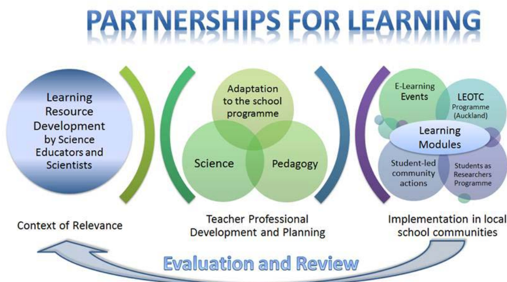
Figure 2 Draft model for LENSscience's partnerships for learning