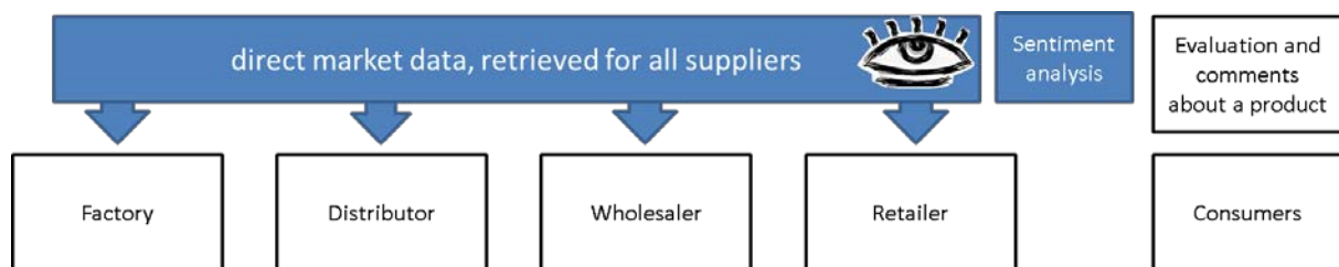
Figure 2. A simple supply chain showing a delay in information transmission along the supply chain and different types of information.