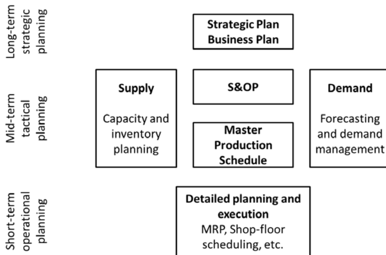
Figure 1 The Sales and Operations Planning process in the context of various types of business planning. Adapted from Figure 2-1 in Wallace & Stahl (2008).

This is a copy of the 'post-print'; i.e., the final draft, post-refereeing.