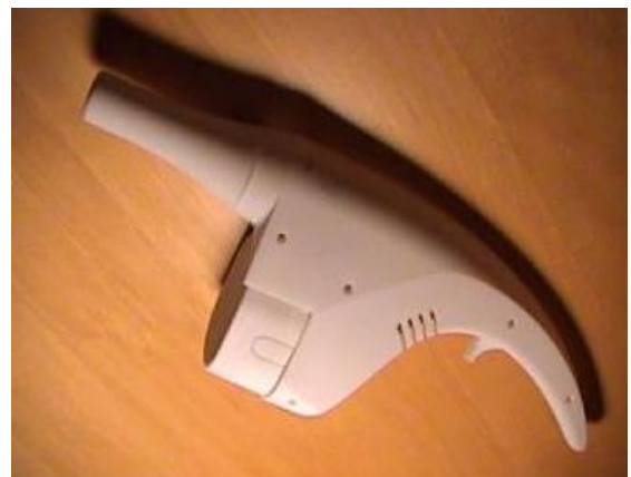
Figure 2 CAD modelling (left) leading to rapid prototype parts for proof of concept (right)

From a regional perspective, public money has been used to invest in expensive capital items. In some cases, the technology is well beyond the reach of our SME clients to afford. However, the