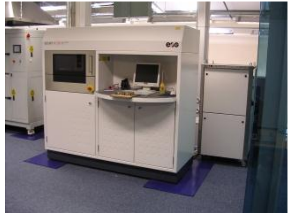
Figure 1 Rapid manufacturing facilities of the IPDC

The significant investments that have been made in “time compression technologies” e.g. computer-aided design (CAD), computer aided manufacture (CAM), and rapid prototyping, reflect a commitment to rapid product development practice (Figure 1). Through the IPDC the entrepreneurial SME can access the facilities to support their product development project at minimum risk to the company and zero investment on their part in the technology. For example, the development of CAD models of design concepts can quickly lead to prototype parts being made in the Centre’s rapid manufacturing facility – these prototypes allow for an early evaluation of design concepts and enable the “proof of concept” stage to be delivered quickly and effectively (Figure 2).