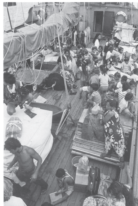
Rongelap Islanders on board the Rainbow Warrior bound for Mejato