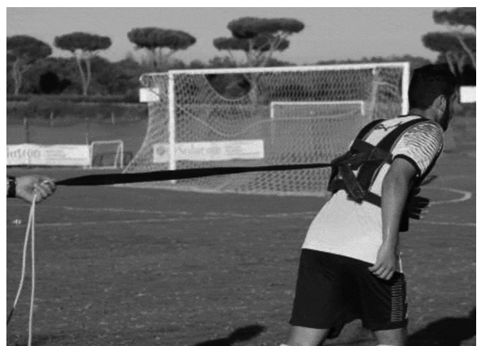
FIG. 2. Resistance-sprint harness