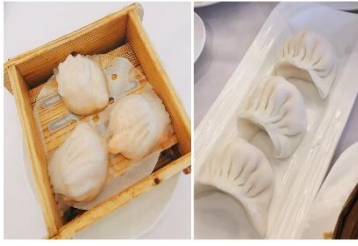
Figure 2(a). Har gow (left) and cold har gow (right).