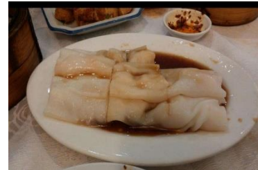
Figure 9(i). Cheung fan .

Data not available on Zomato. Hees Garden Seafood Restaurant.