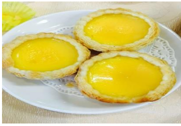
Figure 21(a). Daahn taat .