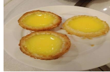
Figure 21(i). Daahn taat .