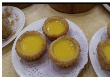
Figure 21(k). Daahn taat .