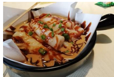
Figure 8(k). Cheung fan dressed with barbecue sauce and tomato sauce.

Data not available on Dian Ping. Ding Long Dian Xin Zai.