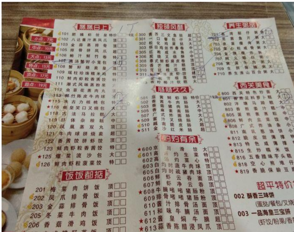
Figure 25(e). Menu of Fei Yi Liang Dian.