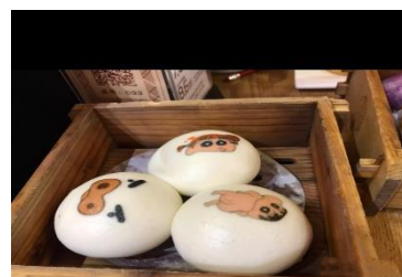
Figure 17(f). Liu sha baau with cartoon images on surface.