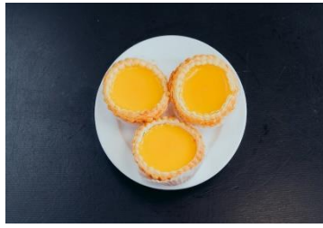
Figure 21(b). Daahn taat .