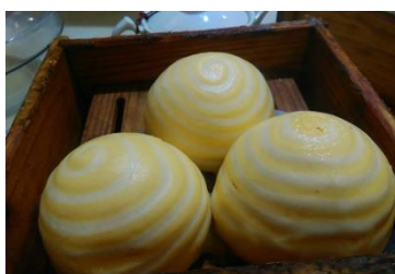
Figure 17(e). Colourful liu sha baau .