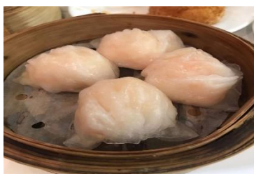
Figure 3(d). Har gow .