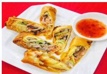
Figure 11(k). Cheese cheun gyun served with sweet sauce.