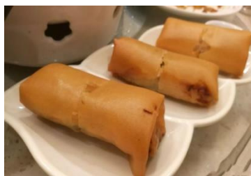
Figure 11(e). Cheun gyun .