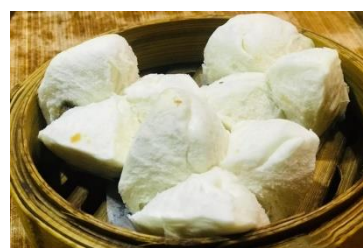
Figure 23(i). Wholemeal cha siu baau .