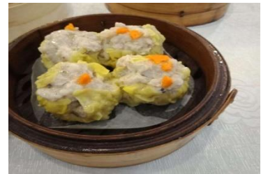
Figure 6(h). Siu mai .