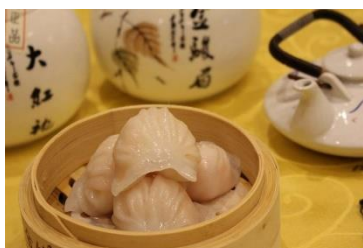
Figure 3(j). Har gow .