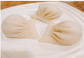
Figure 2(g). Cold har gow wrapped in glutinous rice dough.