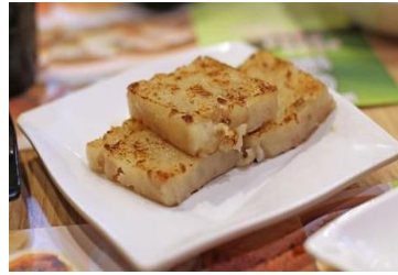
Figure 13. Traditional loh baahk gou .

Loh baahk gou is one of the favourite dishes “among locals of all ages” (Qu, 2016, p. 35). Although loh baahk gou is usually labelled as turnip cake in English, traditional loh baahk gou , as seen in Figure 13, is actually made with fresh grated Chinese radish, fried and diced Chinese sausage or cured meat, shrimp, and shiitake mushroom, and then mixed with rice flour, and steamed into cakes (Qu, 2016). After cooking, loh baahk gou is cut into rectangular pieces and then pan-fried until a brown crispy crust has formed so that it tastes soft inside and crispy outside. In the Chaozhou region of Guangzhou, loh baahk gou is a popular New Year dish which can be found everywhere across the region during the Chinese New Year. Cooked loh Baahk gou can be either eaten directly or with soy sauce (Mo, 2009).