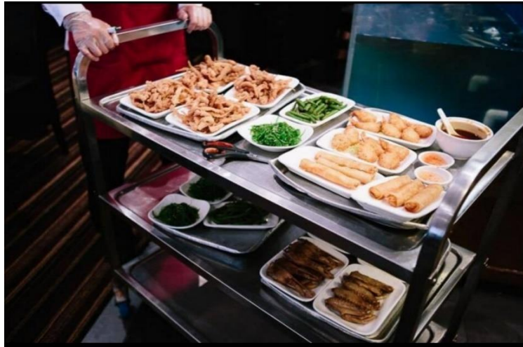
Figure 31. Dim Sum cart.