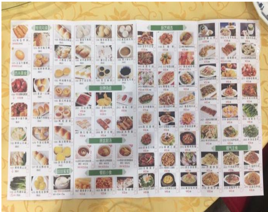
Figure 25(b). Menu of Panxi Restaurant. Source: Panxi Restaurant (Dian Ping-Guangzhou).