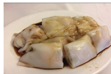
Figure 9(k). Cheung fan .