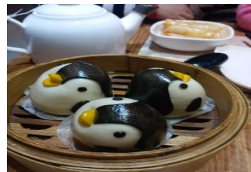
Figure 17(i). Penguin-shaped liu sha baau .