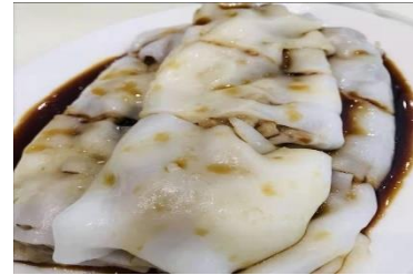
Figure 9(c). Cheung fan .