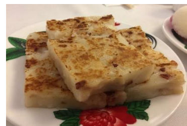
Figure 15(l). Loh baahk gou .