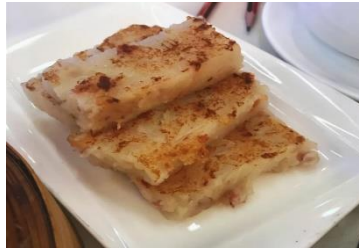
Figure 14(h). Pan-fried loh baahk gou .