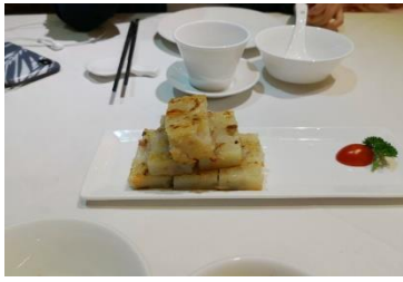
Figure 14(a). Loh baahk gou .