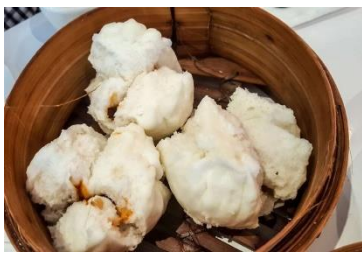
Figure 24(d). Cha siu baau .