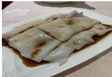
Figure 9(h). Cheung fan .