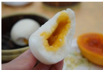
Figure 17(b). Liu sha baau .