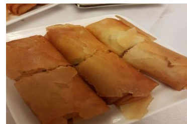
Figure 12(h). Cheun gyun .

Data not available on Zomato. Imperial Palace.