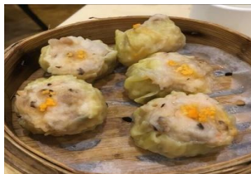
Figure 6(j). Siu mai .