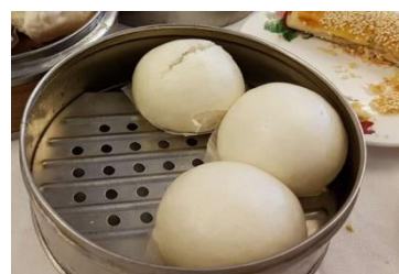
Figure 18(h). Liu sha baau .