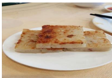
Figure 15(k). Loh baahk gou .