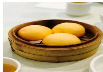
Figure 18(b). Liu sha baau .

Data not available Zomato. Canton Flavor.