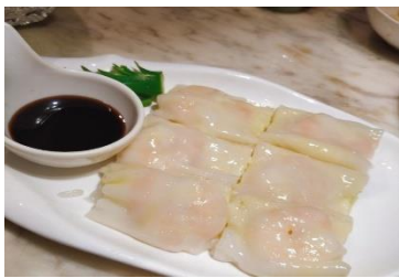
Figure 8(d). Cheung fan .