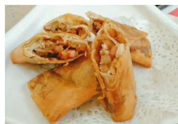
Figure 11(c). Cheun gyun .