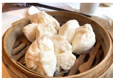
Figure 23(b). Cha siu baau .