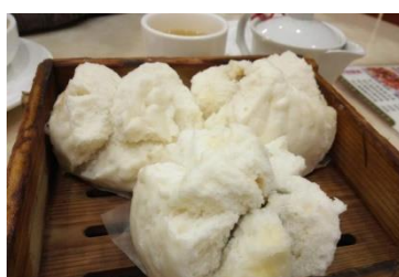
Figure 23(e). Wholemeal cha siu baau .