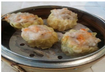
Figure 6(f). Siu mai .