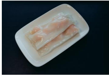
Figure 9(b). Cheung fan .