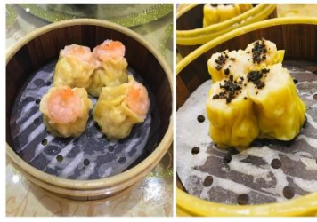
Figure 5(b). Siu mai (left) and siu mai topped with black truffle (right). Source: Pan Xi Restaurant (Dian Ping-Guangzhou).