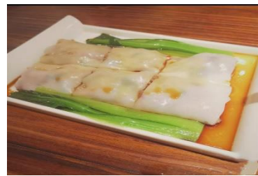
Figure 8(f). Cheung fan .