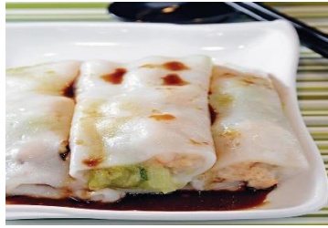
Figure 7. Traditional cheung fan with soy dressing.

“ Cheung fan means ‘intestine’ and fan refers to ‘rice noodle’. The name cheung fan came from the shape of the roll since the rice sheet is wrapped into a roll like the intestine of a pig” (Wah, 2011, p. 159). The rice roll of cheung fan is made from rice flour; sometimes chestnut flour, wheat starch, corn starch or potato starch can also be added (Mo, 2009). The perfect cooked cheung fan should be “thin, chewy, smooth and had [has] a special flavour” (Wah, 2011, p. 161). Cheung fan can be filled or unfilled. The most classic fillings for cheung fan are shrimp, pork, and beef (Wah, 2011). Traditional cheung fan (Figure 7) is served with soy sauce which can be either a dipping sauce or a dressing (Mo, 2009).