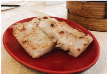
Figure 15(a). Loh baahk gou .