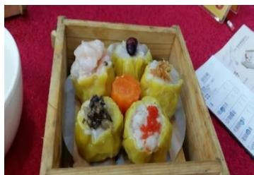
Figure 5(k). Five types of siu mai .