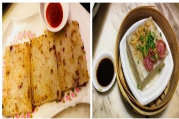
Figure 14(d). Normal loh baahk gou (left) and loh baahk gou served as a whole (right)