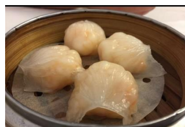
Figure 3(l). Har gow .