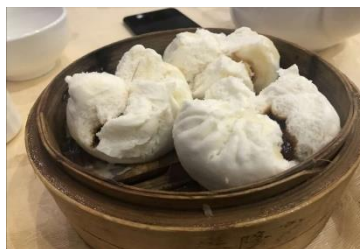
Figure 24(j). Cha siu baau .