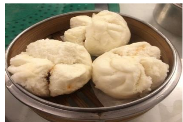
Figure 24(k). Cha siu baau .