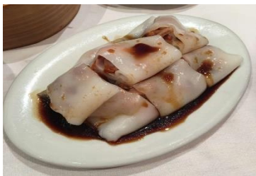
Figure 9(d). Cheung fan .