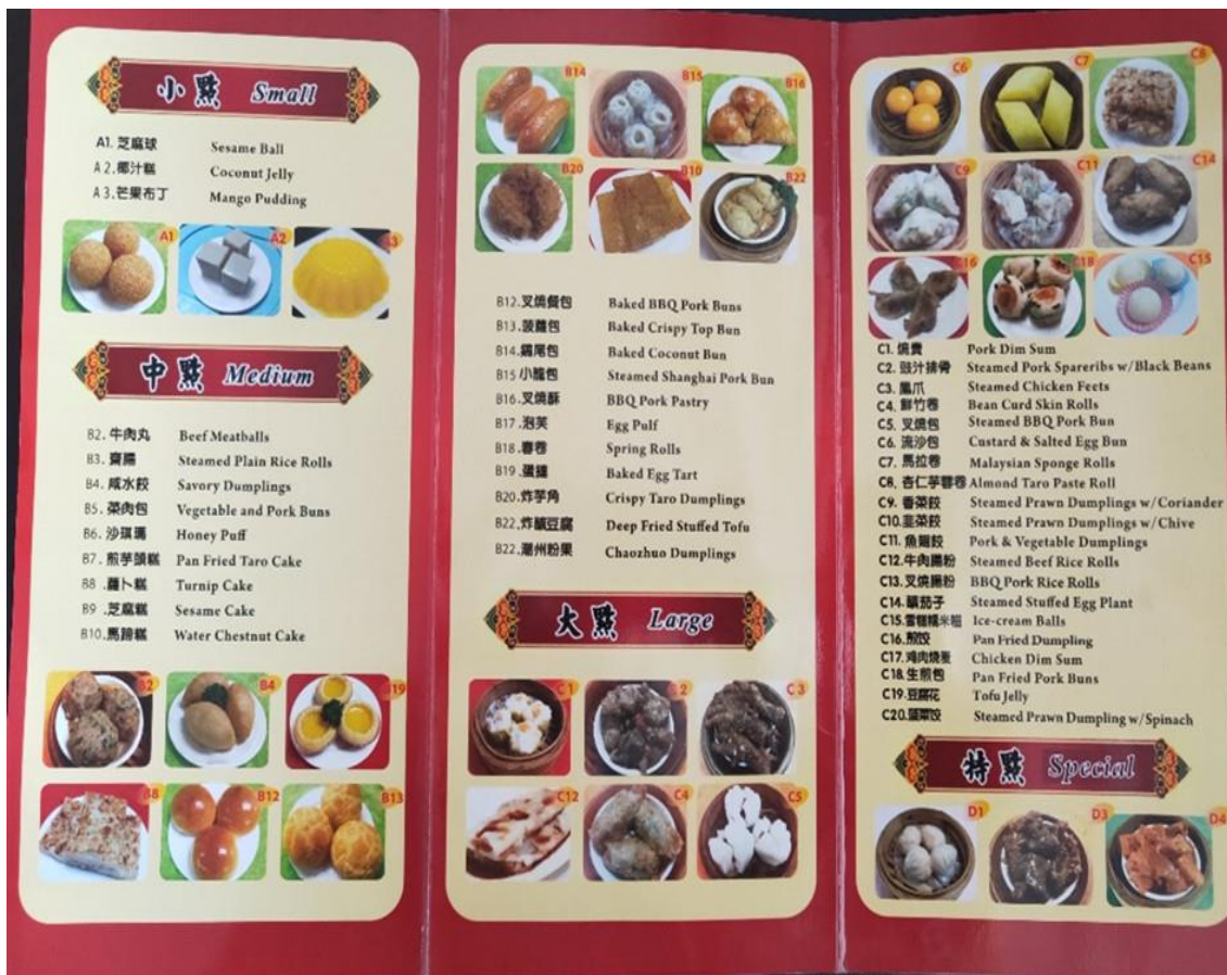
Figure 26(c). Menu of Lucky Fortune Restaurant.