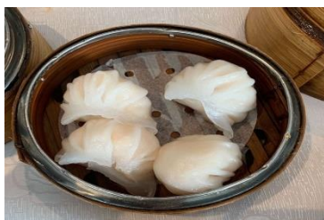
Figure 3(g). Har gow .