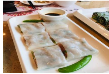
Figure 8(c). Cheung fan .