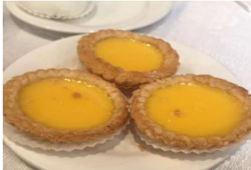
Figure 21(g). Daahn taat .