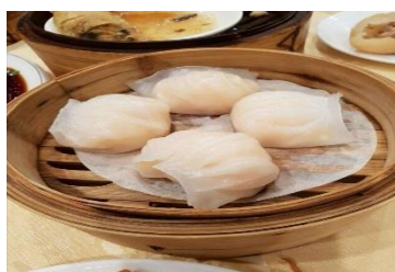
Figure 3(k). Har gow .