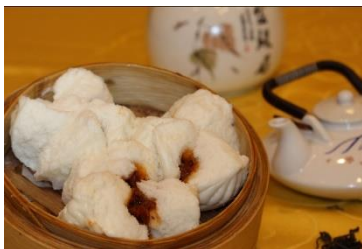
Figure 24(i). Cha siu baau .