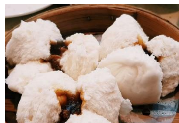
Figure 23(c). Cha siu baau .