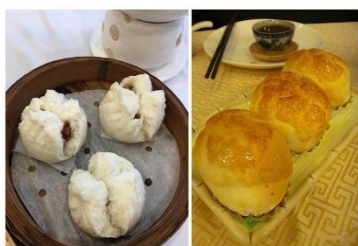
Figure 23(a). Steamed wholemeal cha siu baau (left) and baked cha siu baau (right).