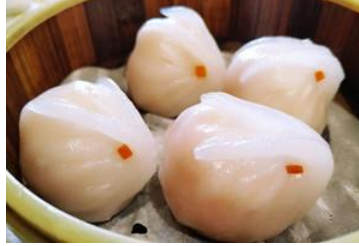
Figure 2(b). Rabbit-shaped har gow .