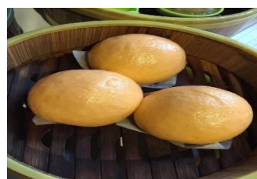
Figure 18(d). Liu sha baau .