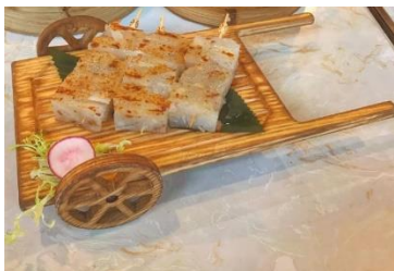
Figure 14(j). Loh baahk gou skewers.