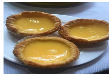
Figure 21(f). Daahn taat .