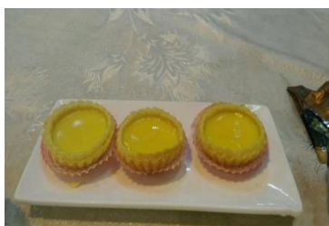
Figure 20(g). Daahn taat .