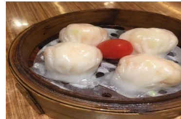
Figure 2(i). Har gow . Source: Shang Lou Cha Dian (Dian Ping-Guangzhou).