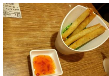
Figure 11(i). Thin cheun gyun with sweet chili sauce.