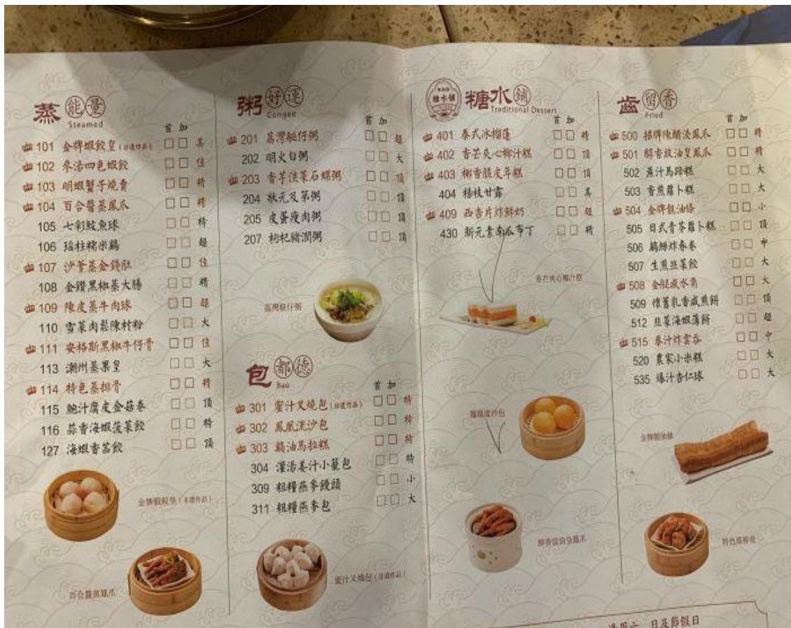
Figure 25(c). Menu of Dian Du De.