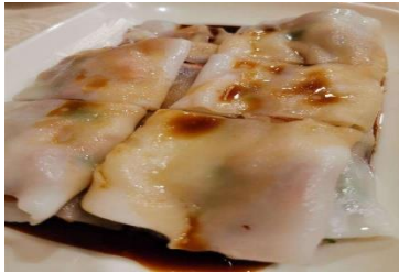
Figure 9(a). Cheung fan .