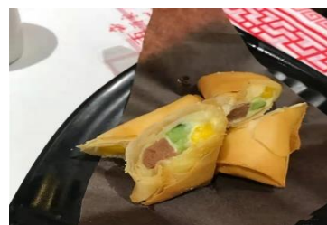
Figure 11(l). Lemongrass foie gras cheun gyun .