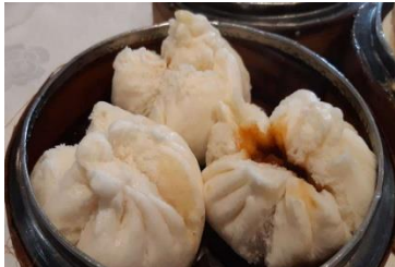
Figure 24(f). Cha siu baau .