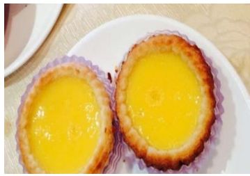
Figure 21(e). Daahn taat .