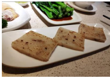
Figure 14(e). Loh baahk gou .