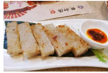
Figure 14(c). Loh baahk gou .