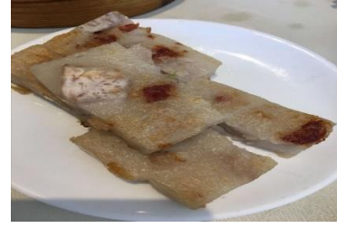
Figure 15(c). Loh baahk gou .