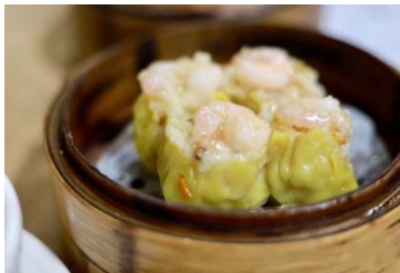
Figure 5(g). Cordyceps Militaris siu mai .