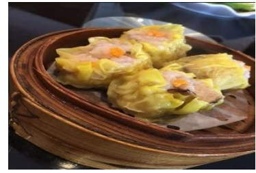
Figure 6(c). Siu mai .