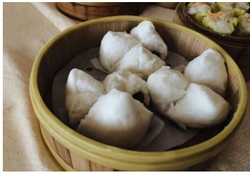
Figure 24(a). Cha siu baau .