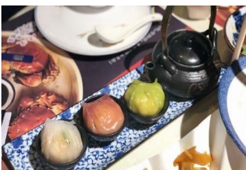
Figure 2(j). Colourful har gow soaked in stock.