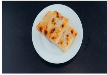
Figure 15(b). Loh baahk gou .