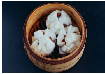
Figure 24(b). Cha siu baau .