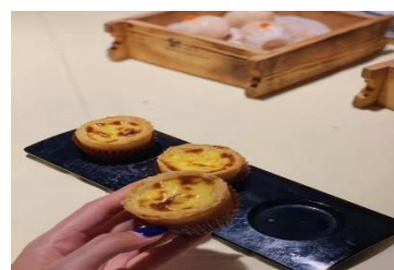
Figure 20(l). Daahn taat . Source: Chun Zai (Dian Ping-Guangzhou).