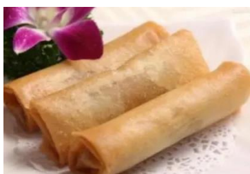
Figure 11(g). Cheun gyun .