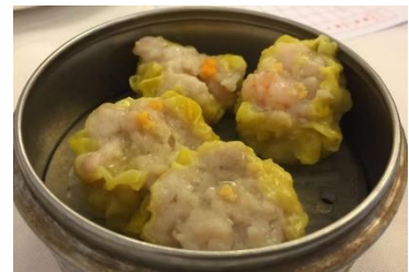
Figure 6(k). Siu mai .