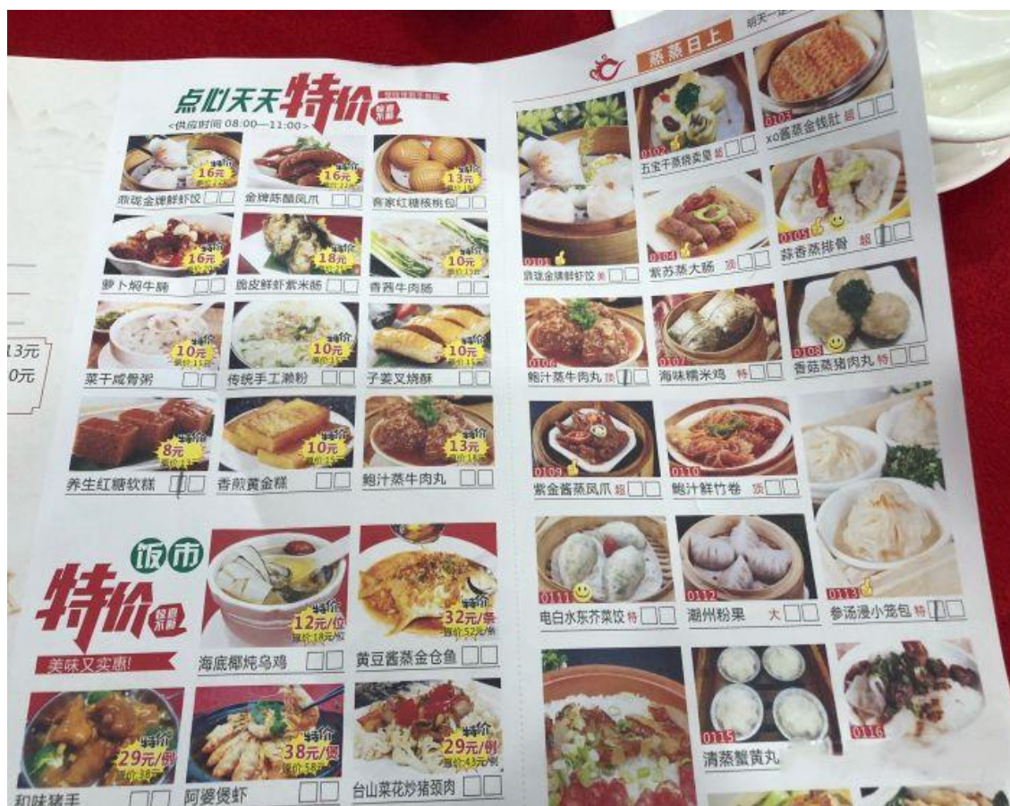
Figure 25(k). Menu of Ding Long Dian Xin Zai.