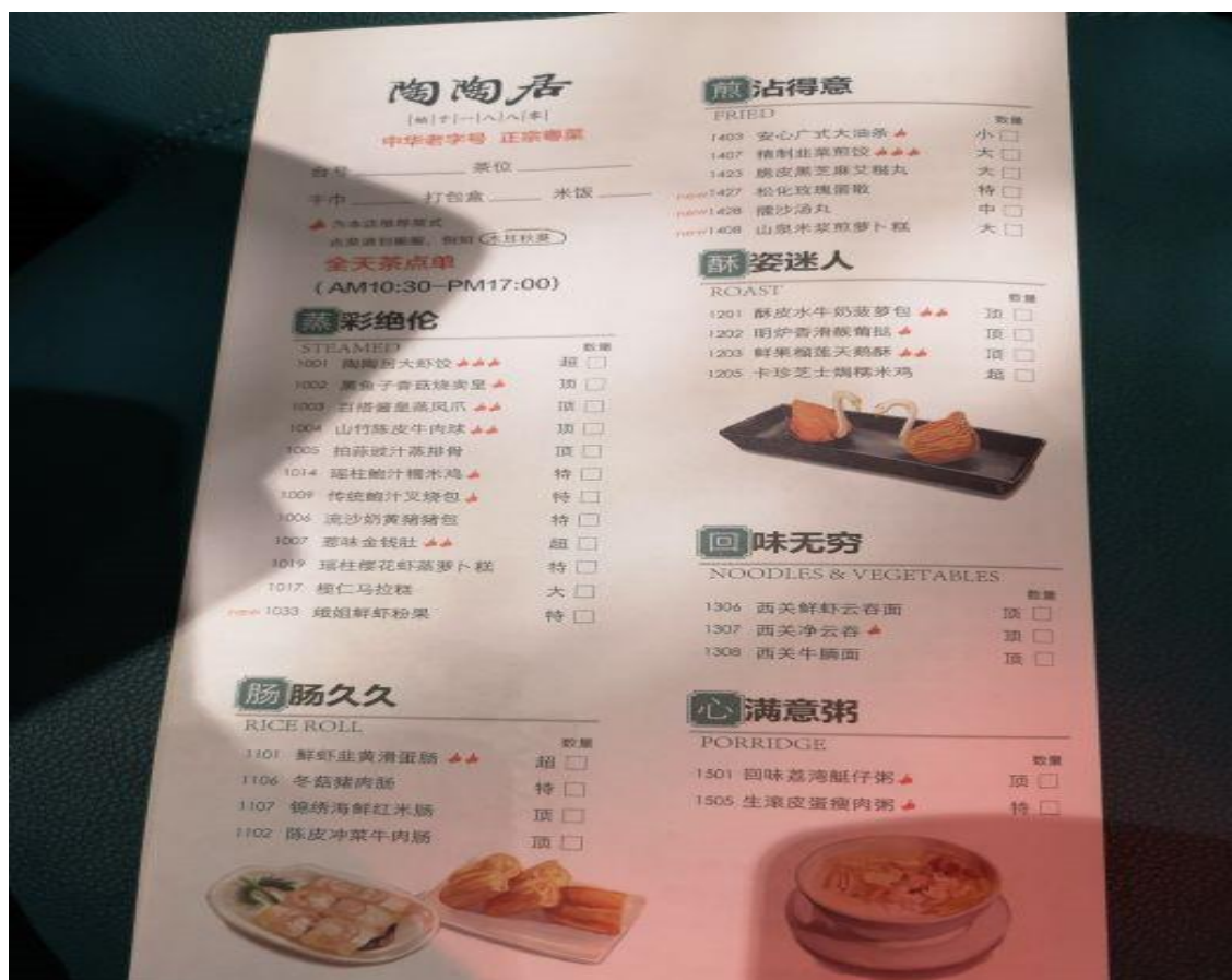
Figure 25(d). Menu of Tao Tao Ju.