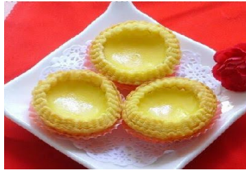
Figure 19. Traditional daahn taat .

As Guangzhou is a port city, its cuisine has been significantly influenced by other countries during cultural exchanges (Klein, 2007). Daahn taat is “a representative of Western influence” (Qu, 2016, p. 35). The invention of daahn taat is said to have been originally inspired in colonial history by the British egg tart and the Portuguese egg tart (C. Chan, 2011; Mo, 2009). Daahn taat ’s first recorded appearance was in the banquet “Manchu-Han Imperial Feast”, one of the most luxury feasts in Chinese recorded history, for Emperor Kangxi, the fourth Emperor of the Qing dynasty. In the banquet, daahn taat was featured as one of the “Thirty-two Delicacies” (C. Chan, 2011, p. 78). Traditional daahn taat (Figure 19) is baked in a round pastry mould filled with egg custard, which is a mixture of egg, milk and sugar (Qu, 2016).