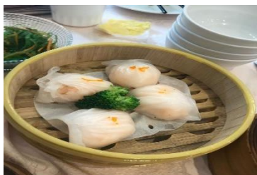
Figure 3(a). Har gow .