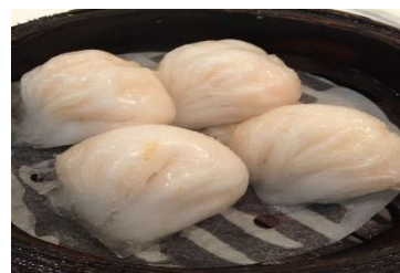
Figure 3(i). Har gow .