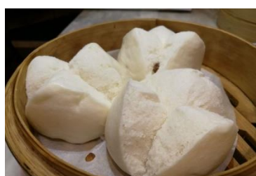
Figure 23(d). Cha siu baau .