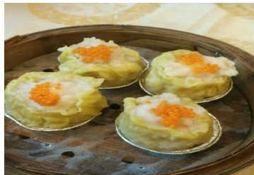
Figure 5(h). Siu mai . Source: Yin Deng Shi Fu (Dian Ping-Guangzhou).