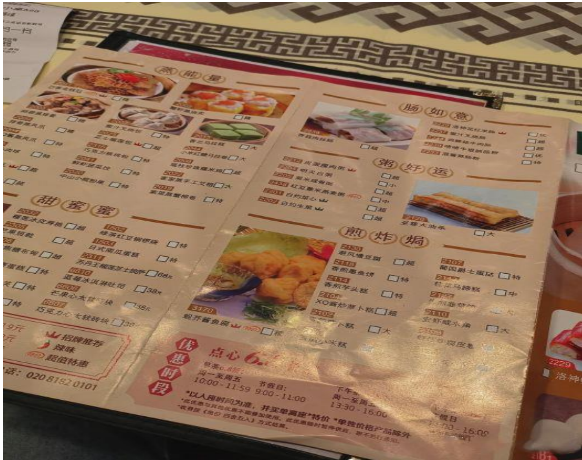
Figure 25(l). Menu of Chun Zai.