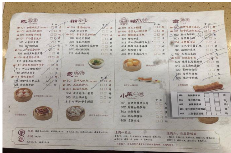
Figure 32. Dim Sum menu is also an ordering sheet.