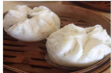
Figure 24(h). Cha siu baau .