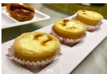
Figure 20(d). Daahn taat .