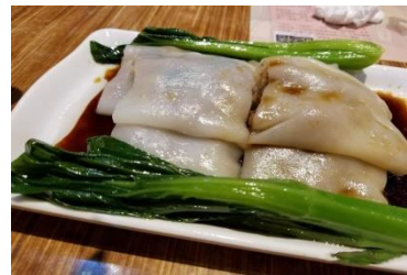
Figure 8(i). Cheung fan .