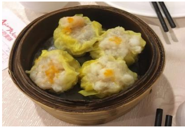
Figure 6(a). Siu mai .