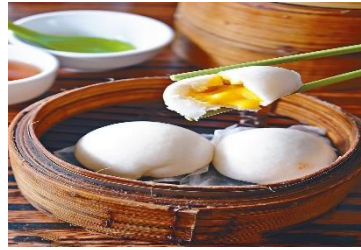
Figure 16. Traditional liu sha baau .

Steamed buns are one of the most famous wheat-based products in Chinese cuisine. Steamed buns can be either filled or unfilled. The fillings for filled buns consist of meat, vegetables, or sweet ingredients. Traditional Chinese steamed buns are usually round in shape and a white colour with a soft skin (Keeratipibu & Luangsaku, 2012). Liu sha baau or steamed egg custard bun is a unique Cantonese food which is commonly found in yum cha . Different from other sweet buns, the most distinctive feature of liu sha baau is its “semi-liquid filling made from egg yolk, pork oil and condensed milk” (Qu, 2016, p. 35). Good liu sha baau (Figure 16) should have the golden sand flowing out when tearing the bun. The taste of liu sha baau is between salty and sweet (Qu, 2016). The dough of liu sha baau is traditionally white but is often coloured with carrot juice in contemporary society to create an orange appearance.