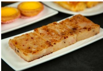
Figure 14(g). Loh baahk gou .