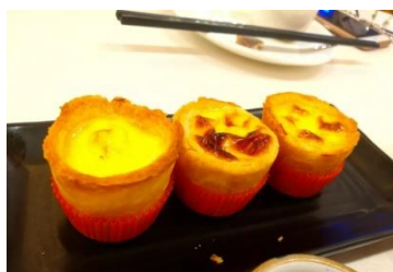
Figure 20(h). Daahn taat .