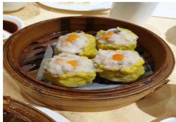
Figure 6(g). Siu mai .