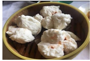
Figure 24(e). Cha siu baau .