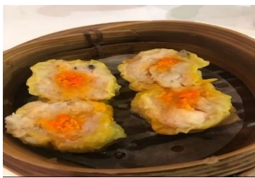
Figure 6(d). Siu mai .