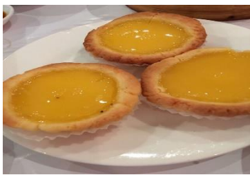
Figure 21(d). Daahn taat .