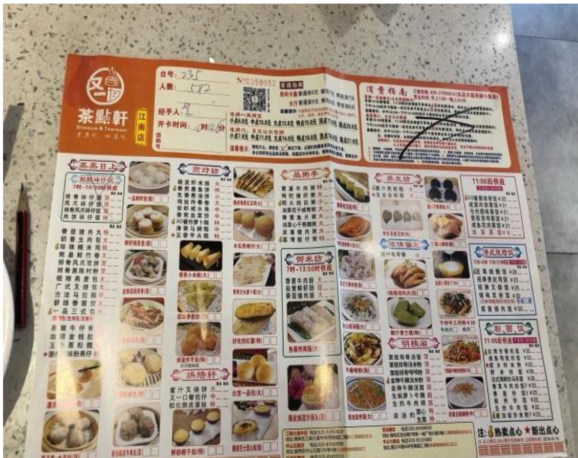
Figure 25(f). Menu of You Yi Jian Cha Dian Xuan.