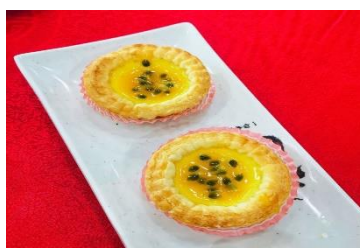
Figure 20(k). Passionfruit daahn taat .