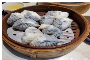
Figure 23(j). Cha siu baau coloured with brown sugar