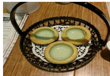
Figure 20(i). Matcha daahn taat .