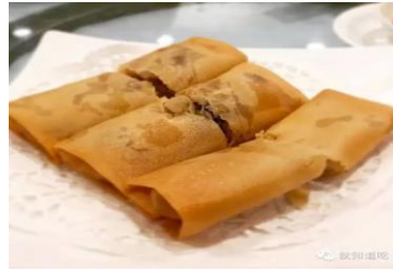
Figure 10. Traditional cheun gyun .

Cheun gyun , or spring roll, is a popular Chinese fried snack, containing a variety of vegetables and meats rolled in a thin flour sheet and then deep-fried. Cheun gyun can be both savoury and sweet (“Cantonese Spring Rolls,” 2018). Typical fillings for cheun gyun are pork, chicken, shrimp, Chinese cabbage, carrot, celery, water chestnut, and onion (Liley, 2006). Cheun gyun is popular in both Northern and Southern China. In Guangzhou, Cantonese style cheun gyun is commonly found in yum cha restaurants (Figure 10). It is usually “four inches long and one inch in diameter” (“Cantonese Spring Rolls,” 2018). Cheun gyun has a crispy exterior and soft interior due to the quick fry technique. Good cheun gyun should have a golden colour (Mo, 2009). Traditionally, cheun gyun is served as a whole or cut in half with scissors before consuming to make it easier for customers to share. This step should be done at the customer’s table, not before serving. Traditionally, Chinese people eat cheun gyun without sauce (Mo, 2009).