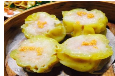
Figure 5(i). Siu mai .