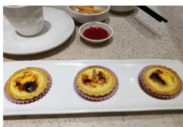
Figure 20(e). Daahn taat .