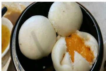
Figure 18(e). Liu sha baau .