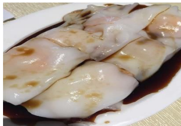
Figure 9(e). Cheung fan .