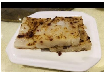
Figure 15(j). Loh baahk gou .