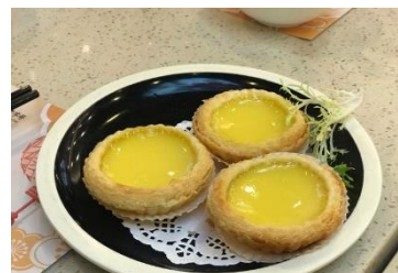
Figure 20(c). Daahn taat .