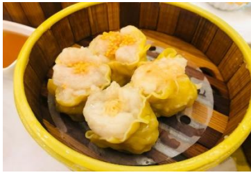
Figure 5(a). Siu mai .