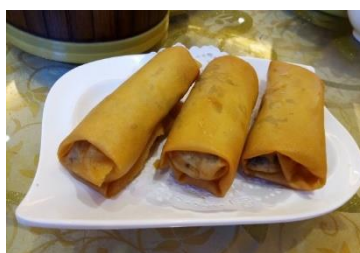
Figure 11(b). Cheun gyun .