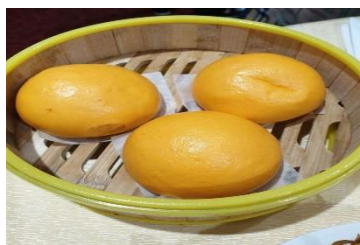
Figure 18(f). Liu sha baau .

Data not available on Zomato. HKD Chinese Seafood Restaurant.