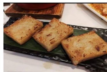
Figure 14(l). Loh baahk gou .