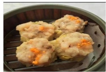
Figure 6(e). Siu mai .