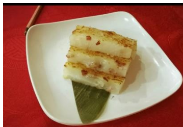
Figure 14(k). Loh baahk gou .