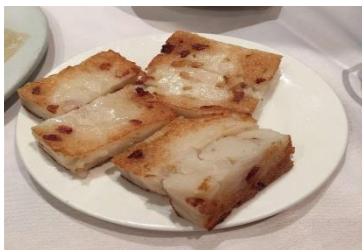
Figure 15(d). Loh baahk gou .