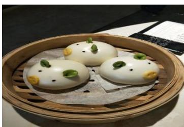
Figure 17(j). Piglet-shaped liu sha baau .