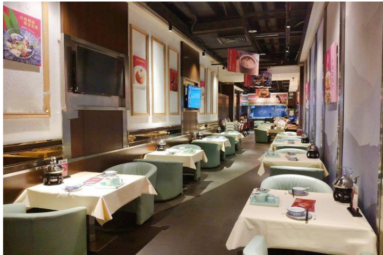
Figure 30(a). Interior Chun Zai.