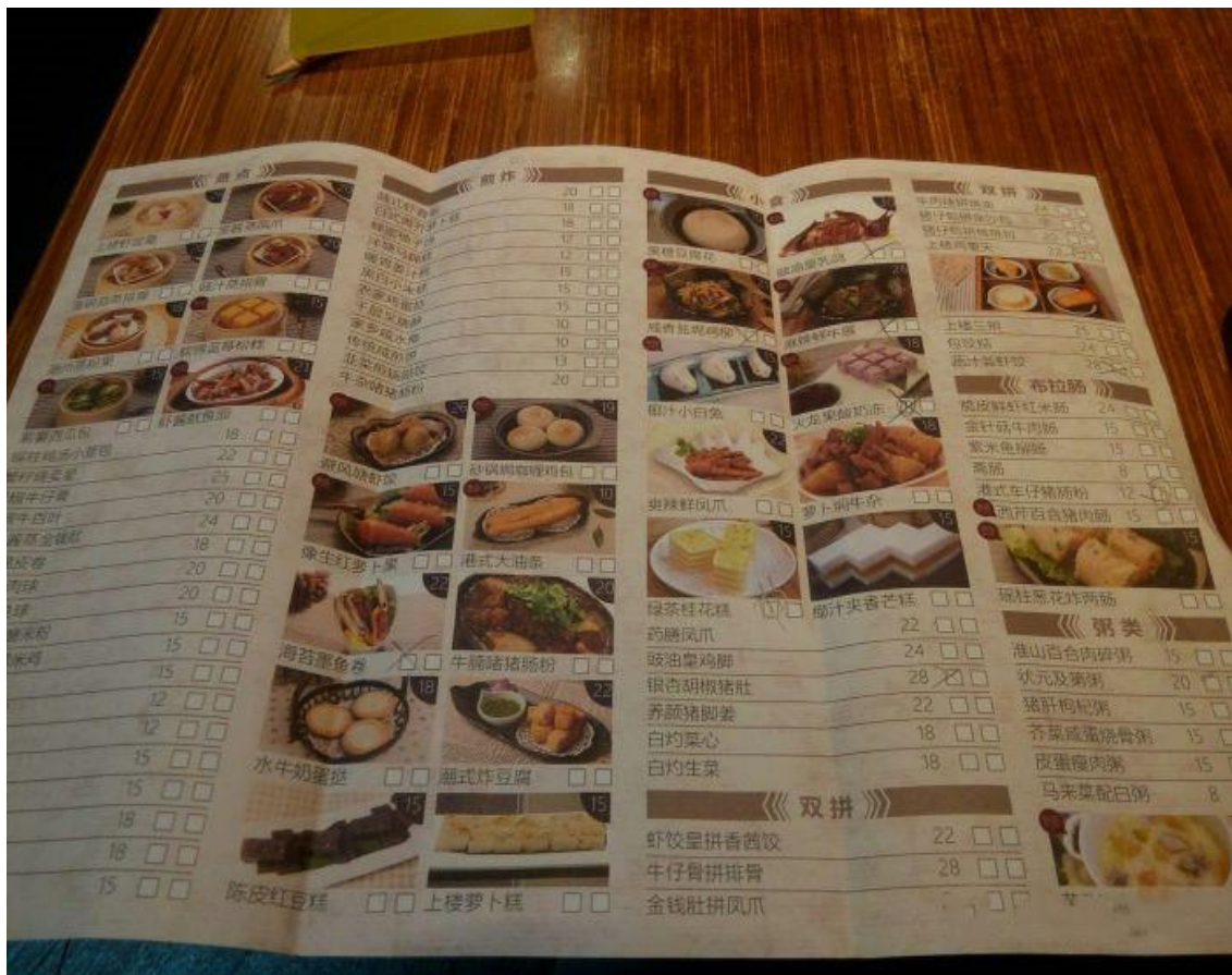
Figure 25(i). Menu of Shang Lou Cha Dian.