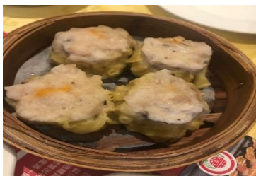
Figure 6(i). Siu mai .