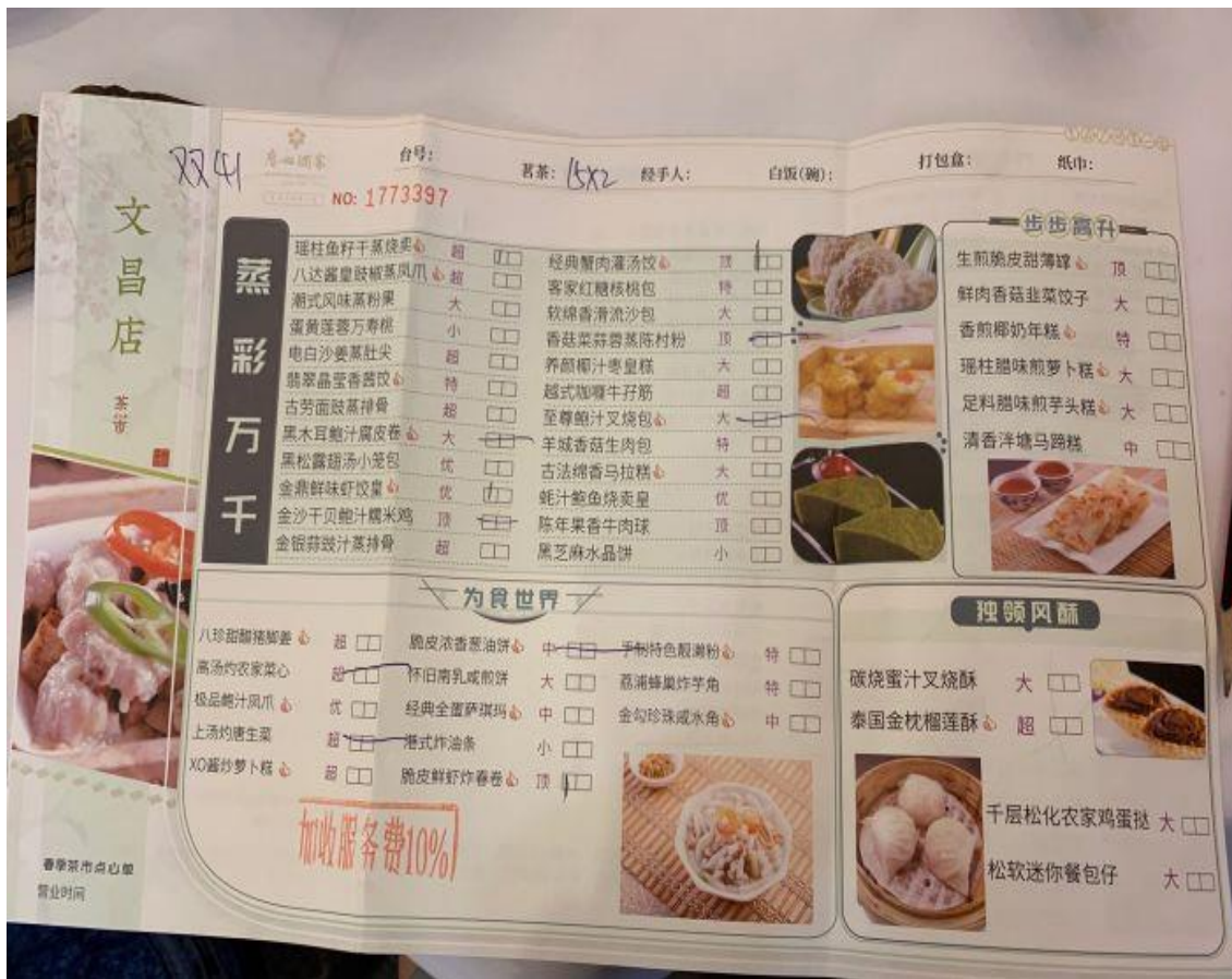
Figure 25(a). Menu of Guangzhou Restaurant.