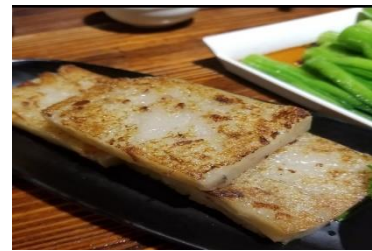
Figure 14(f). Loh baahk gou .