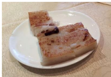
Figure 15(e). Loh baahk gou .