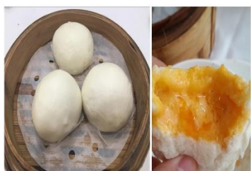
Figure 17(a). Liu sha baau .