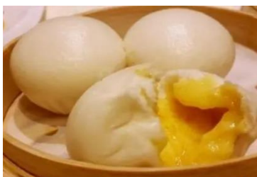
Figure 17(g). Liu sha baau .