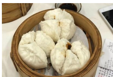
Figure 23(h). Cha siu baau .