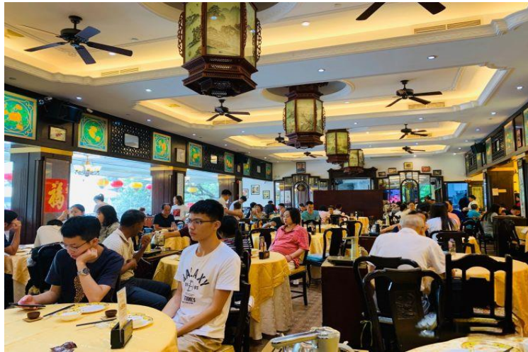
Figure 29(a). Interior of Panxi Restaurant.