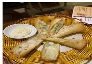
Figure 11(f). Cheun gyun with aioli sauce.