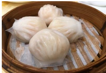
Figure 2(h). Har gow .