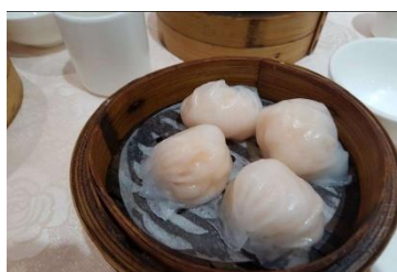
Figure 3(h). Har gow .