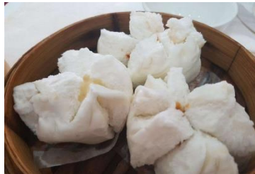
Figure 24(g). Cha siu baau .