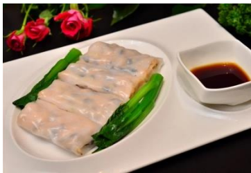
Figure 8(g). Cheung fan .