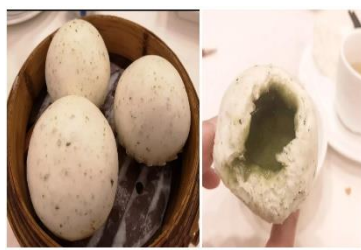
Figure 17(h). Matcha liu sha baau .