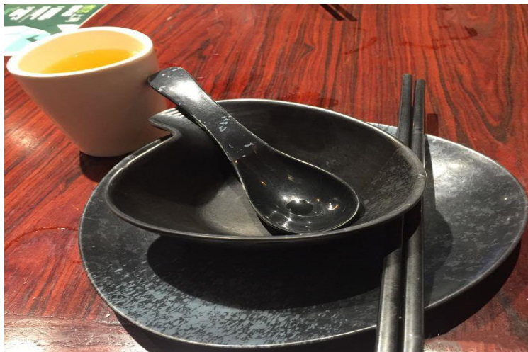
Figure 30(b). Cutlery of Chun Zai.