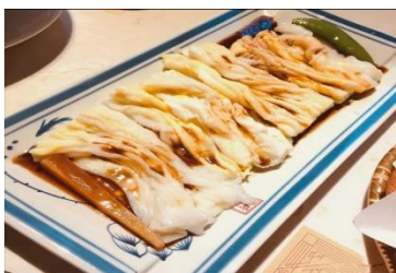
Figure 8(j). Cheung fan.

Data not available on Dian Ping. Ding Long Dian Xin Zai.