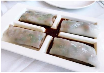
Figure 8(a). Cheung fan .