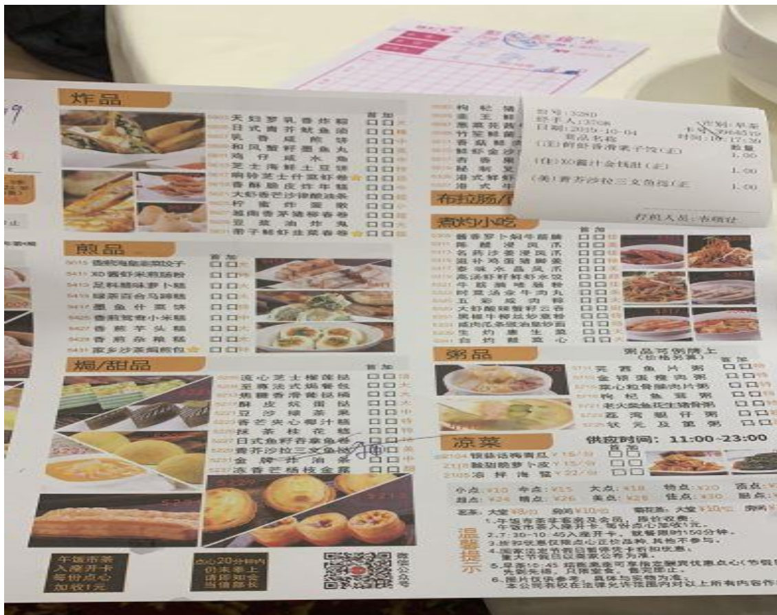
Figure 25(h). Menu of Yin Deng Shi Fu.