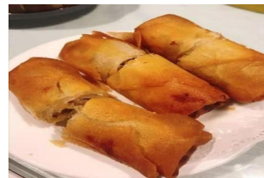
Figure 12(d). Cheun gyun .