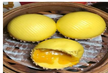
Figure 17(c). Liu sha baau coloured with pumpkin.