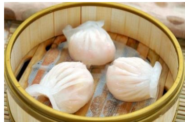
Figure 1. Traditional har gow .

Har gow is one of the most iconic Dim Dum dishes in yum cha , which is considered to be one of “big four” ( har gow , siu mai , cha siu baau , and daahn taat ) of dim sum (Mo, 2009). Har gow was invented in the 1920s in a teahouse in Wu Feng village, a suburb of Guangzhou. To adjust to the local conditions, the owner of the teahouse purchased shrimps directly from fishermen’ boats. The owner mixed the shrimps with pork fat and bamboo shoots and then wrapped them into dumpling dough, creating the steamed shrimp dumplings, which are called har gow today (Qu, 2016). Traditional har gow , as revealed in Figure 1, has a one-bite size, a half-moon shape and at least twelve pleats on the skin (Mak, Lumbers, & Eves, 2012). The wrapper of har gow is made from wheat starch so that it becomes translucent when cooked (Qu, 2016). Traditionally, har gow is served as four pieces in a hot bamboo steamer (Mo, 2009).