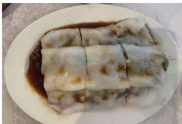
Figure 9(g). Cheung fan .