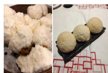
Figure 23(l). Steamed cha siu baau (left) and baked cha siu baau (right).