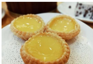
Figure 20(b). Daahn taat .