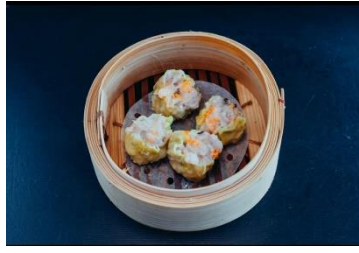
Figure 6(b). Siu mai .