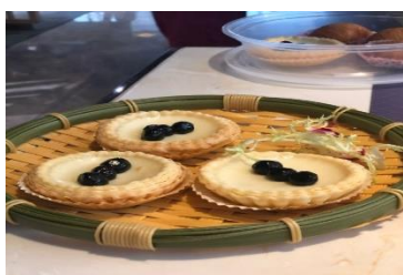
Figure 20(j). Daahn taat topped with tapioca pearls.