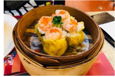
Figure 5(c). Siu mai decorated with broccoli.