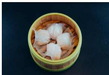
Figure 3(b). Har gow .