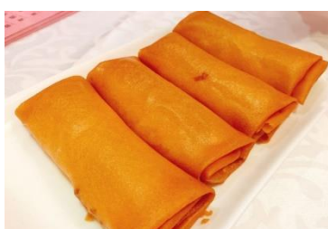
Figure 11(d). Cheun gyun .