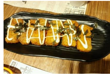
Figure 14(i). Crumbed wasabi loh baahk gou .