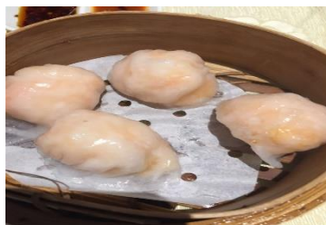
Figure 3(e). Har gow .