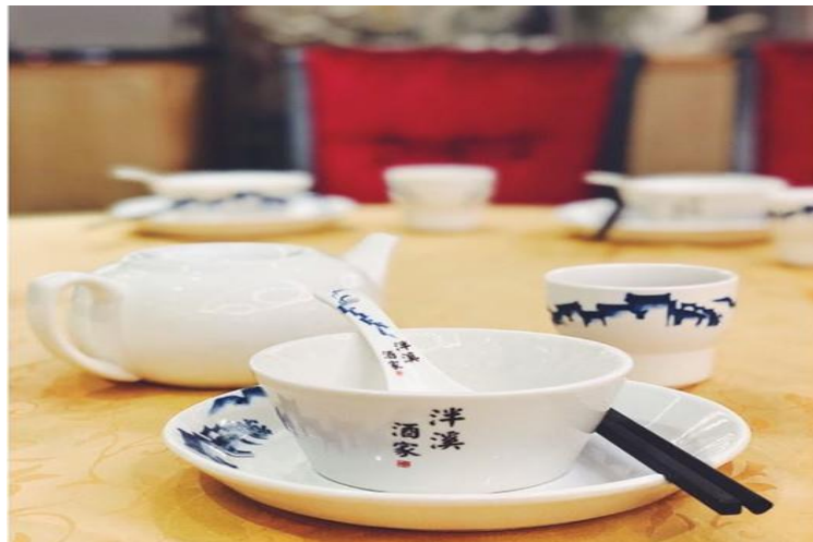
Figure 29(b). Cutlery of Panxi Restaurant.