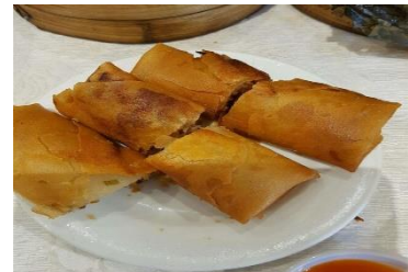
Figure 12(f). Cheun gyun .

Data not available on Zomato. Lucky Fortune Restaurant.