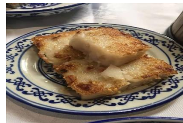
Figure 15(f). Loh baahk gou .