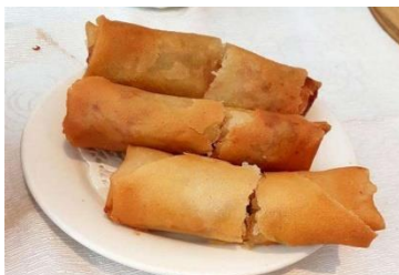
Figure 12(e). Cheun gyun .

Data not available on Zomato. Lucky Fortune Restaurant.