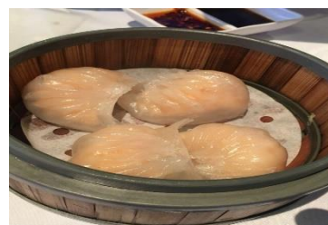
Figure 3(f). Har gow .