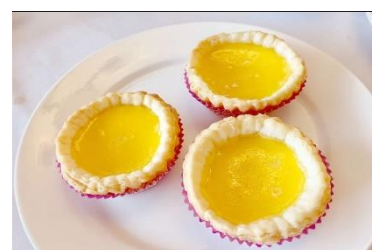
Figure 21(l). Daahn taat .