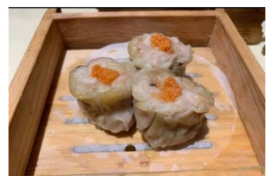
Figure 5(l). Siu mai .