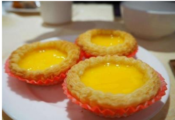
Figure 21(h). Daahn taat .