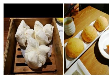
Figure 23(f). Steamed cha siu baau (left) and baked cha siu baau (right).