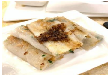
Figure 8(h). Pan-fried cheung fan .