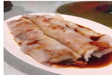
Figure 9(f). Cheung fan .