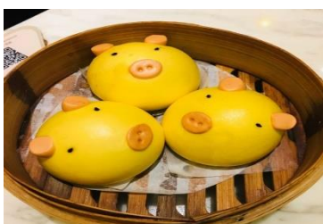
Figure 17(d). Piglet-shaped liu sha baau .