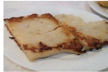
Figure 15(i). Loh baahk gou .