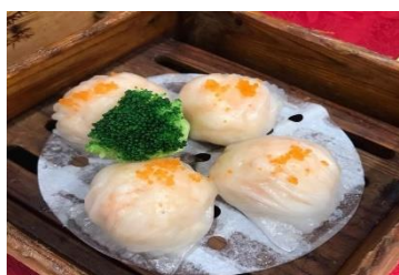
Figure 2(k). Har gow decorated with fish roe.