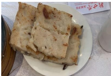
Figure 15(g). Loh baahk gou .