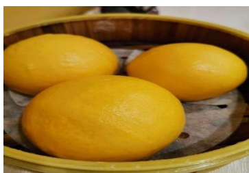
Figure 18(a). Liu sha baau .

Data not available Zomato. Canton Flavor.