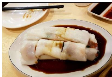
Figure 9(j). Cheung fan .

Data not available on Zomato. Hees Garden Seafood Restaurant.