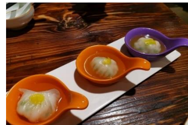
Figure 2(f). Colourful har gow soaked in stock.