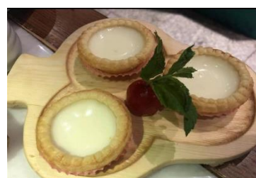
Figure 20(f). Daahn taat .