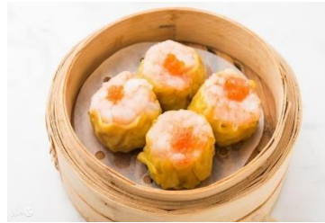
Figure 4. Traditional siu mai .

After har gow , siu mai is another classic dim sum item (Qu, 2016). The history of siu mai dates back to the Yuan Dynasty (1271-1368), originating in the North of China (Ni, 2012). Different from Northern siu mai , which has a white appearance and flower shape, traditional Cantonese siu mai (Figure 4) has a yellow colour and a cylindrical shape. The wrapper of Cantonese siu mai is made from egg dough which gives it a yellow appearance. The wrapper of Cantonese siu mai is a critical testament to the skills of the cook. If the wrapper is too thin, it will break and ruin the appearance of the dish, whereas if the wrapper is too thick, it will be tough and detract from the texture (Qu, 2016).