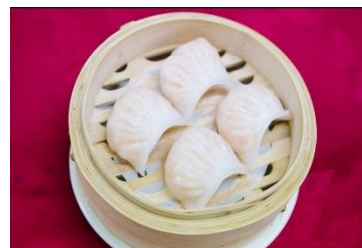
Figure 3(c). Har gow .