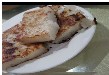
Figure 15(h). Loh baahk gou .