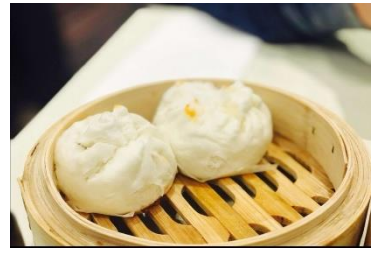
Figure 24(c). Cha siu baau .