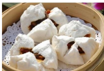
Figure 23(g). Cha siu baau .