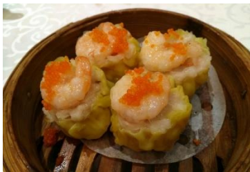
Figure 5(d). Siu mai .