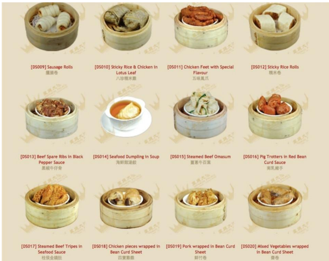
Figure 26(e). Menu of Imperial Palace.