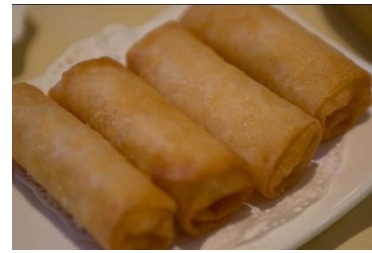
Figure 12(b). Cheun gyun .