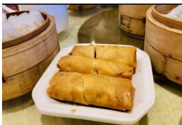
Figure 12(g). Cheun gyun .

Data not available on Zomato. Imperial Palace.