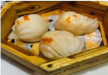
Figure 2(d). Har gow topped with fish roe.