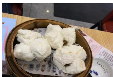
Figure 23(k). Cha siu baau .