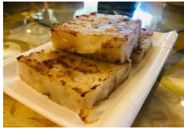
Figure 14(b). Loh baahk gou .