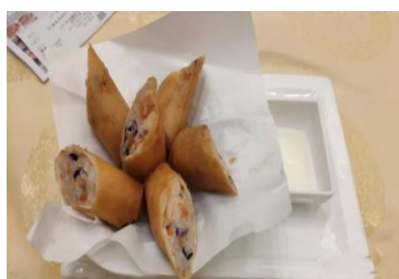
Figure 11(h). Cheun gyun with aioli sauce.