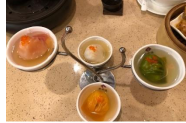
Figure 2(c). Colourful har gow soaked in stock.