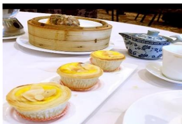
Figure 20(a). Daahn taat topped with roasted sliced almonds.