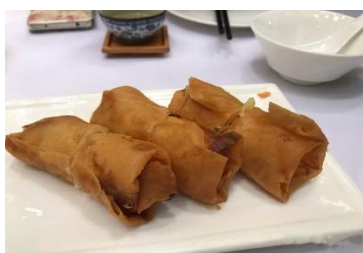
Figure 11(a). Cheun gyun .