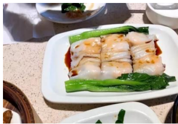
Figure 8(e). Cheung fan .