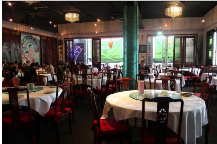
Figure 27. Interior of Pearl Garden.