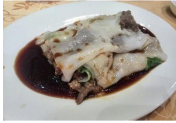
Figure 8(b). Cheung fan .