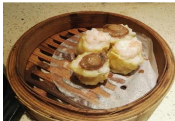
Figure 5(e). Mixed siu mai topped with abalone and prawn.