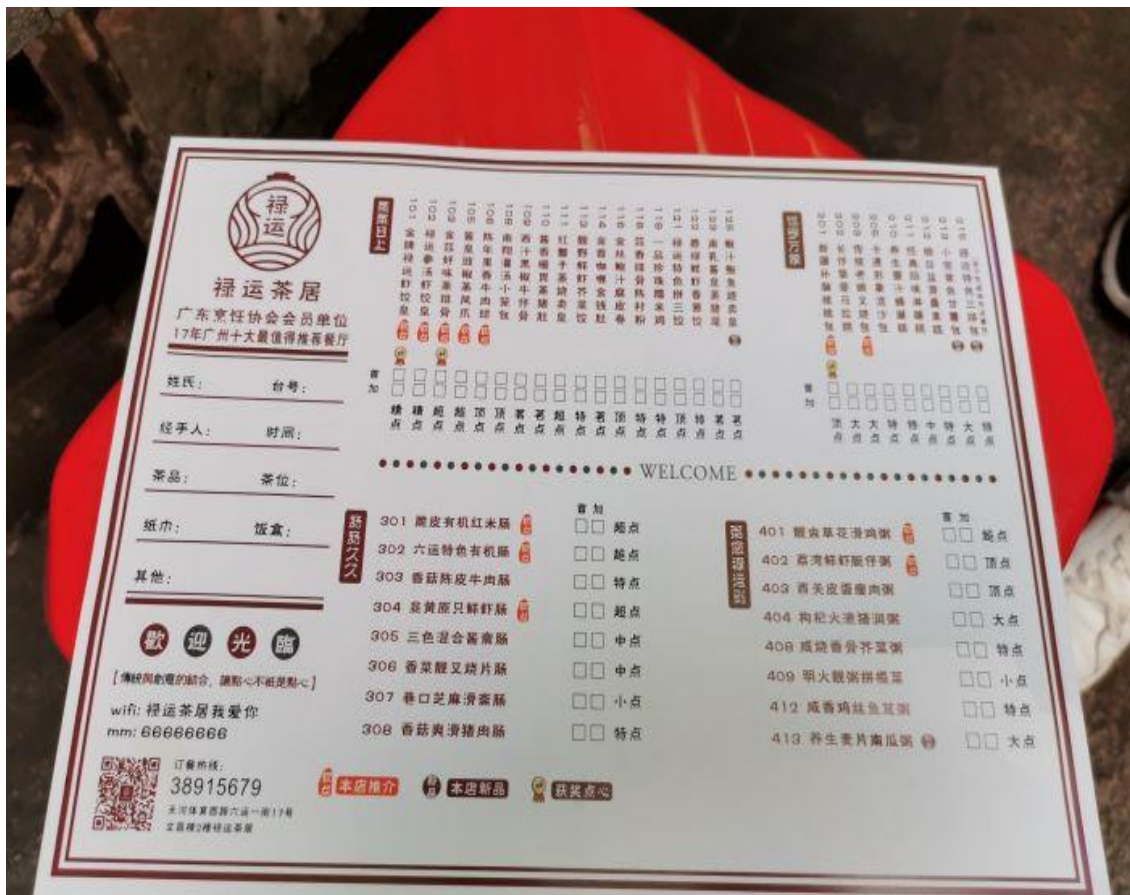
Figure 25(g). Menu of Lu Yun Cha Ju.