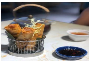
Figure 11(j). Cheun gyun served in a steel basket.