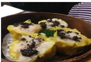
Figure 5(j). Black truffle siu mai .