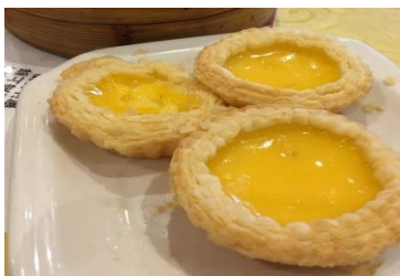
Figure 21(j). Daahn taat .