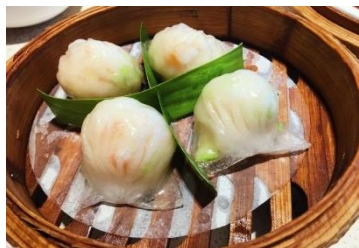
Figure 2(e). Har gow .