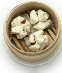
Figure 22. Traditional cha siu baau .

Cha siu baau is one of the most representative buns in dim sum . The filling of cha siu baau is made from small pieces of barbecued pork with a specific ratio of lean meat and fat, and is flavoured with oyster sauce and seasonings. The fluffy bun is made from leavened dough (Qu, 2016). The most significant difference between cha siu baau and other buns is that cha siu baau should be cracked open on top once cooked. A good cha siu baau should be snow white and evenly cracked into three segments to expose the filling (as shown in Figure 22).