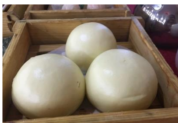
Figure 17(k). Liu sha baau .

Data not available on Dian Ping. Chun Zai.