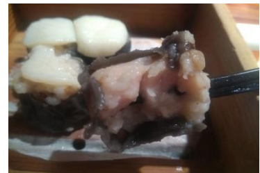
Figure 5(f). Siu mai wrapped in a cuttlefish juice coloured wrapper and topped with scallop.