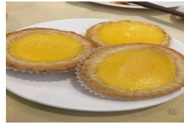
Figure 21(c). Daahn taat .