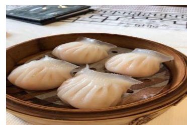
Figure 2(l). Har gow .