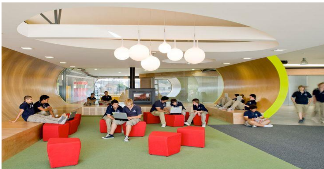
Fig 6. Photograph of a modern learning environment. 7

The images shown in Figures 5 – 8 are examples of four new learning environments. They have similar spatial stratifications but support very different kinds of programmes. There is an ambiguity about all of these spaces, and even though they are designed as school spaces, their very different programmatic engagements could suggest office space, retail space, airport space, or hospital space. They occupy a very similar kind of spatial sequencing that is, each is an open, flexible, changeable type of space.