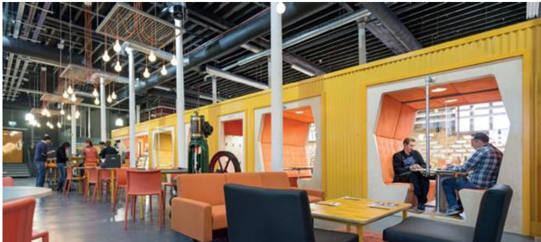
Fig 5: Often architects borrow ideas from commercial projects. This is a modern commercial space that reflects a blend of warehouse/café style. 6

The images shown in Figures 5 – 8 are examples of four new learning environments. They have similar spatial stratifications but support very different kinds of programmes. There is an ambiguity about all of these spaces, and even though they are designed as school spaces, their very different programmatic engagements could suggest office space, retail space, airport space, or hospital space. They occupy a very similar kind of spatial sequencing that is, each is an open, flexible, changeable type of space.