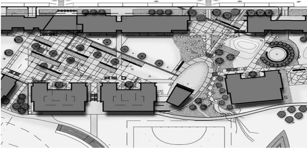
Fig 3. Photograph of the spatial configuration of a Whānau School Site plan. 4