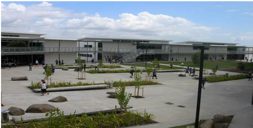
Fig 4. Photograph of Whānau built environment with distinctive separate homebase structures. 5