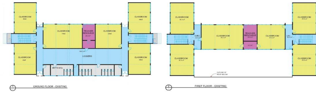
Fig 2a & 2b. Photograph of a floor plan for Nelson Block Learning environment. 2

In 1980, two new common design plans were introduced: the Whānau plan 3 used at Macleans College, and the Leeston plan used at Ellesmere College. Simultaneously, however, student numbers plateaued and secondary school construction dwindled, resulting in common design plans being dropped in 1982 in favour of schools being individually designed. By 1980, there were 265 secondary schools and 35 district high schools, with technical high schools having been completely phased out. In 1989, the school leaving age was raised to the present age of 16. In 1989, the Tomorrow's Schools reform enabled individual school communities through their elected Boards of Trustees to make decisions about managing the learning programmes and school environment. These moves require parent communities to remain abreast of educational theories underpinning new policy decisions associated with educational changes, with obvious implications for the implementation of the Ministry of Education property strategy (Swarbrick, 2012).