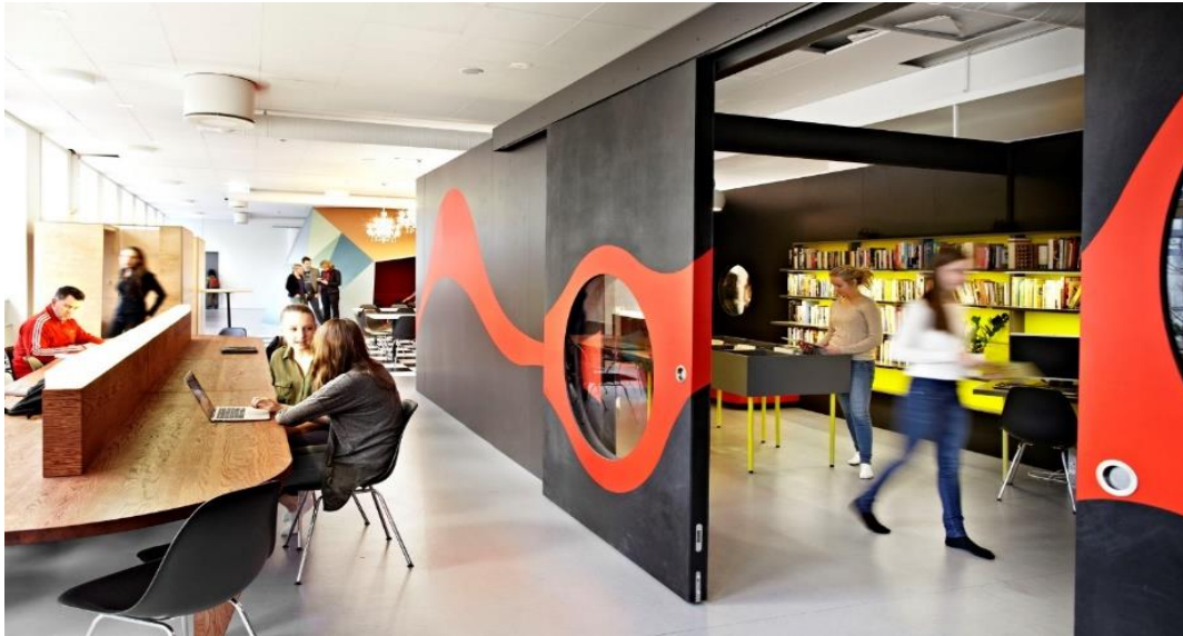
Fig 8: A space that does not look dissimilar to retail space. 9