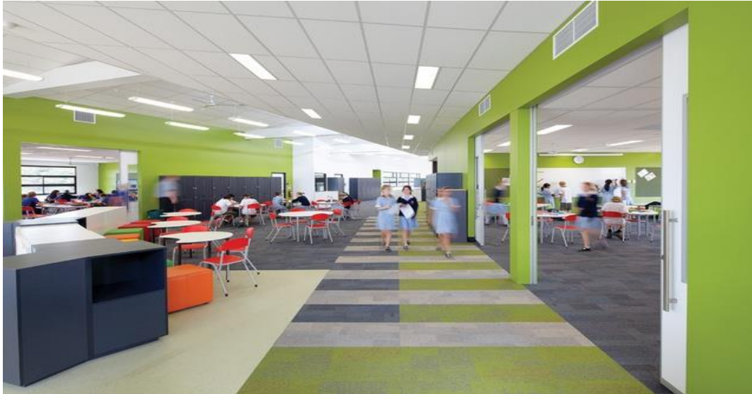
Fig 7. Photograph of a modern learning environment. 8

challenge to existing instructional methodologies. ILEs commissioned and designed by different architectural designers in New Zealand all have narratives about practice that inform design process. These narratives are open to considerations of how spatial practice is itself understood, as well as the very notion of practice as spatial production.