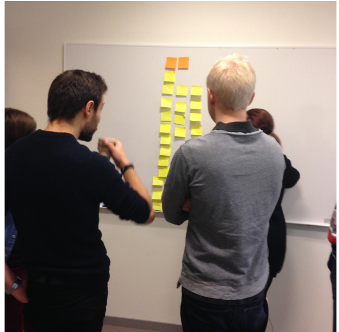
FIGURE II THE STUDENT GROUP DOING AFFINITY DIAGRAMS

not been properly integrated nor designed to work in unison, leading to a significant reduction in efficiency. The university employees did not want to have to log in and out of different systems, as happens at the moment. This need is echoed by the student group who stressed the importance of a single login process.