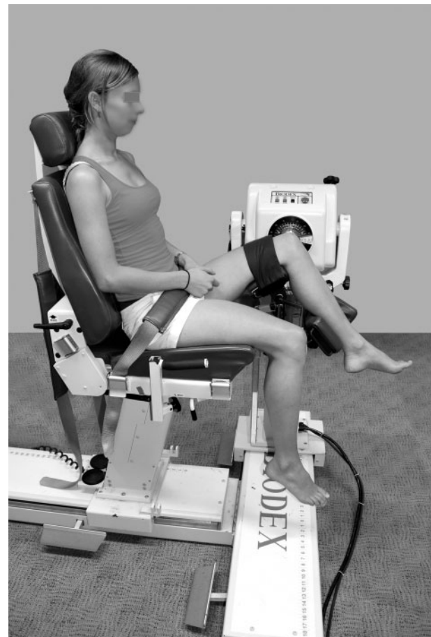
Figure 2 Upright-sitting position. Photograph reprinted with permission.

differed (Fig. 2) as all participants relaxed into the back-rest of the Biodex.