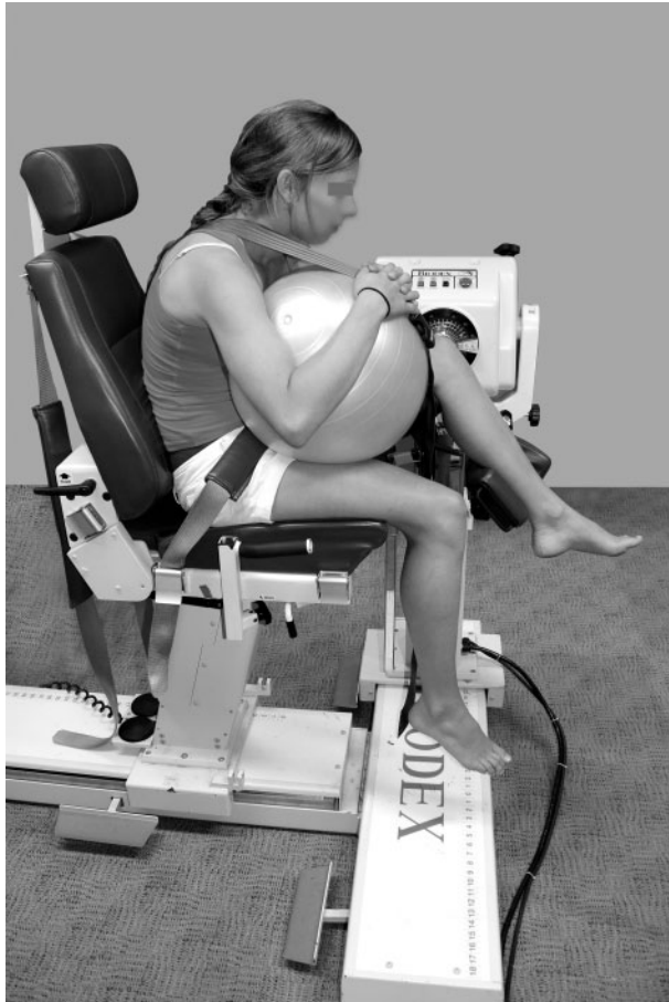
Figure 1 Slump-sitting position. Photograph reprinted with permission.