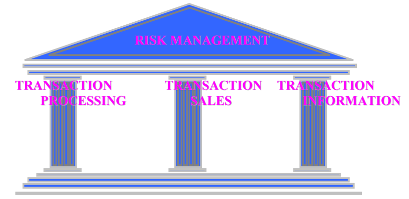
Figure1: Electronic Transactions 'Temple'

The first transaction pillar covers transaction processing. Transaction processing includes: taxation implications of eBusiness, payment types, foreign exchange issues associated with the various types of transactions and an understanding of the electronic clearing and electronic banking system.