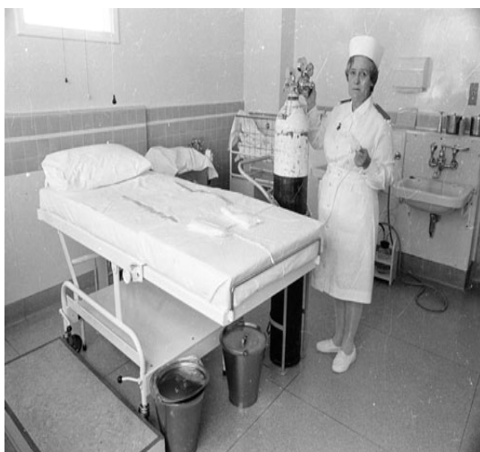
Figure 7: The theatre at the Paraparaumu Maternity Home 1971. 10

maternity legislation over the last century yet NZ midwifery education has progressively moved away from the defined community focus. (Guilliland & Pairman, 2010b; A. A. Hill, 1982; Papps & Olssen, 1997). The history of New Zealand midwifery education from the 1980s focussed more on research based knowledge replacing storytelling and learning through empirical experiences (Gilkison, 2011). Midwifery found itself attuning to the prevailing mood of the times.