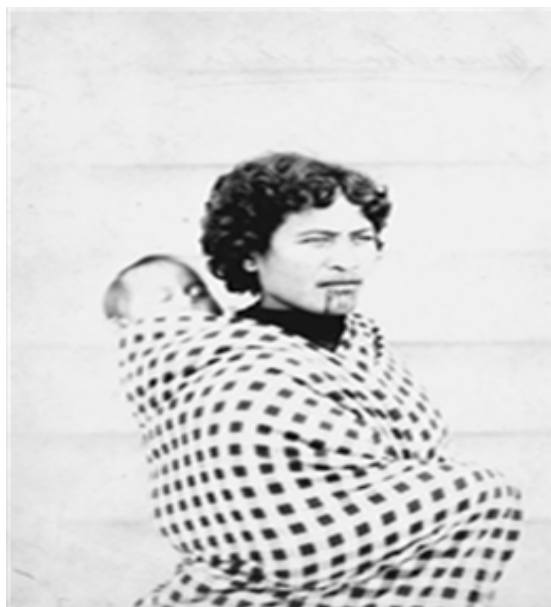
Figure 2: Unidentified Māori woman carrying an infant on her back 19 th Century 4 .