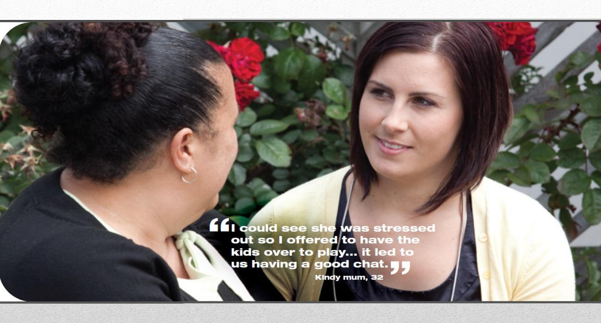
Pp.12-13 Children's booklet, 2010