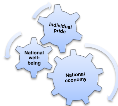
Diagram 2: Economic gears

Brisbane and the America's Cup in 1986/1987 in Freemantle, Western Australia had about 700,000 attendees. This is a large number of sport tourists which