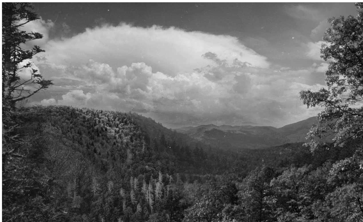
THE VIEW OF MOUNT GUYOT FROM CLINGMANS DOME

From the summit of Clingmans Dome, the clear conditions of my second ascent revealed a far-away snow peak to the east. Tahquette's men spoke of the mountain, which I later recognised as Mount Guyot, with a vaguely spiritual distaste.