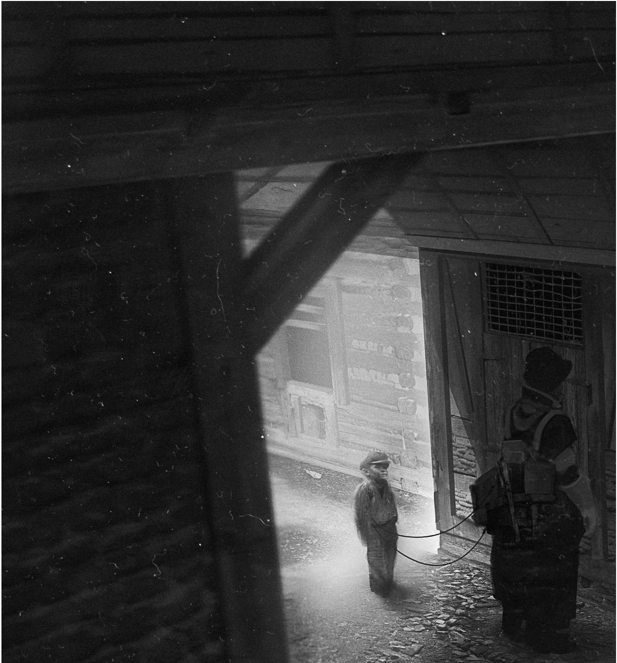
THE CHILD IS WIRED TO HIS KEEPER