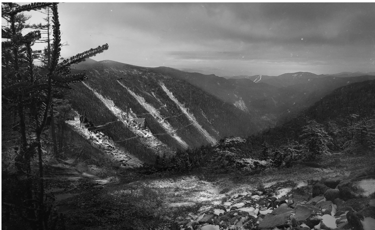
THE LIGHT OF MORNING SHONE TO EXPOSE THE DISQUIETING SETTLEMENT OF ELKWOOD