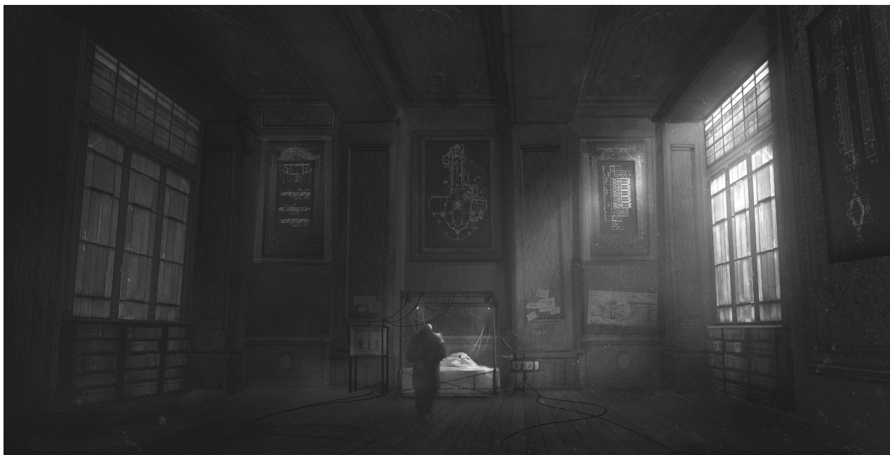
THE LEADER OF ELKWOOD LIES, SICK, IN BED

of the black bear (which for Abraham, I suspect, was the true purpose of the meeting), the man cut him short.