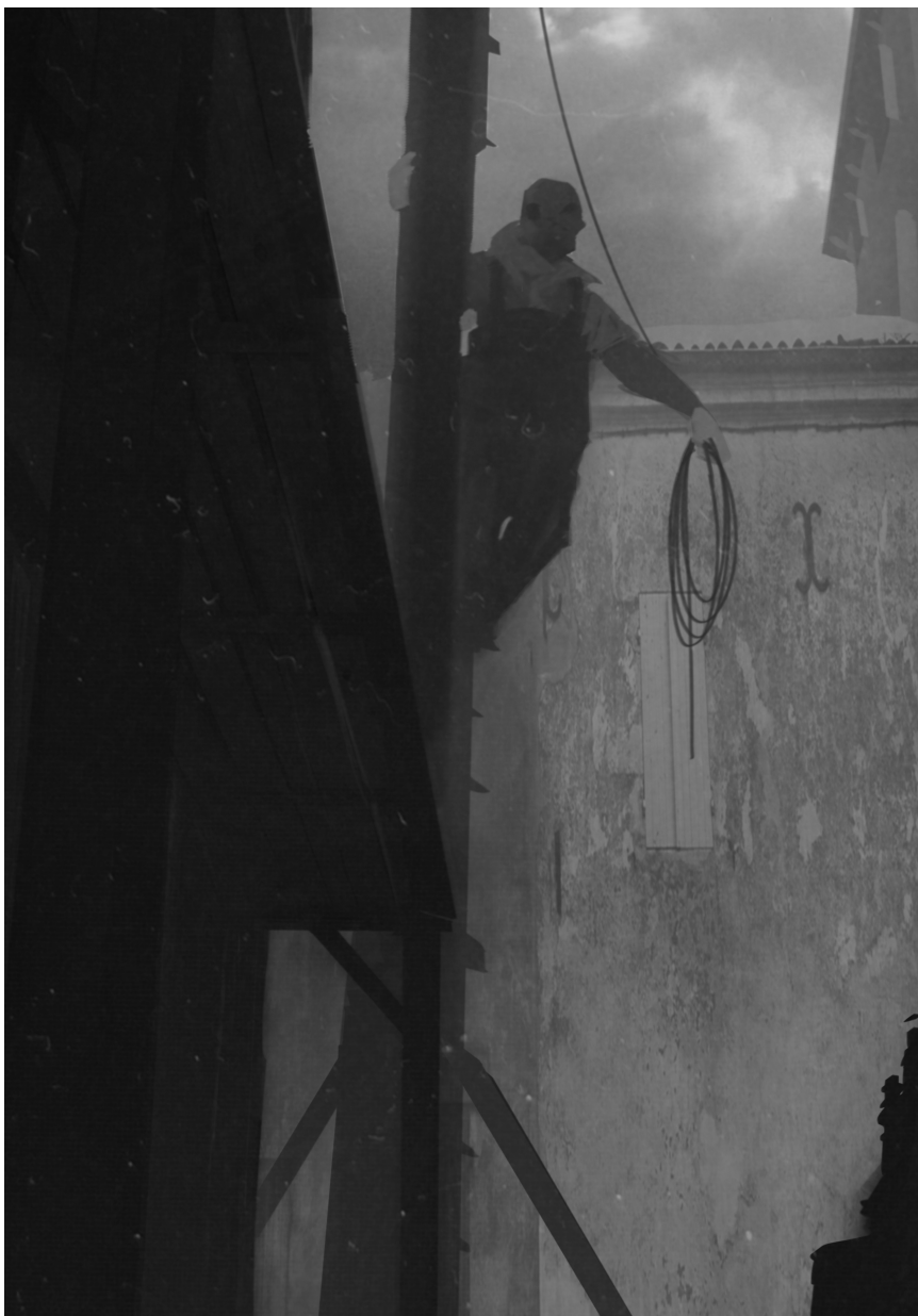
A DUTIFUL WORKER CLIMBS ATOP A GRIM STRUCTURE

There were 24 large buildings rooted in the hillside above the butchery. These, Abraham explained, contained research facilities and served as homes for the settlement's upper class families. These families were the direct descendants of Turner and Pritchett. Dozens of smaller structures housed the settlement's lesser denizens: labourers, tailors, water-carriers and butchers. With their heavily boarded walls, supported with Bostonian brickwork, the houses appeared strikingly permanent.