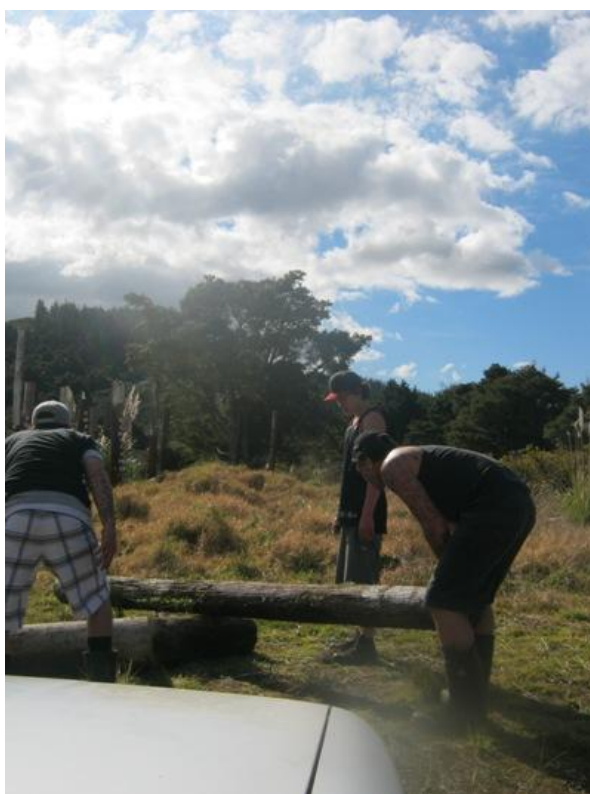
Figure 37: Maxwell H. (2011). Installing Poles.

Poles painted with white undercoat and numbered for placement on grid. Circumference of poles between 58.42cm and 96.52cm and length starting from 213.36cm.