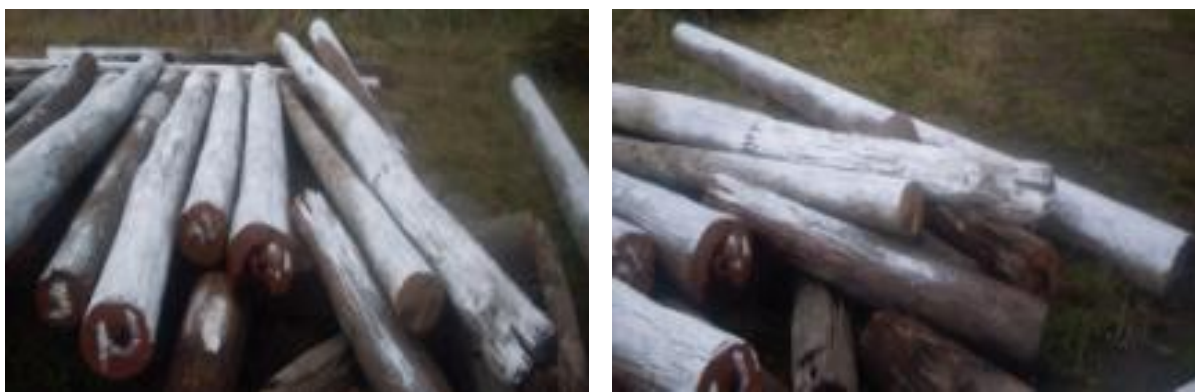
Figure 36: Maxwell H. (2011) Poles painted white, numbered to grid pattern and stacked.

Poles painted with white undercoat and numbered for placement on grid. Circumference of poles between 58.42cm and 96.52cm and length starting from 213.36cm.