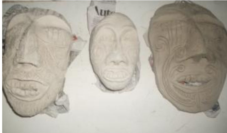
Figure 7: Maxwell. H. (2010) three mokomokai – inspired artefacts with markings.

Left to right: [1] 12.7cm x 21.59cm, [2] 10.6cm x 12.7cm, [3] 15.24 x 20.32cm. Damp clay moulds in various stages during drying process. Newspaper used to absorb excess moisture due to the thickness of the clay.