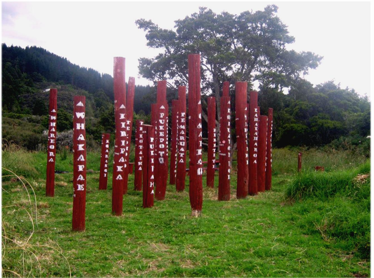
Figure 46: Nathan R. (2011) Completed Pou at Te Maruata