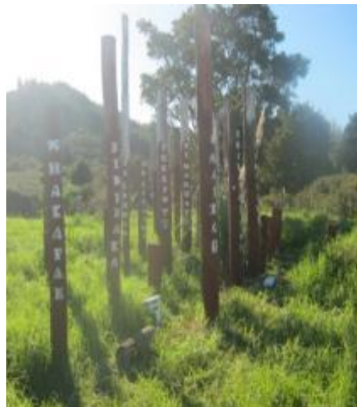
Figure 38: Maxwell H. (2011) Pouwhenua Installation.