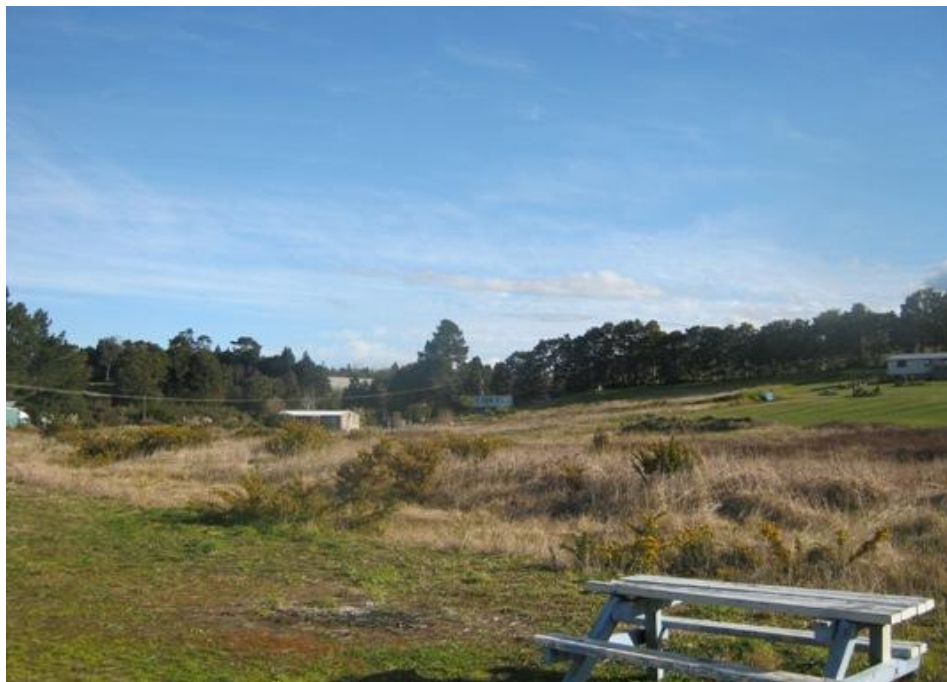
Figure 2: Maxwell. H. (2011) Te Maruata Marae site and turangawaewae

Ngati Hau ki Whangarei extends from the southern side of the Ngunguru River through to Ruapekapeka and includes Otonga and Opuawhanga on the east. The outer lying boundaries to the west are Ruatangata and Pipiwai. The Whangarei Falls (Otuihau) in the Pehiaweri Block and the Whareora Block are nearest to the city. The collective hapu uphold and maintain Ngapuhi customs and practices, traditions and rituals, whakapapa and histories.