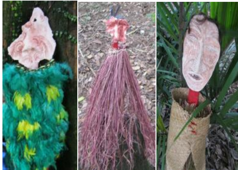
Figure 22: Maxwell H. (2011). Three effigies using mixed media.

Left to right [1] korowai made with green and yellow feathers [2] Stripped red dyed stripped flax, three blue feathers in hair [3] plain kahu paa with human hair. Displayed and photographed in small bush on property of Murray Gibb on Te Maruata land block.