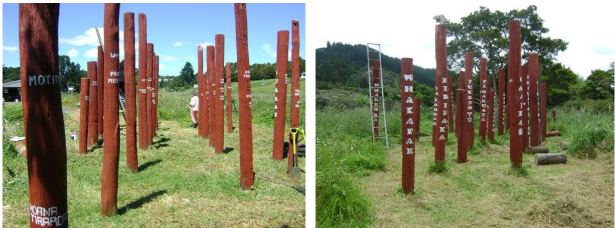
Figure 44: Maxwell H. (2011). Grid pattern of pouwhenua installation.

Names of Ngati Hau whenua facing outward toward the entrance to capture immediate attention.