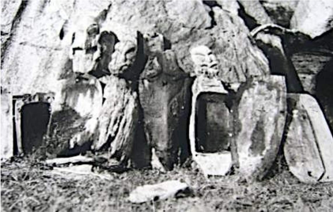
Figure 26: Black and White photograph 33 Alexander Turnbull Library National Library of New Zealand Ref: G. 18224 1/4 (nd).

The waka tupapaku-inspired artefacts standing upright outside a cave at Waiomio, Bay of Islands were removed and taken to the Auckland Museum. The burials are recorded as being those of Ngati Hau. The photograph is the visual inspiration for this study.