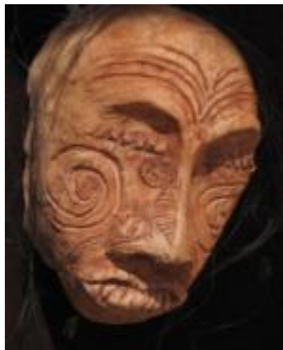
Figure 9: Maxwell H. (2010) Mokomokai-inspired artefact. 10.6cm x 12.7cm.

At different intervals of the drying process when each mokomokai-inspired artefact was still slightly damp, they were individually marked with moko patterns that were generic and specific to Ngapuhi. Newspaper was also used to absorb excess moisture in the clay. The intentional roughness of this work alludes to the comments of the 1800's that such displays of mokomokai were "hideous and monstrous spectacles".