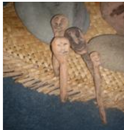
Figure 32: Maxwell H. (2011). Tiki Wananga-inspired artefacts.

Bisque fired tiki wananga-inspired artefacts of varying lengths and sizes. Stained with black oxide. Set up on whariki with totara bark and stones in background.