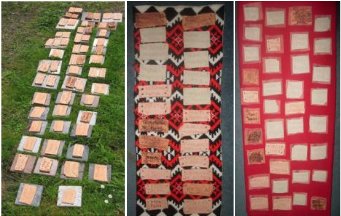
Figure 25: Maxwell H. (2011) three runners of memorial tiles in mixed media.

from 1865 to my mother's generation and transformation of lifestyles, environment and traditional knowledge. Placed on the faded red blanket scraps are memories of Ngati Hau land sales.