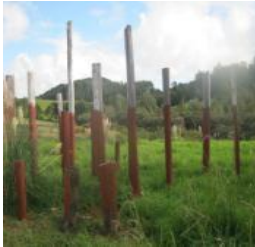
Figure 38: Maxwell H. (2011) Pouwhenua Installation