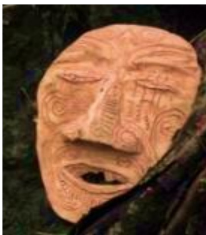
Figure 10: Maxwell. H (2010) Mokomokai inspired artefact. 15.24cm x 20.32 Bisque fired, covered with kokowai and displayed on Puketotara Land Block.