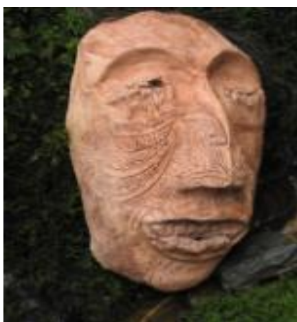
Figure 11: Maxwell. H (2010). Mokomokai-inspired artefact. 15.24cm x 20.32cm. Bisque fired, covered with kokowai and displayed with fly on eyelid on Whareora Land Block