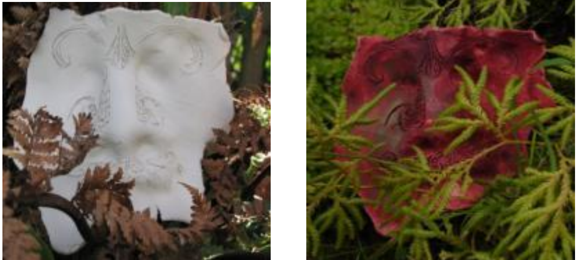
Figure 14: Maxwell. H (2011). Mokomokai-inspired artefacts. 15.24cm x 15.24cm.

effects of the influenza epidemics. The final image [Figure 13] was deliberately pulled apart and flattened like a clay ‘whariki’, to hold and carry hapu spiritual losses.