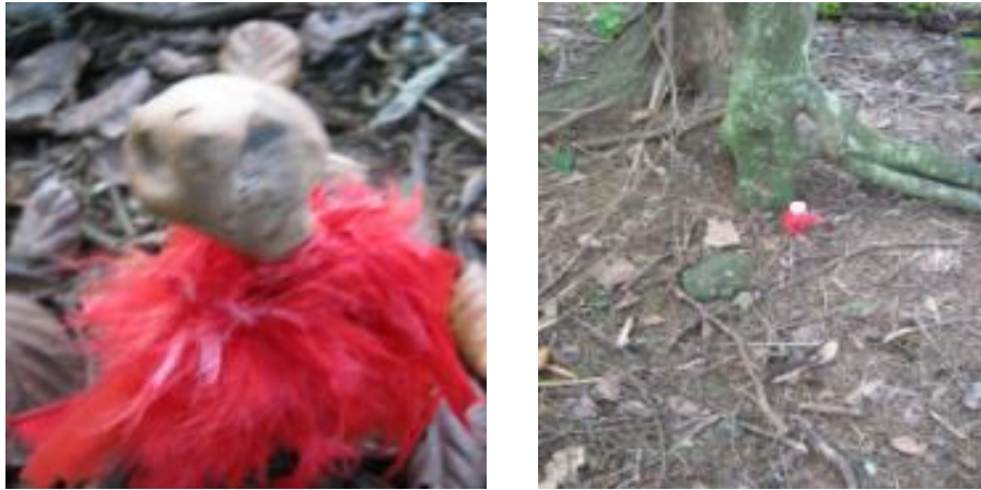
Figure 33: Maxwell H. (2011) Series of Tiki Wananga-inspired artefact dug into the ground.

Bisque fired tiki wananga-inspired artefact dressed with red feathers and placed strategically on the land as boundary pegs.