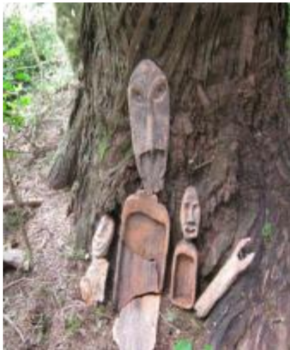
Figure 28: Maxwell H. (2011). Waka Tupapaku-inspired artefacts at base of totara tree.

Fragments of waka tupapaku-inspired artefacts