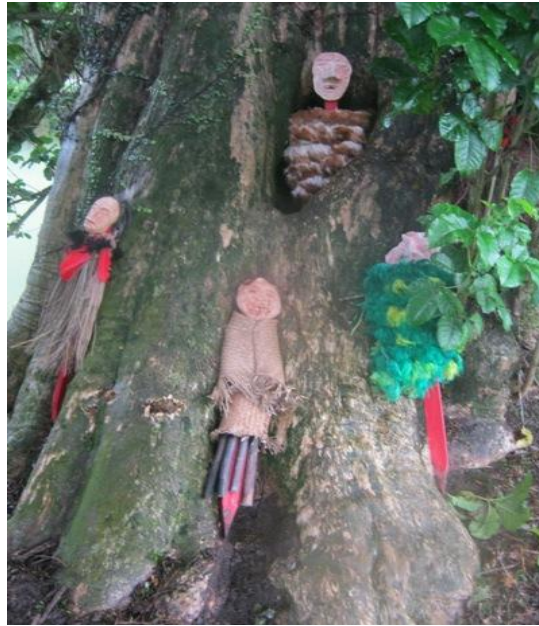
Figure 20: Maxwell H. (2011) Group of effigy nestled in puriri tree on the Whakapae land block.

Dressed effigies made up with painted red stakes 71.12cm x 3.81cm. Top to bottom [1] Korowai made with brown and white feathers, [2] Plain coloured taura covering with red and black feather border [3] kahu paake including flax stalks [4] korowai of green and yellow feathers, [5] hidden effigy with red and black feather border. Puriri leaves are used traditionally in Taitokerau as taua (mourning wreaths) worn by hunga kainga (home people and relatives) and manuhiri (travelling mourners). Puriri leaves placed around photographs of tupuna, during a tangi are considered a tohu (sign) that indicates the rate of decomposition of tupapaku (deceased). These customary practices are not widely understood or known.