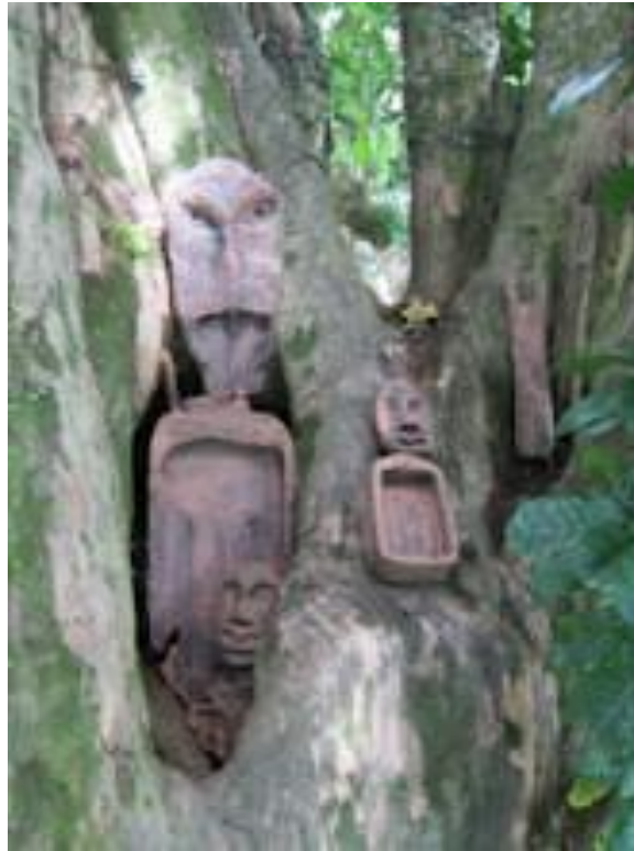
Figure 27: Maxwell H. (2011) Waka Tupapaku-inspired artefacts in Puriri on Whakapae land block

Fragments of waka tupapaku-inspired artefacts