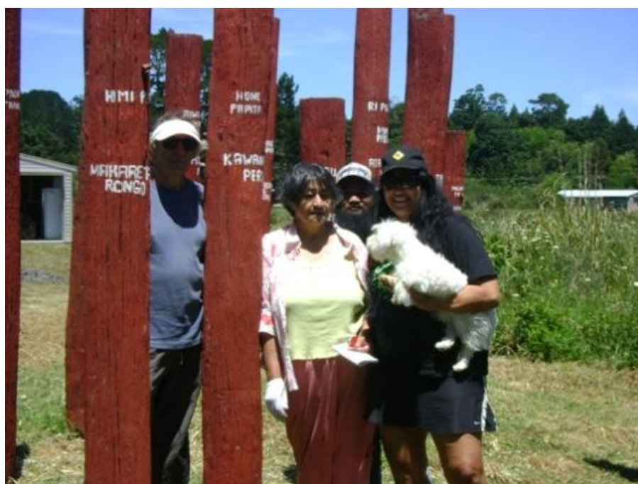
Figure 45: Maxwell H. (2011). Installation of Pouwhenua recalling the names of tupuna.

Names of Ngati Hau whenua facing outward toward the entrance to capture immediate attention.