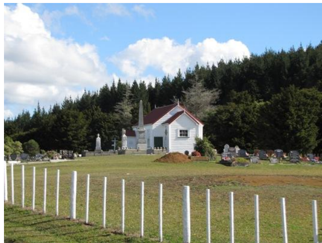
Figure 4: Maxwell. H. (2010) St Issac's Church and Wahi Tapu, Whakapara, Puhipuhi land block No. 5.