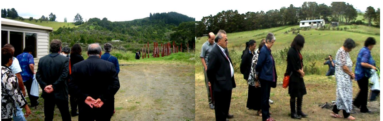
Figure 47: Nathan R. (2011) Karanga Call onto whenua and approach to Pou