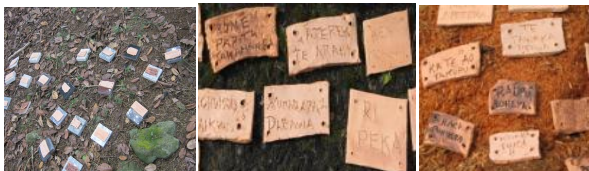
Figure 23: Maxwell H. (2011). Three images of named memorial tiles

aesthetic of the paraikete whero is fraught with notions of deceit, changes of allegiances, sale of land and bitter memories of loss.