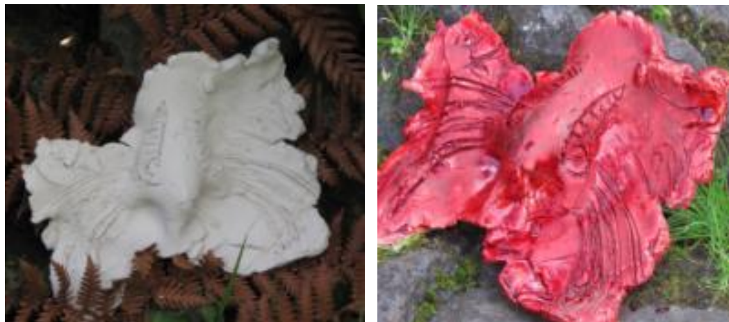
Figure 15: Maxwell. H (2010). Mokomokai inspired artefacts. 15.63cm x 12.32cm.

My face was used as the mould to define the nose and emphasis nasal markings to reference Kawiti’s nasal markings lamented about in his Takuatē. The bisque fired white stoneware mould was displayed on dry bracken fern to evoke the loss of the aruhe, a staple food source. The mould was covered with red flax dye to recall ‘kokowai’, delineate and accent full facial markings then displayed on waewaekaukau, source of taua (head wreaths) worn at tangi.