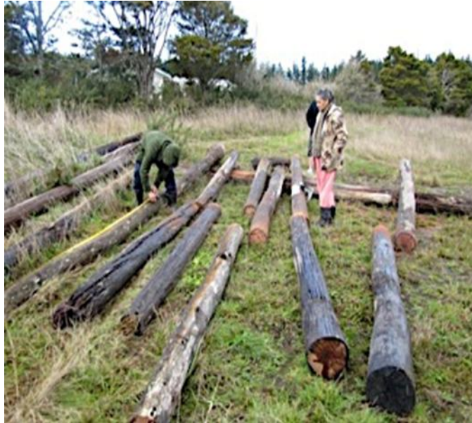
Figure 34: Maxwell H. (2010). Poles delivered to Te Maruata to be measured and cut, ready to install.

illness and family matters, a continual concern, have interrupted this work. These difficulties illustrate that I had not accurately taken into account the physicality and weight of individual poles.