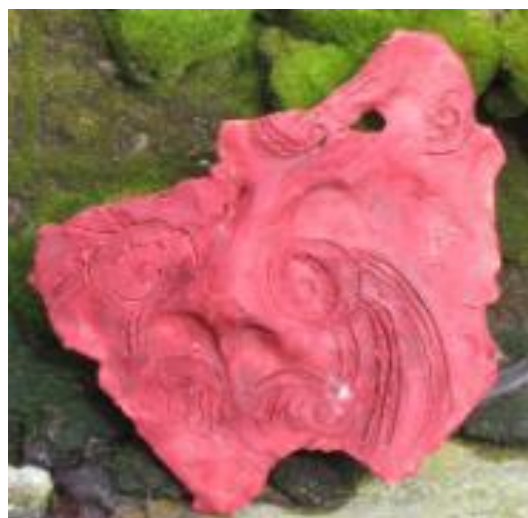
Figure 18: Maxwell. H (2011). Mokomokai-inspired artefact. 15.24cm x 15.24cm.

White stoneware, bisque fired and photographed in fernery with pikopiko in the foreground. A covering of red flax dye was applied before positioning on a moss covered ledge and photographed.