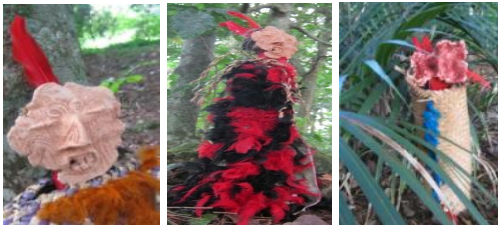
Figure 21: Maxwell H. (2011). Three effigies using mixed media.

Dressed effigies made up with painted red stakes 71.12cm x 3.81cm. Top to bottom [1] Korowai made with brown and white feathers, [2] Plain coloured taura covering with red and black feather border [3] kahu paake including flax stalks [4] korowai of green and yellow feathers, [5] hidden effigy with red and black feather border. Puriri leaves are used traditionally in Taitokerau as taua (mourning wreaths) worn by hunga kainga (home people and relatives) and manuhiri (travelling mourners). Puriri leaves placed around photographs of tupuna, during a tangi are considered a tohu (sign) that indicates the rate of decomposition of tupapaku (deceased). These customary practices are not widely understood or known.