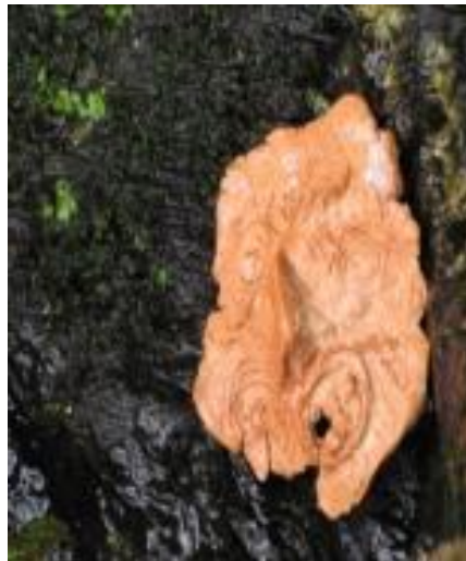
Figure 13: Maxwell.H (2011). Mokomokai inspired artefact. 13.97cm x 13.97cm.

Bisque fired mokomokai displayed on moss covered rock. Mouth is sewn with red dyed taura. Hair added as decoration.