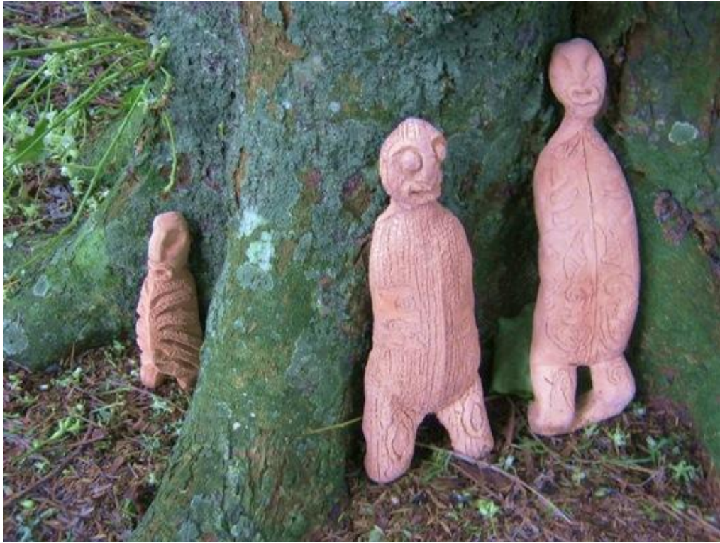
Figure 30: Maxwell H. (2011). Waka Koiwi-inspired artefacts.

Left to right, [1] Small bisque fired waka koiwi-inspired artefact covered with kokowai 16.51cm x 10.16cm, [2] bisque fired waka koiwi-inspired artefact, covered with kokowai.26.67cm x 11.43cm], [31.75cm x 12.7cm] bisque fired and covered with kokowai. All the figures are female and are displayed at the base of a totara tree.