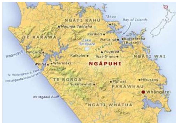
Figure 1: Rawiri Taonui. 'Ngapuhi', Te Ara – the Encyclopedia of New Zealand, update 24-Sept-11.

The boundary of Ngapuhi is referred to as Te Whare Tapu O Ngapuhi, the sacred house of Ngapuhi and is marked by a series of mountains which stand as Pou to hold the house upright. There are several versions of Te Whare Tapu O Ngapuhi. It is the skill of the orator to stand, to speak and to place themselves within the sacred house. The mountain Manaia is sited close to Whangarei, and a speaker from Whangarei would stand to recite Te Whare Tapu O Ngapuhi beginning from Manaia and ending at Manaia.