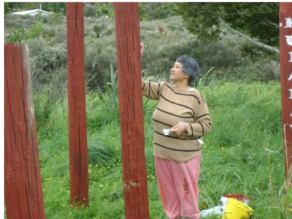
Figure 40: Maxwell H. (2011). Pouwhenua Installation.

Two views of painting the poles and clearing around pouwhenua installation.