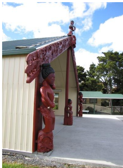
Figure 5: Maxwell. H. (2010) Carved Marae at Akerama