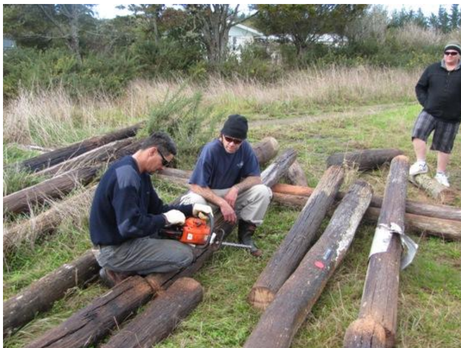
Figure 35: Maxwell H. (2010). Measuring and sizing poles.

Makura Hussey and Rewi Carpenter measure out poles ready to be cut into agreed lengths.