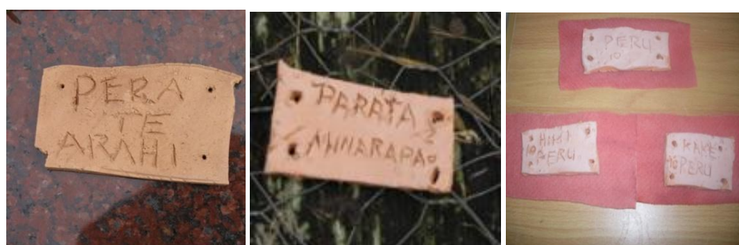
Figure 24: Maxwell H. (2011). Three images of named memorial tiles

Named Memorial tiles of varying lengths and size. Left to right [1] Named memorial tiles on memorial stone off-cuts laid out on floor of small bush [2] six named tiles on wet peat soil [group of named memorial tiles on saw dust.