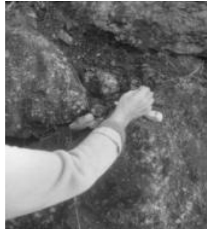
Figure 31: Maxwell H. (2010) Tiki wananga-inspired artefacts.

Variations in length between 25.44cm x 7.62 and 30.48cm x 10.6cm. Taken onto Ngunguru Ford road, on Whakapae land block to display on embankments. Wanted to photograph tiki wananga-inspired artefact falling out of embankment or being found unexpectedly in the earth. They were not bisque fired and were the first of this study to be photographed.