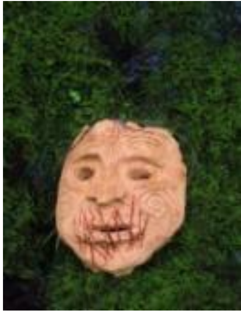
Figure 12: Maxwell. H (2011). Mokomokai-inspired artefact. 15.24cm x 13.97cm.

Bisque fired mokomokai displayed on moss covered rock. Mouth is sewn with red dyed taura. Hair added as decoration.