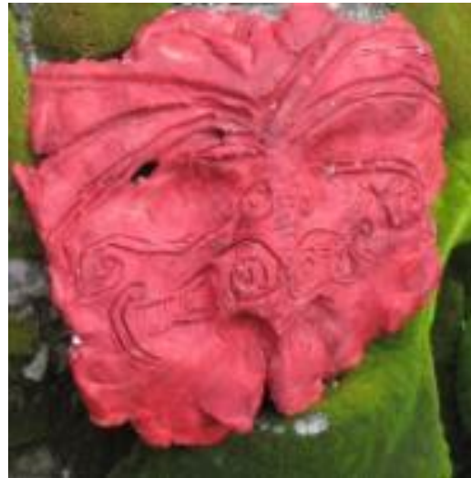
Figure 16: Maxwell. H (2011). Mokomokai-inspired artefacts. 15.24cm x 15.24cm.

The white stoneware was deliberately manipulated to exhibit a crudely executed and distorted facial identity. After it was bisque fired a covering of red flax dye was applied. By the end of the mokomokai trade the high quality and workmanship of mokomokai had ceased.