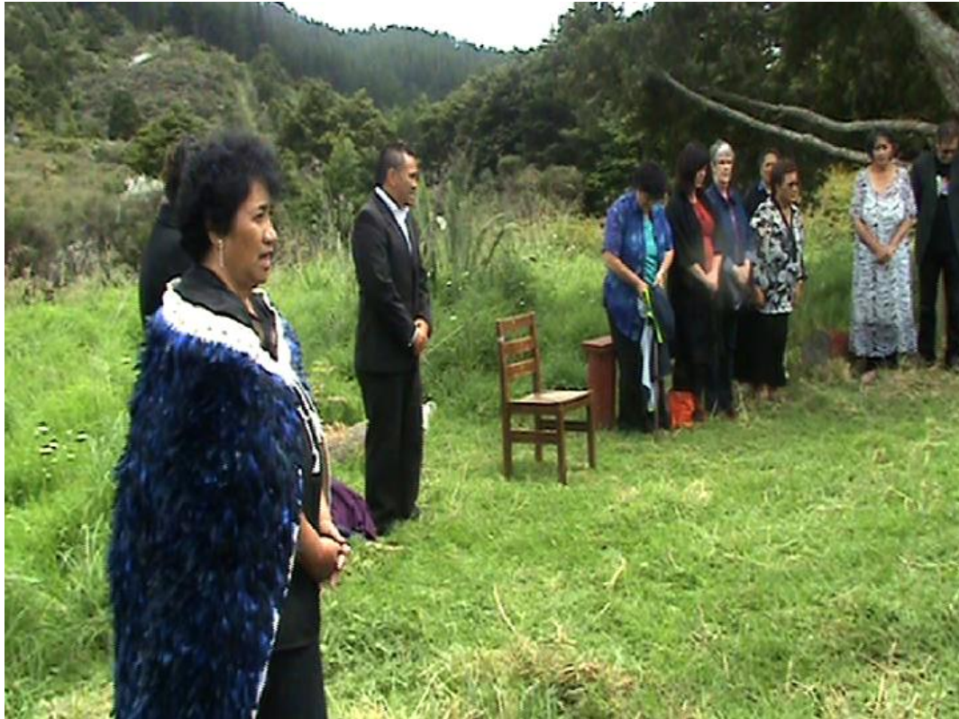
Figure 50: Nathan R. (2011) Formalities to address the tapu of manuhiri and hunga kainga