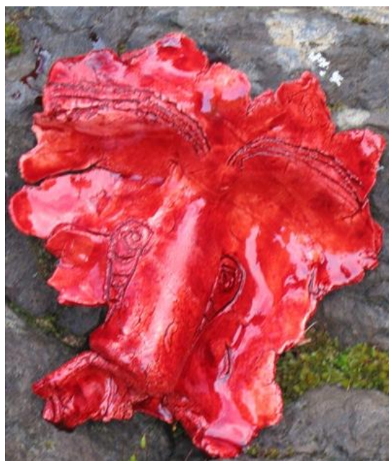
Figure 17: Maxwell. H (2011). Mokomokai-inspired artefact. 15.34cm x 20.45cm.

Fragment of facial mould made from white stoneware. It was bisque fired, covered with red flax dye, immersed in water and photographed.