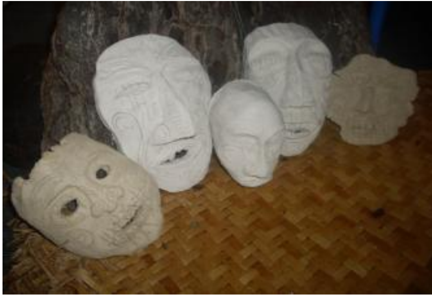
Figure 8: Maxwell H. (2010). Five mokomokai-inspired artefacts on whariki.

Damp clay moulds in the final stages of the drying process. When dried they were bisque-fired at a temperature of 1000 F. Left to right: [1] 15.24cm x 13.97cm, [2] 15.24cm x 20.32cm, [3] 10.6cm x 12.7cm, [4] 12.7cm x 21.59cm and [5] 13.97cm x 13.97cm.