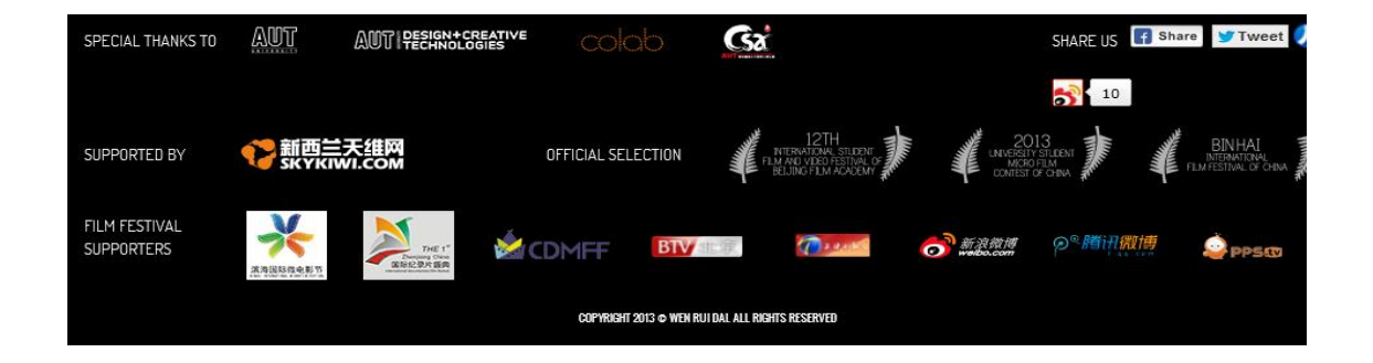
Image showing official supporters of my film from New Zealand and China.

In the wake of the creation of the website, cooperation with other major online platforms began to push forward further promotion. As shown in the above graph, the AUT CO-LAB and I were committed to contacting film festival committees, television stations and online websites. Skykiwi is the first website I made a contract with, and the link to my film is placed on its homepage. Through professional platforms such as film festivals, television stations and online video