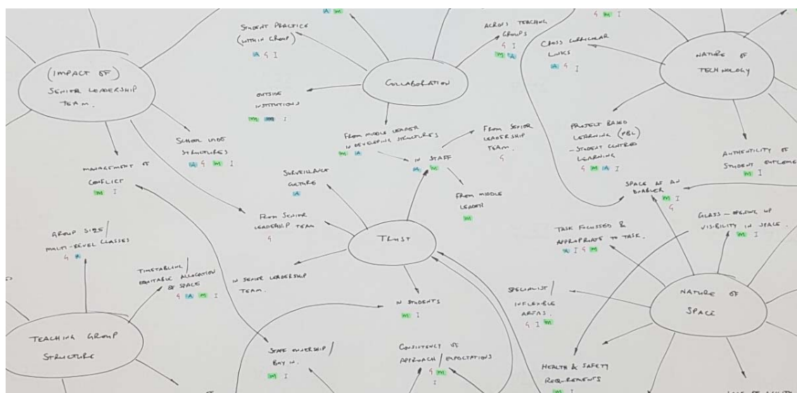
Figure 4. Thematic Analysis Map

provision of teacher agency. Naturally the themes of trust, collegiality, culture and collaboration evolved to trust, flexibility and agency. This occurred as it was felt that collaboration, culture and collegiality were too broad and were actually products of trust, flexibility and agency. Table 3 Themes for data analysis on page 38 illustrates the final themes used for coding. The transcripts were coded using these finalised themes to allow for the data and lived experiences within them to be analysed. These themes also form the structure in presenting the results of each participant in chapter 4.