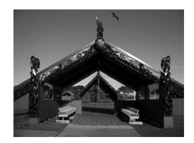
Waha roa at Orakei Marae, Auckland (2003).