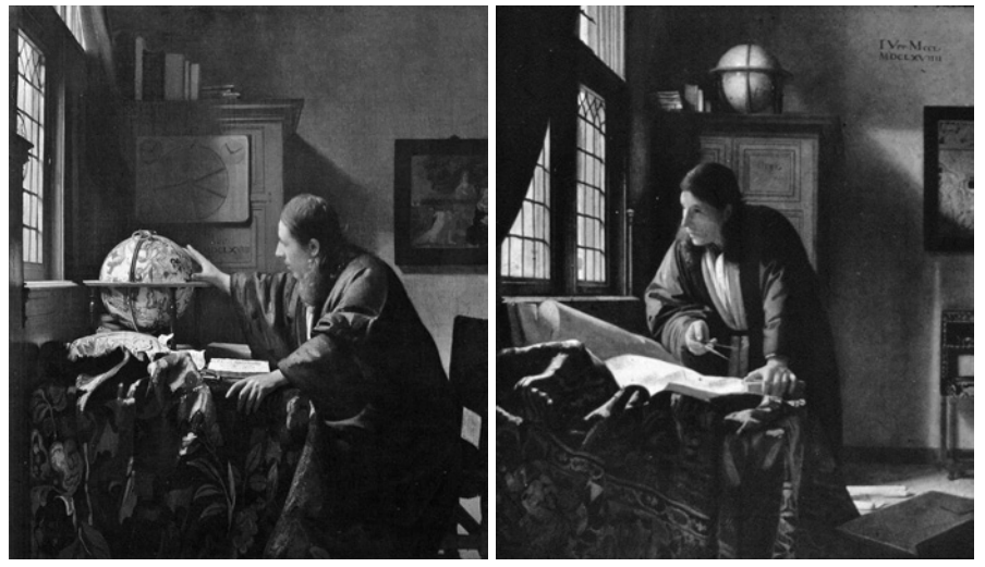
(1668) and The Geographer (1668-9).