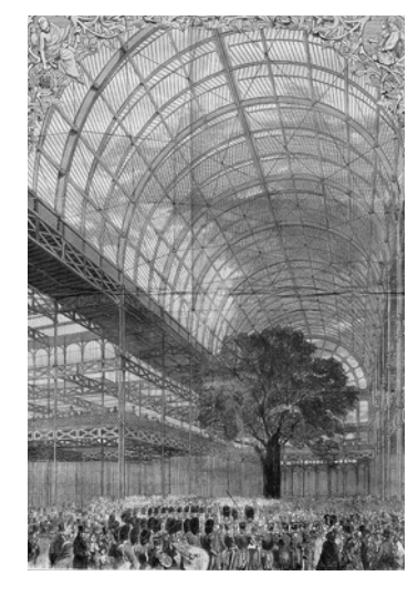
The Last Promenade at the Crystal Palace, from Illustrated London News (1852)

Thus, despite Sloterdijk's lucid articulation of Western modes of inclusion and exclusion, the dramatic, original difference between inside and outside he posits (1998: 84) plays out in his own work as specific divisions between "with-us and