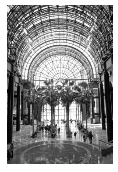
World Financial Center Winter Garden (2007).

5 Sloterdijk shifts towards more consciously Eurocentric positions over the years that lie between the first volume of Sphären and Im Weltinnenraum.