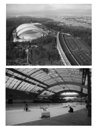
Miyazaki Ocean Dome (SeaGaia), Japan, interior and exterior (2007).