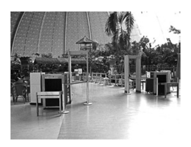
Entrance to Tropical Islands Resort, Brandt, Germany (2006).

3 "Immunisation is the construction of protective tissue as a prevention against invaders and insulters." (Mönninger 2009: 9)